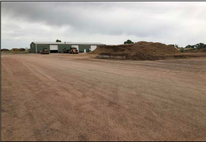
Photo 1 – Equipment support and stockpile area on west side of permit area.