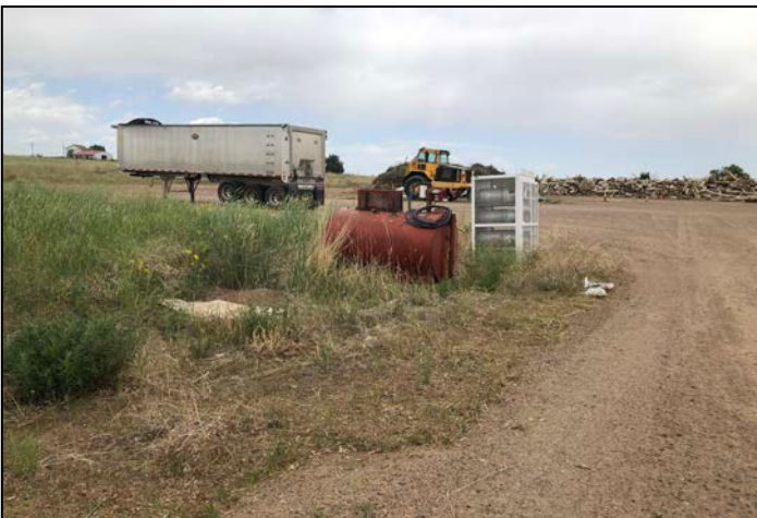
Photo 5 – Unused fuel tank without containment that will need to be removed from site along with other trash/refuse.