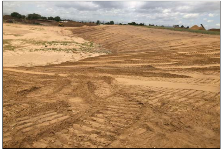
Photo 2 – Mining area in SE corner of permit with slopes reclaimed to 3:1.