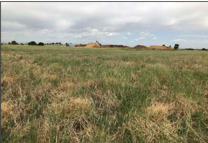
Photo 3 – Unaffected area in east center of permit area with composting operation visible in background.