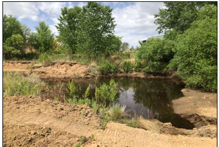
Photo 4 – Small area of exposed groundwater/impounded runoff in west center of permit that will need to be eliminated.