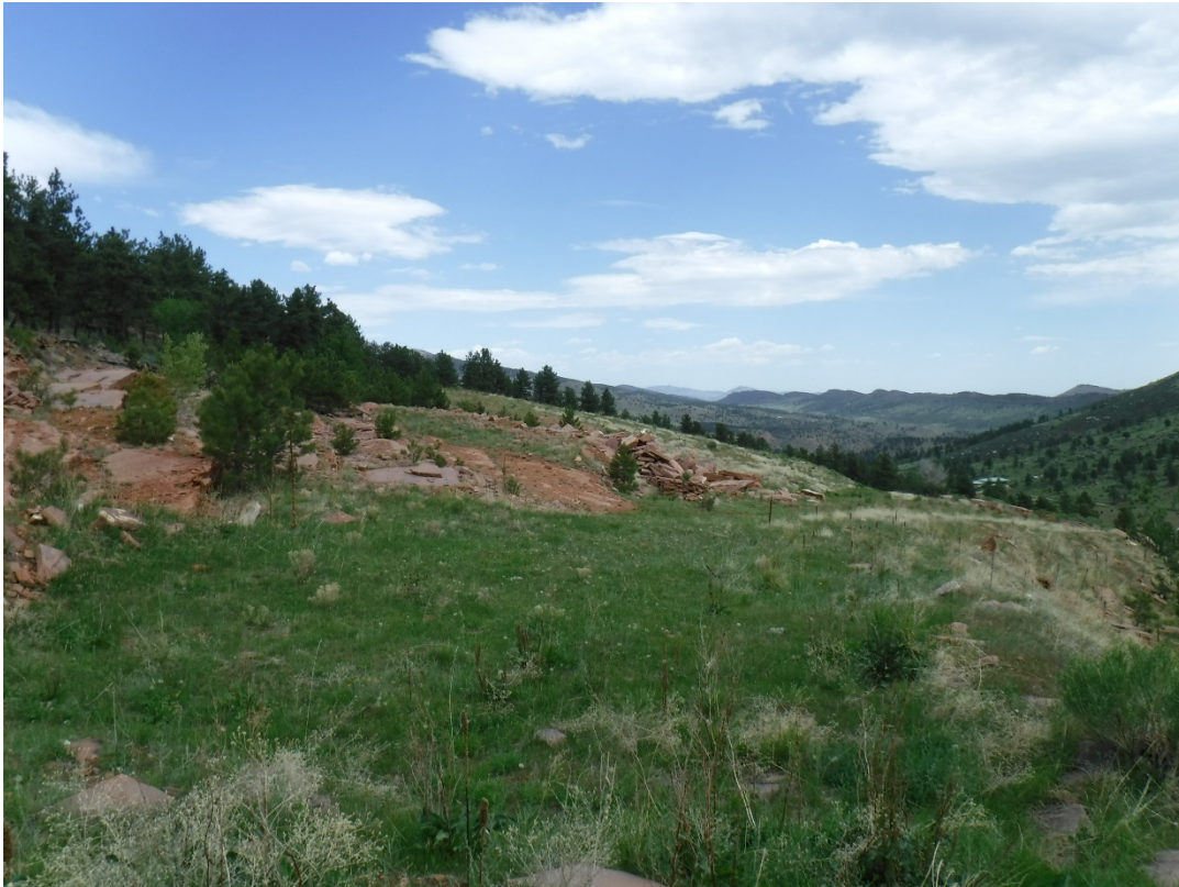
Photo 10: Looking towards the southwestern pit area, note stacked material in the center and the right of center of picture