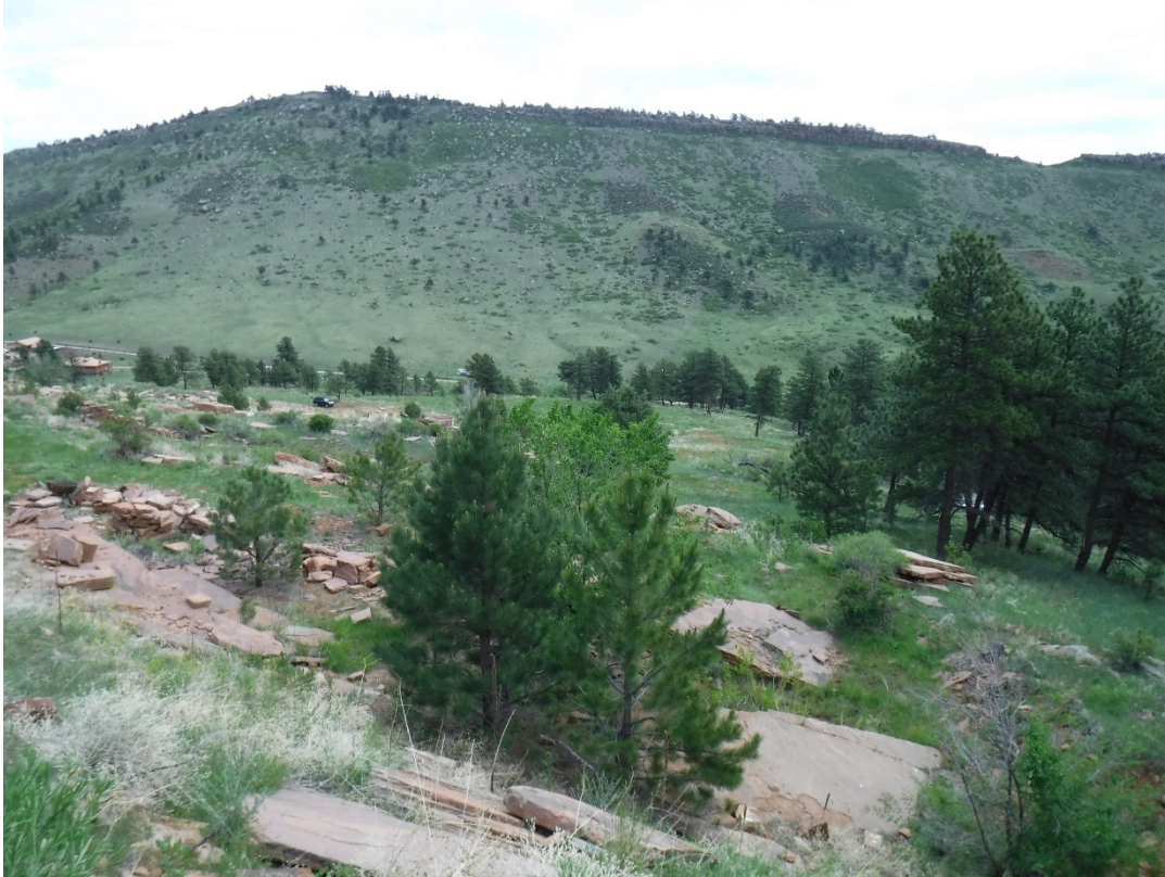
Photo 9: Looking towards the southeastern pit area, note stacked material to be sold