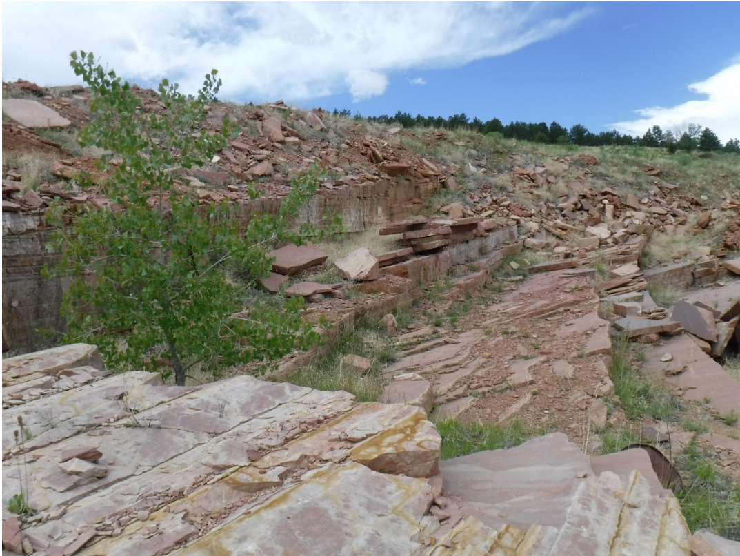
Photo 4: Pit area in the southeastern portion of the site needs to be graded to 3H:1V