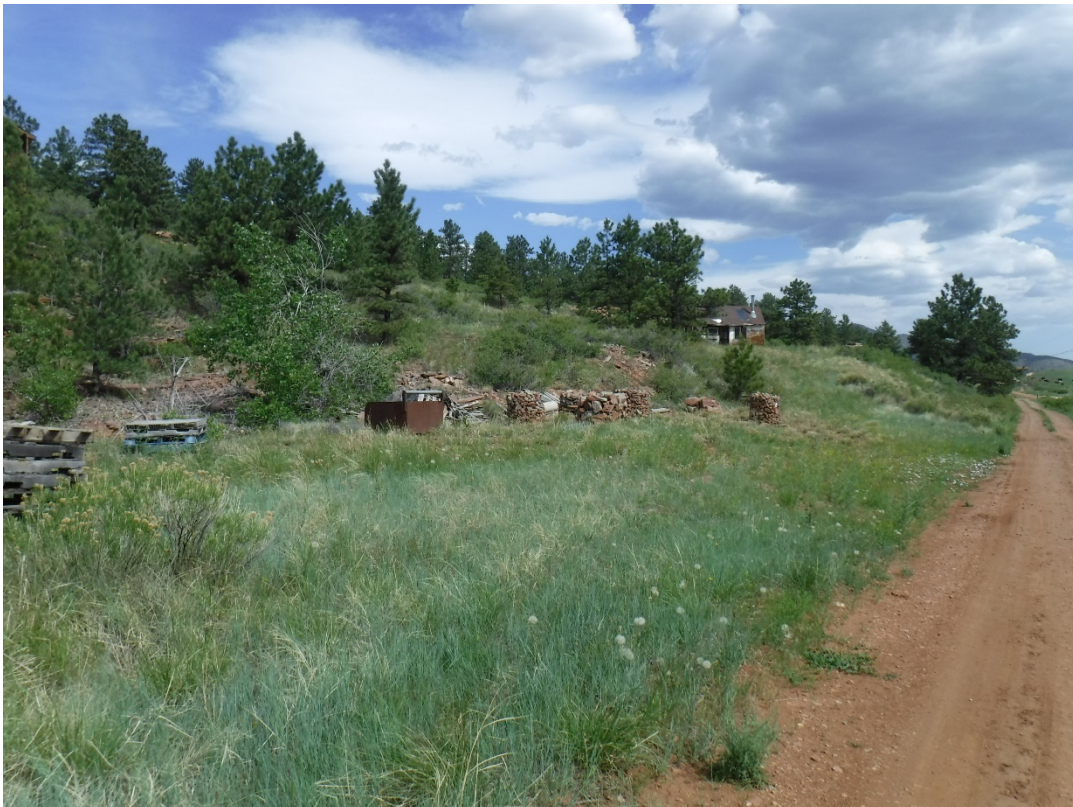
Photo 2: Storage area for marketable material, naturally reclaimed and road to right of picture to remain after reclamation