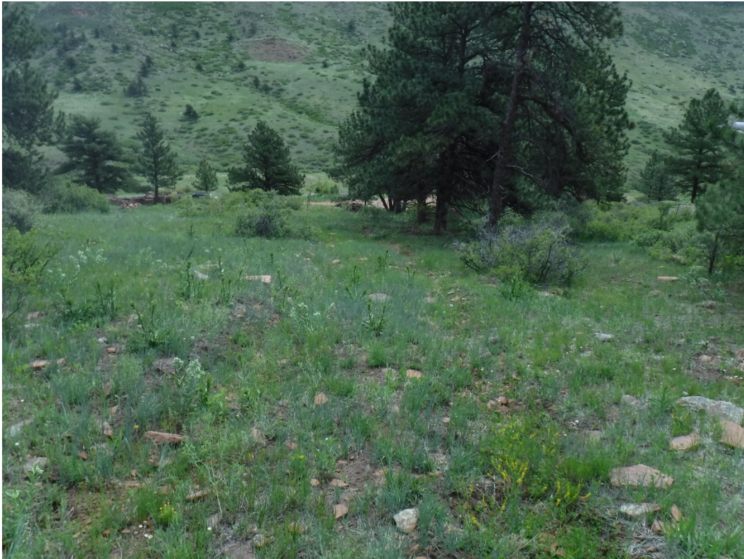
Photo 8: Typical vegetation in areas where the moss rock was removed