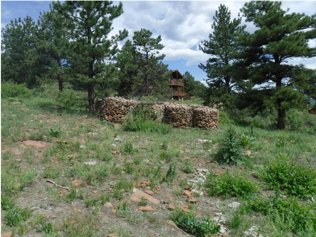
Photo 6: Additional pallets of material along the southern portion of permit boundary, operator's residence in background