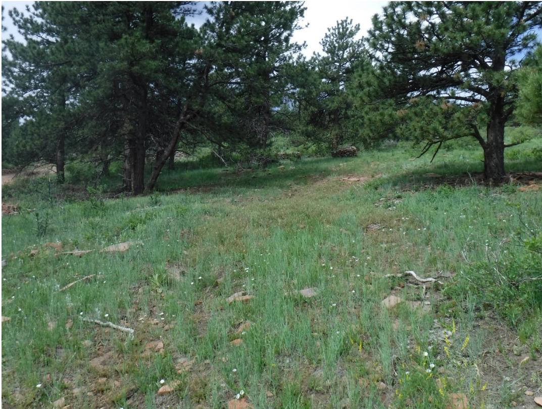
Photo 5: Road along southern portion of permit area, naturally reclaimed, note pallets of material near center of picture