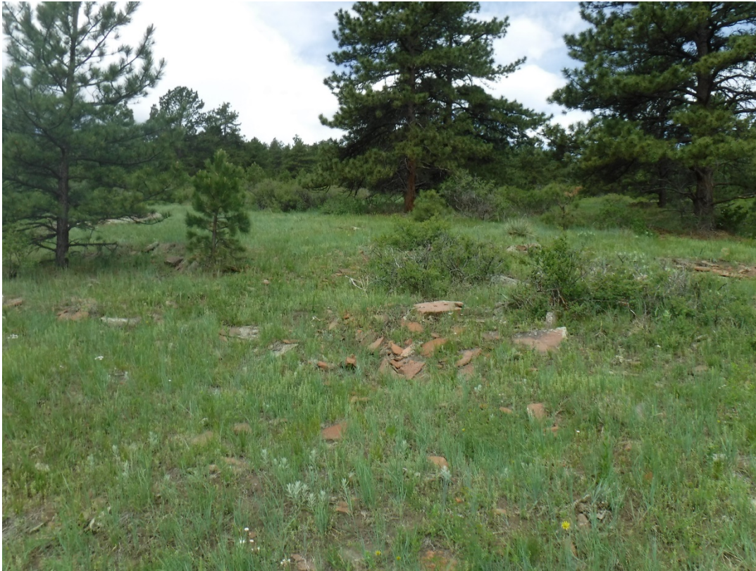
Photo 7: Typical vegetation in areas where the moss rock was removed