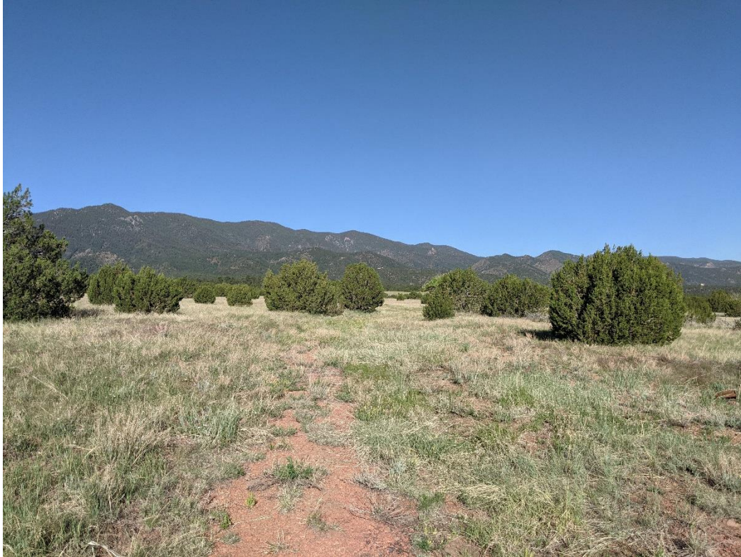
Two track road.

Number of Partial Inspection this Fiscal Year: 0