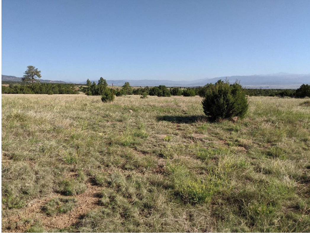
NW-MW well pad.

The reclaimed substation access road vegetation remains sparse due to usage post-reclamation. No recent use on the road was observed. The reclaimed substation pad is established with vegetation. The area blends well into the adjacent undisturbed lands. No issues were observed.