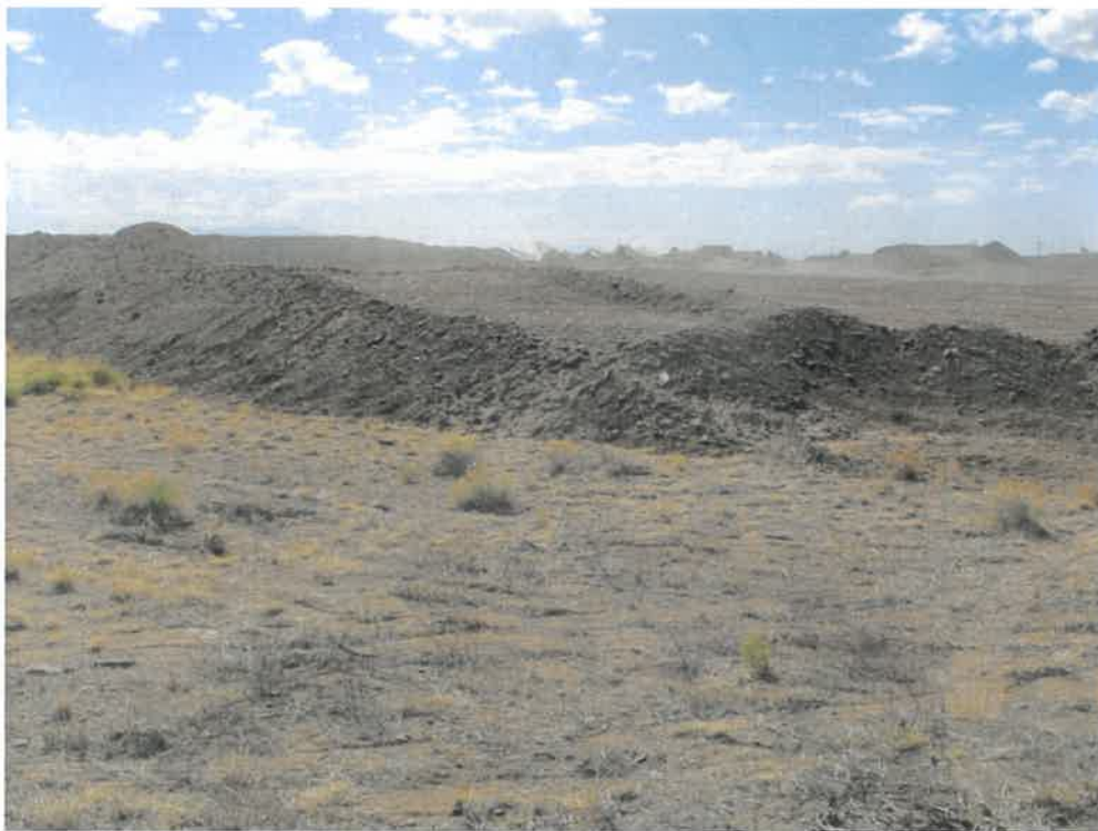
For information only: Photo #6 is the west end of Phase IV looking eastward