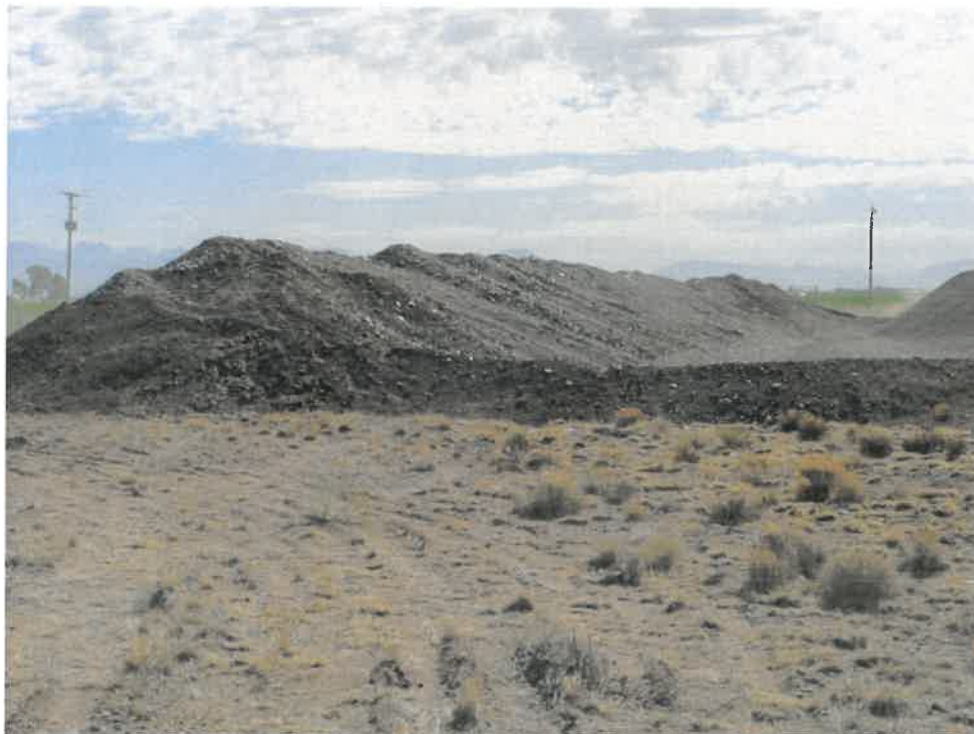
Photo #4 taken from west end of Phase V topsoil stockpile looking eastward