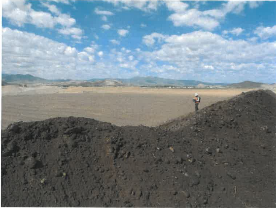
Photo #3 taken near the eastern edge of topsoil stockpile in Phase IV. Employee is broadcasting seed on wetted soil. Entire stockpile (Phase IV and V) were seeded simultaneously.