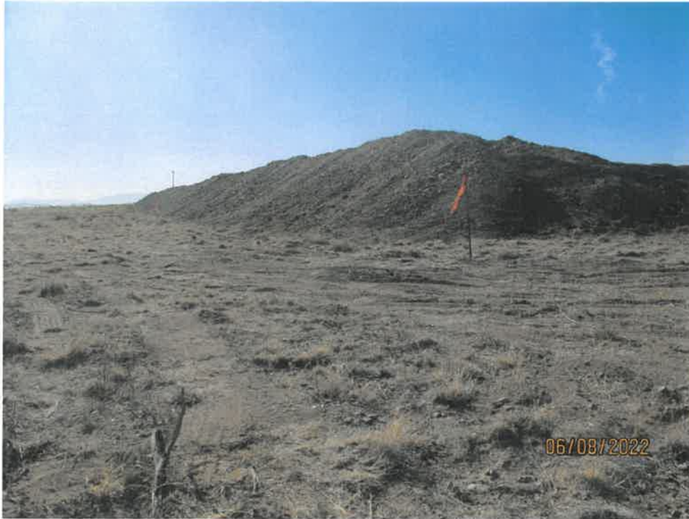
Photo #5 is taken from the northwest corner of Phase V looking eastward down the north edge of the topsoil stockpile