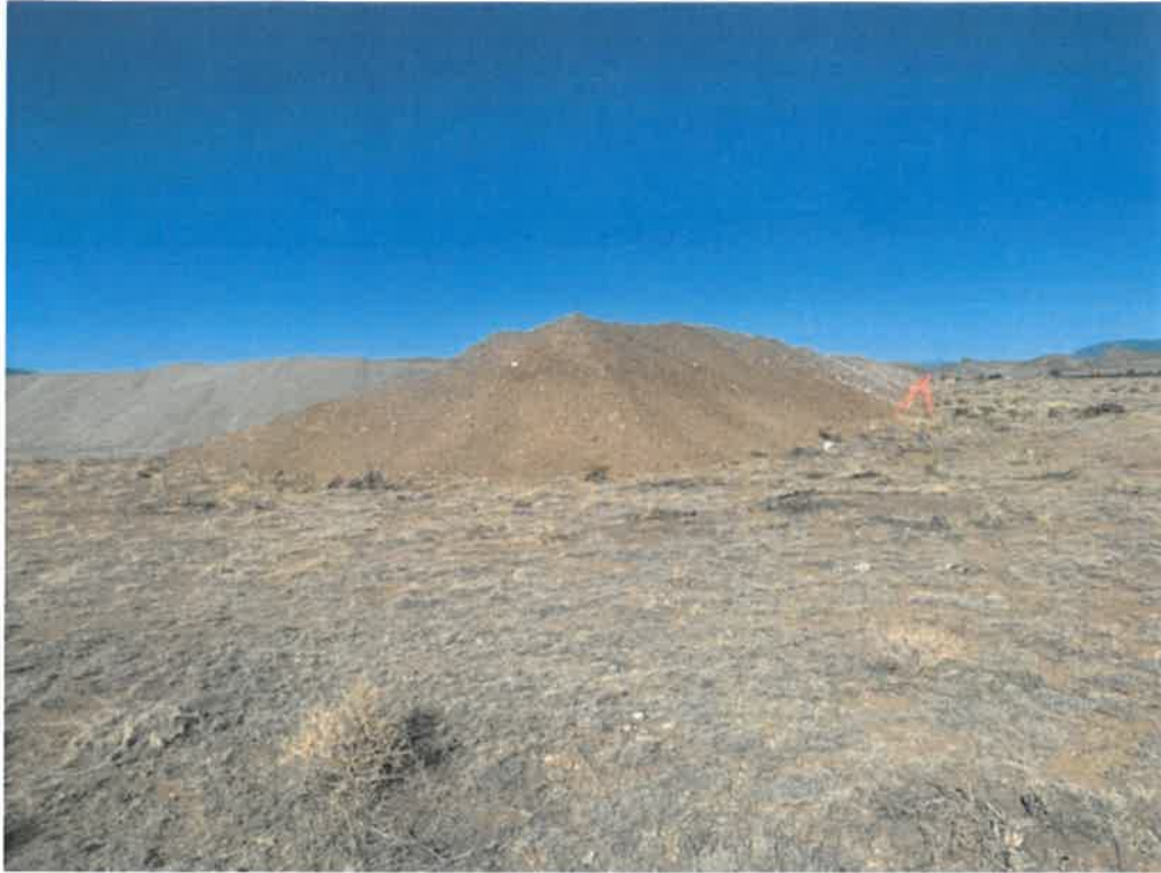
Photo #1 Taken from the northeast corner of Phase V looking due west.