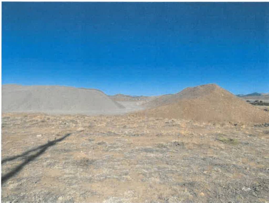
Photo #2 taken from just south of the northeast corner of Phase V looking westward