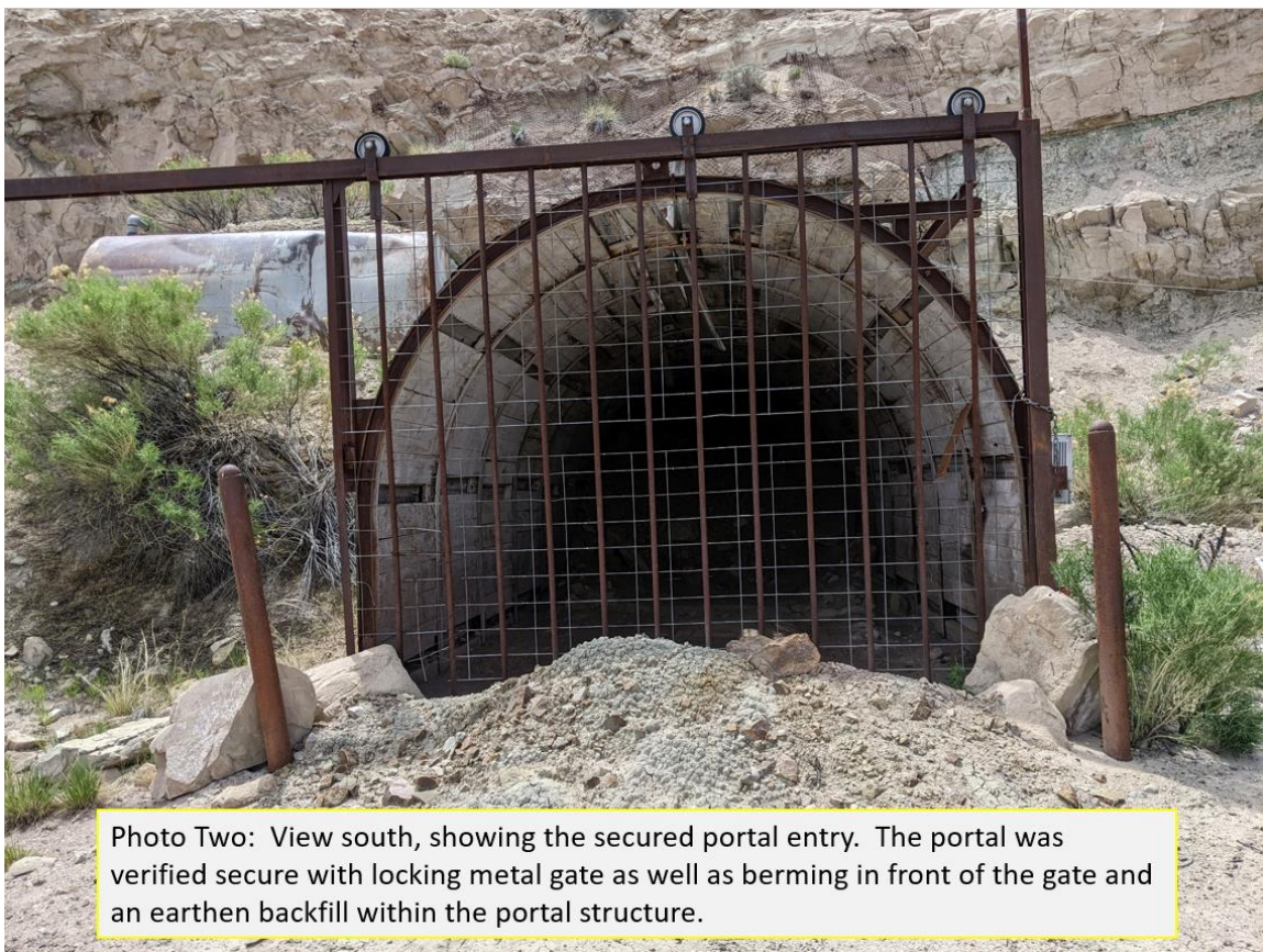
Photo Two: View south, showing the secured portal entry. The portal was verified secure with locking metal gate as well as berming in front of the gate and an earthen backfill within the portal structure.