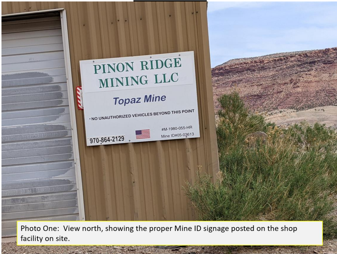
Photo One: View north, showing the proper Mine ID signage posted on the shop facility on site.