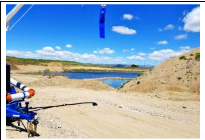
North excavated pit looking north