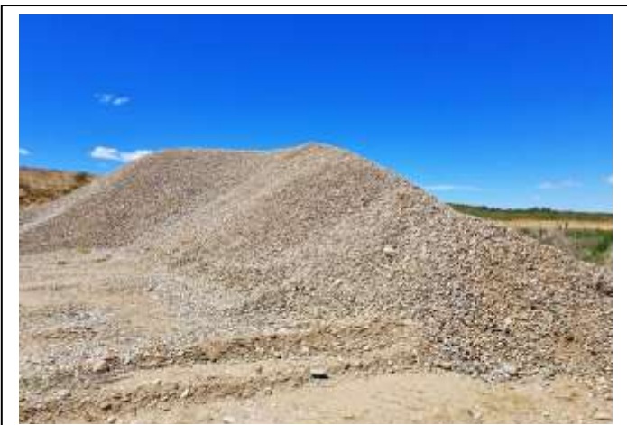
Stockpile of processed material, approximately 15 ft high