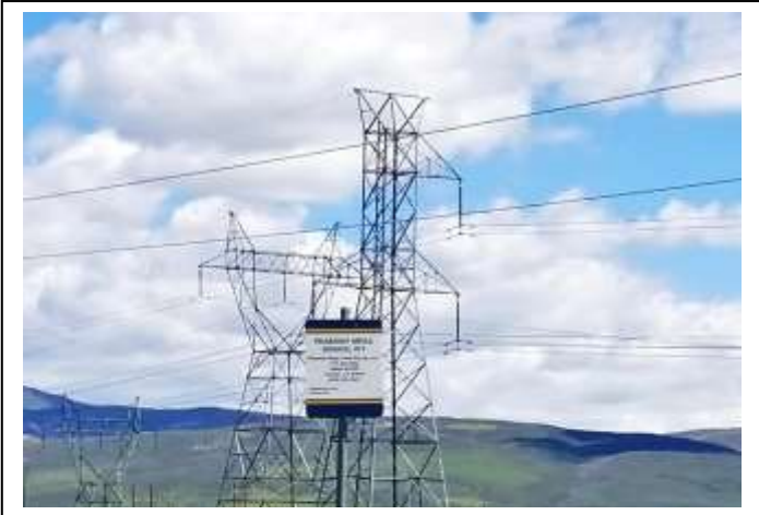
Mine ID sign