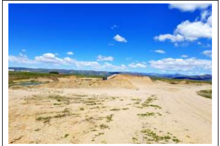
Pit overview, looking north