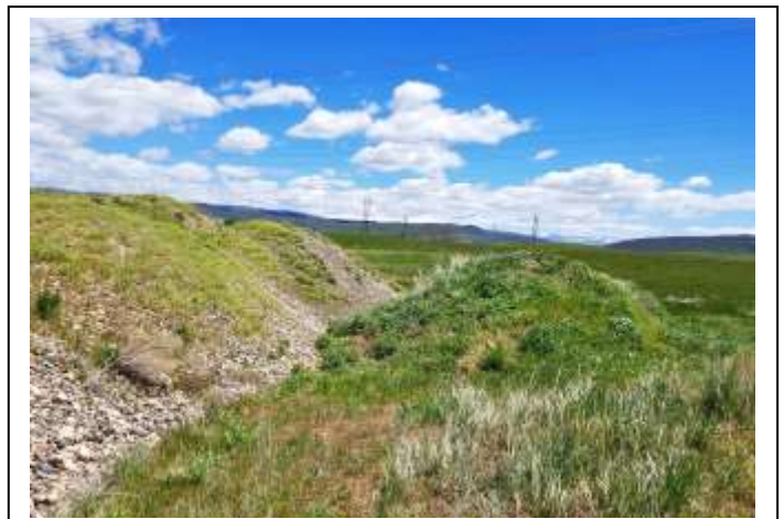
Stockpile at east side of pit. Mostly covered in cheatgrass