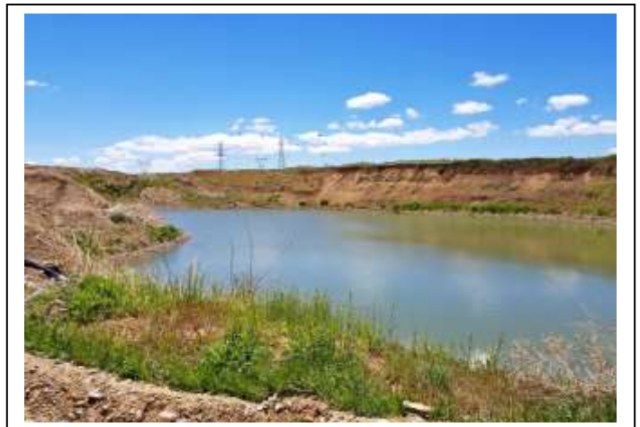
South excavated pit looking south