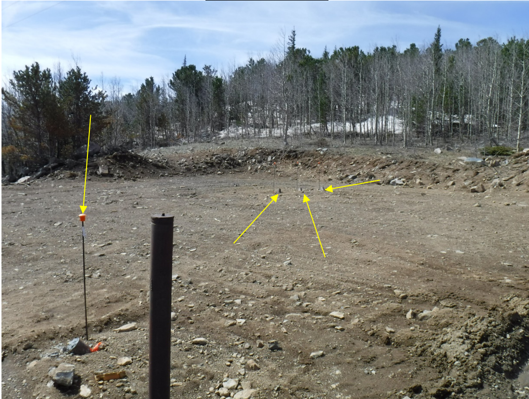
Photo 1: Looking south across the drill pad, boreholes indicated with yellow arrow, the other steel pole is a survey marker