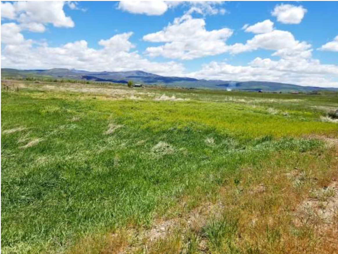
Photo below is taken of this area north of Hwy40 looking north.