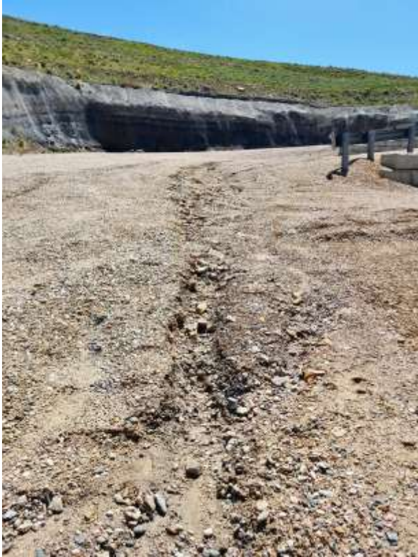
Below: Flume being undercut