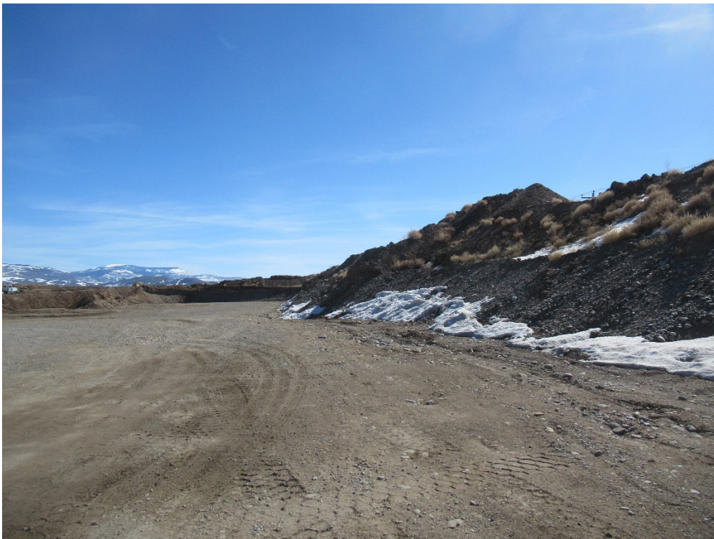
View of the pit floor and highwalls in Phase 3 and 4