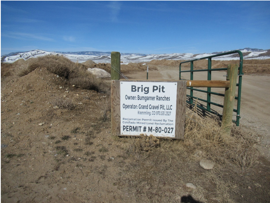
Bumgarner Ranches Gravel Pit mine sign