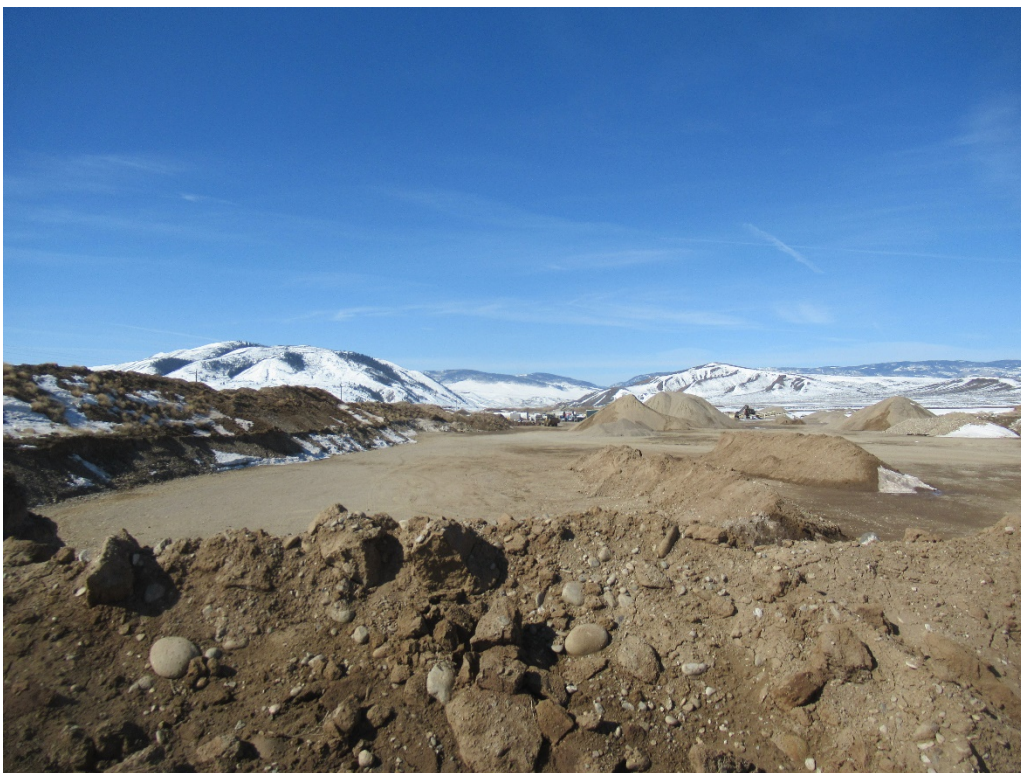
View of the site from the east highwall in Phase 4 looking west