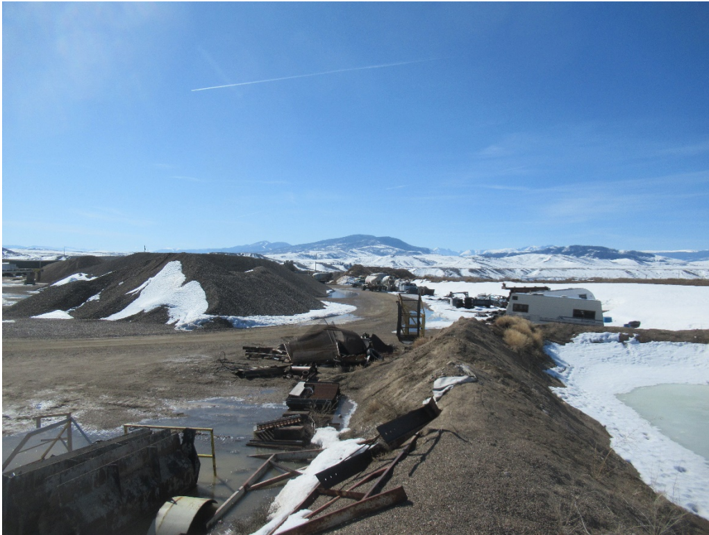
View of the site from the northwest corner of Phase 1 looking south