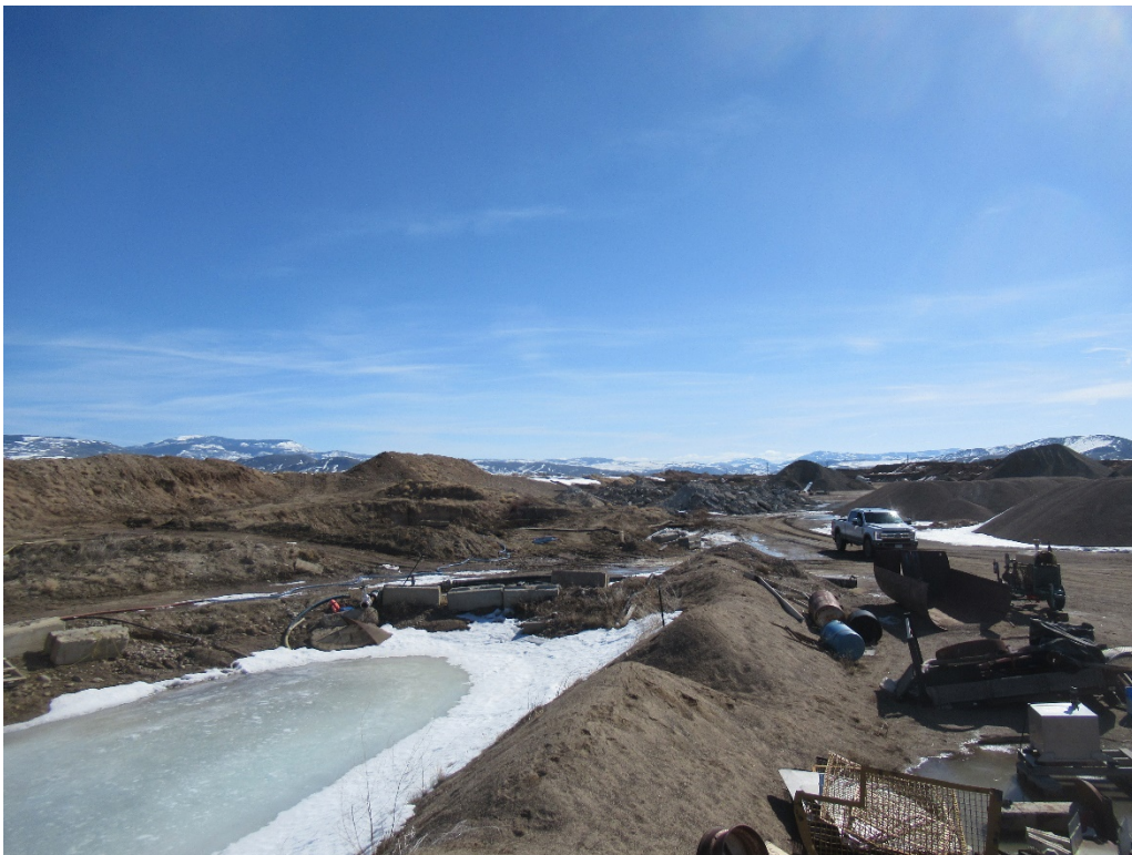
View of the site from the northwest corner of Phase 1 looking east