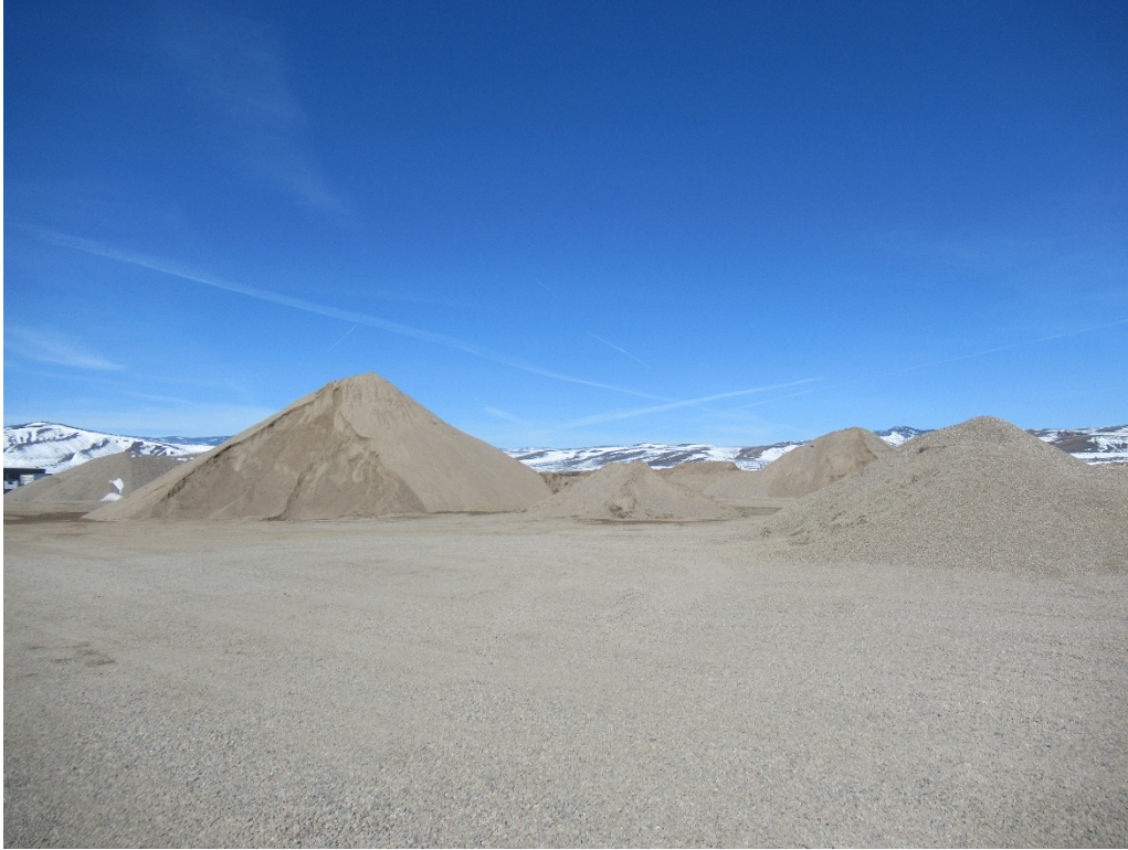
View of the stockpiled materials on the pit floor