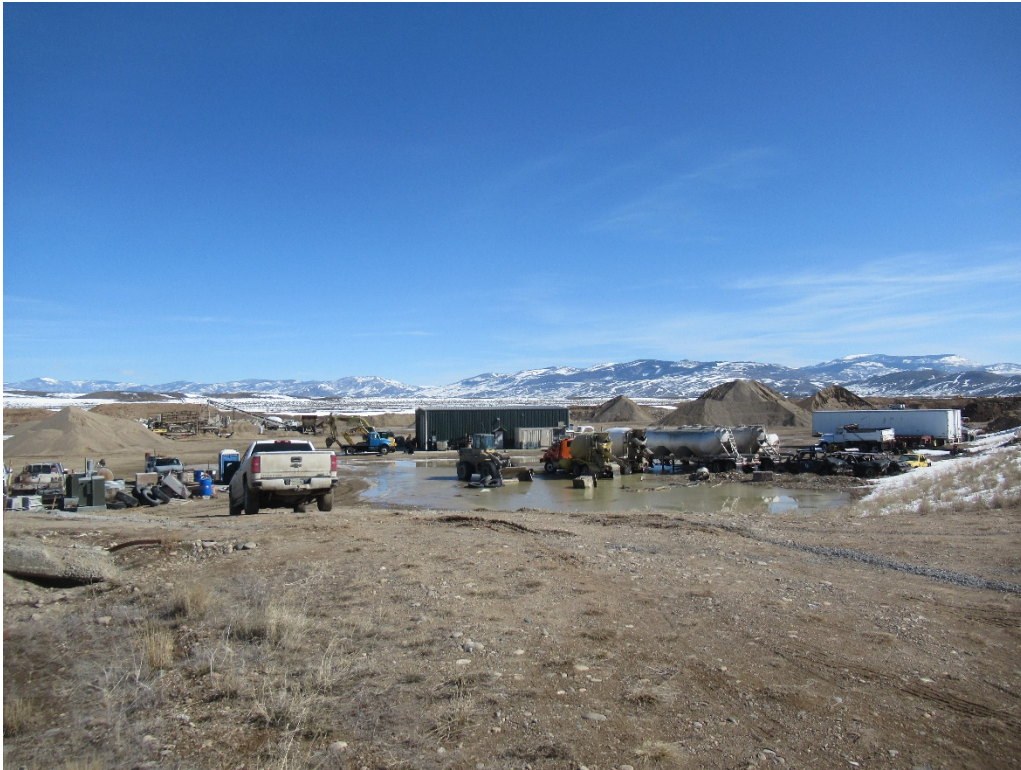
View of the site from the west side of Phase 1 looking east