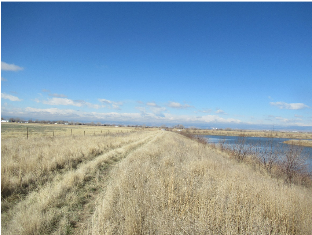
View of the site from the SE corner looking west