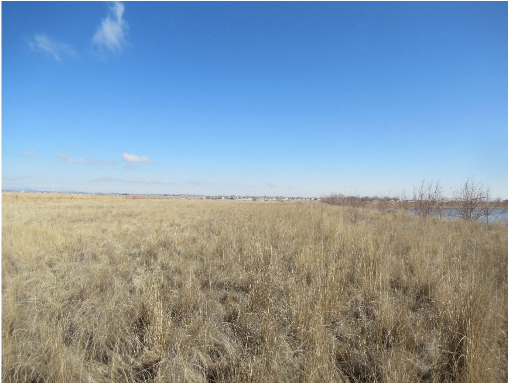
View of the site from the SW corner looking north