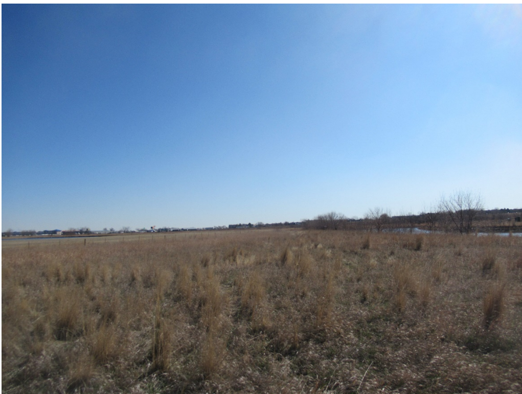
View of the site from the NW corner looking east