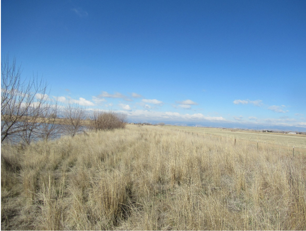
View of the site from the NE corner looking west