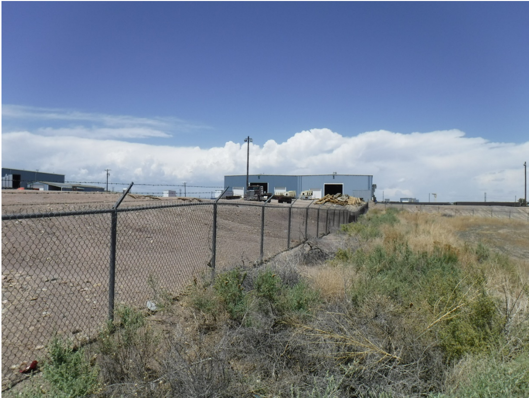
Photo 10: Looking north along the east boundary of the release request parcel