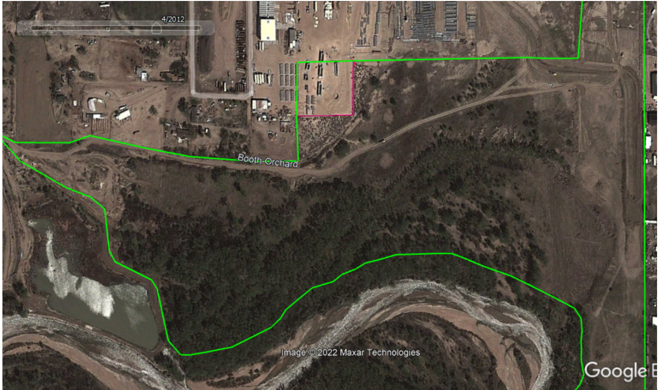
Photo 4: Aerial image from 2012, Phase 7 boundary in green and release area in magenta