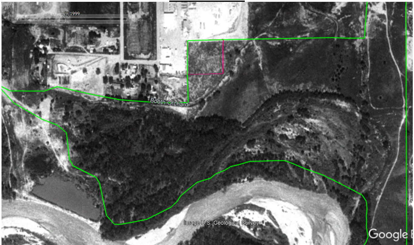
Photo 1: Aerial image from 1999, Phase 7 boundary in green and release area in magenta