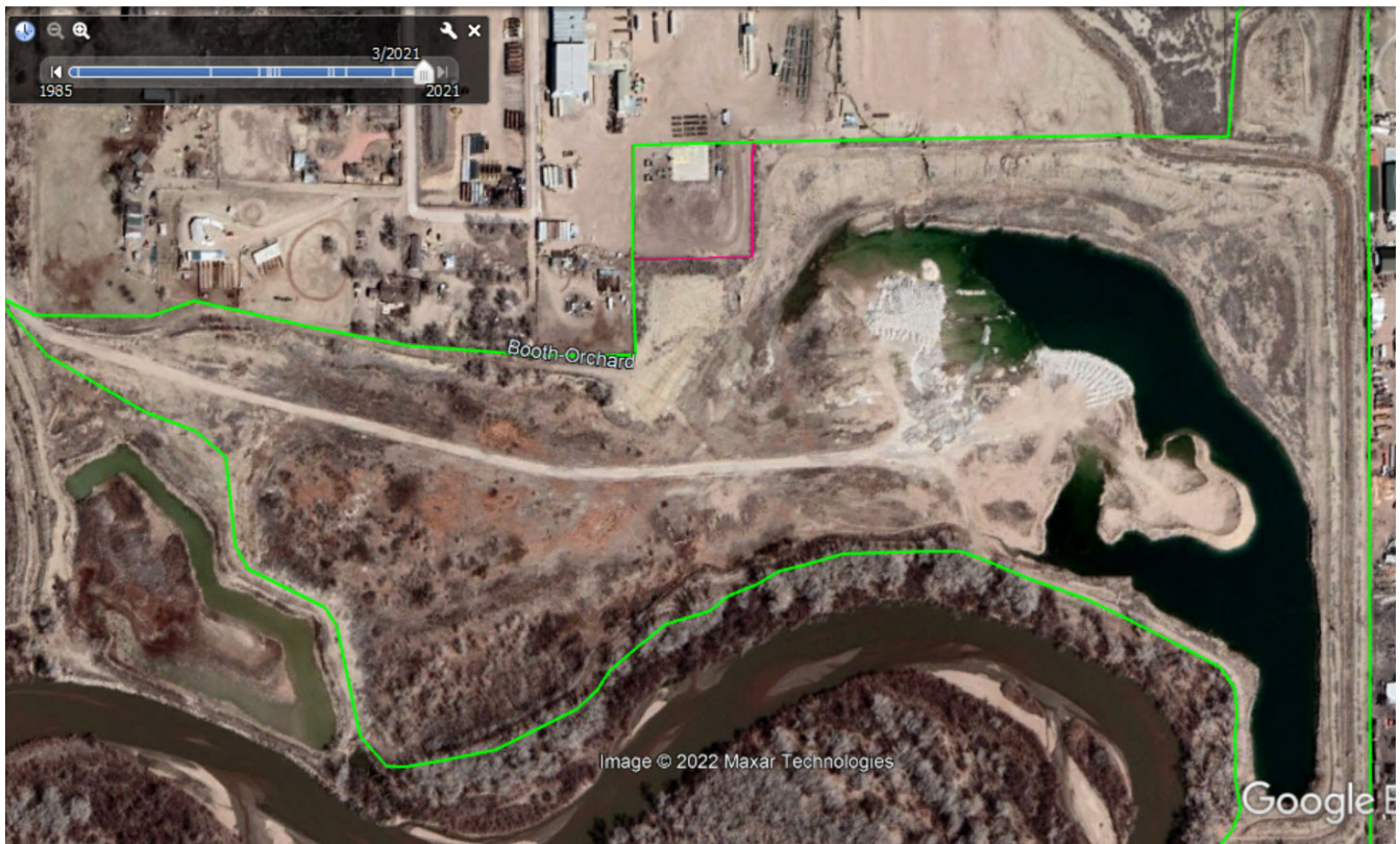
Photo 6: Aerial image from 2021, Phase 7 boundary in green and release area in magenta