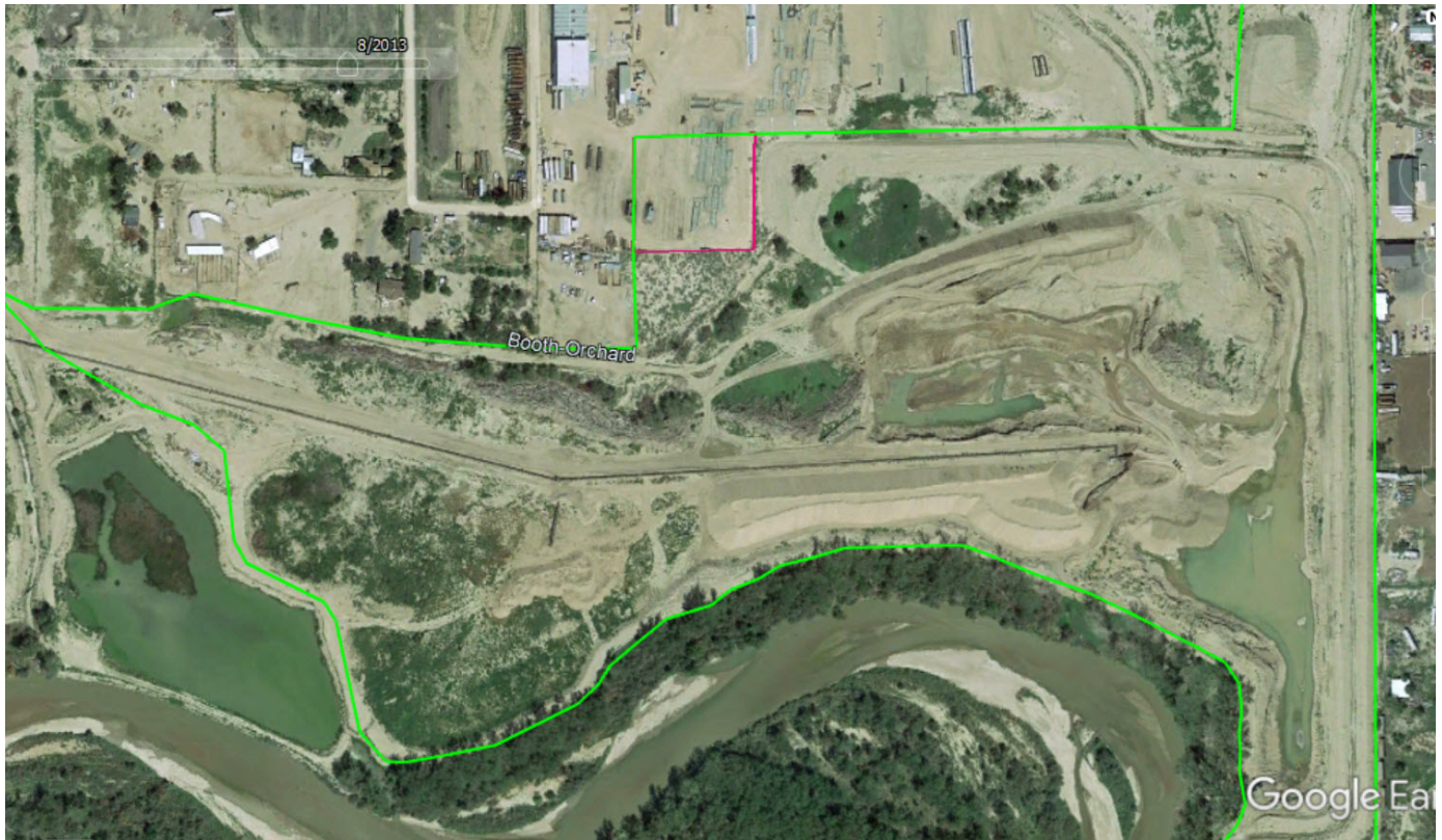
Photo 5: Aerial image from 2013, Phase 7 boundary in green and release area in magenta