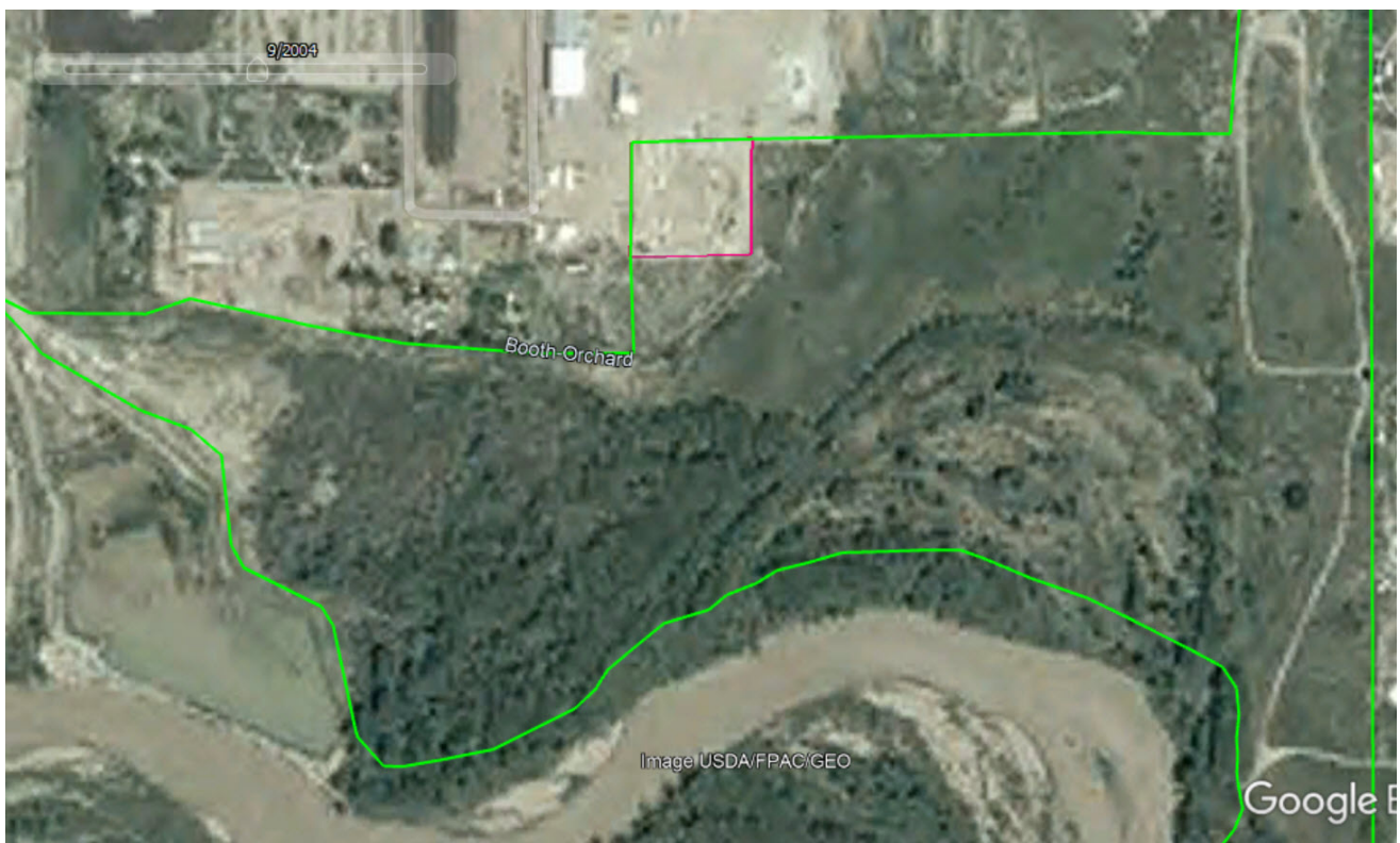
Photo 2: Aerial image from 2004, Phase 7 boundary in green and release area in magenta