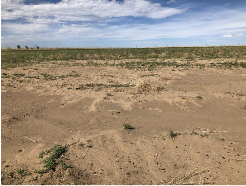
Bare area in reclaimed Long Term Spoil Area