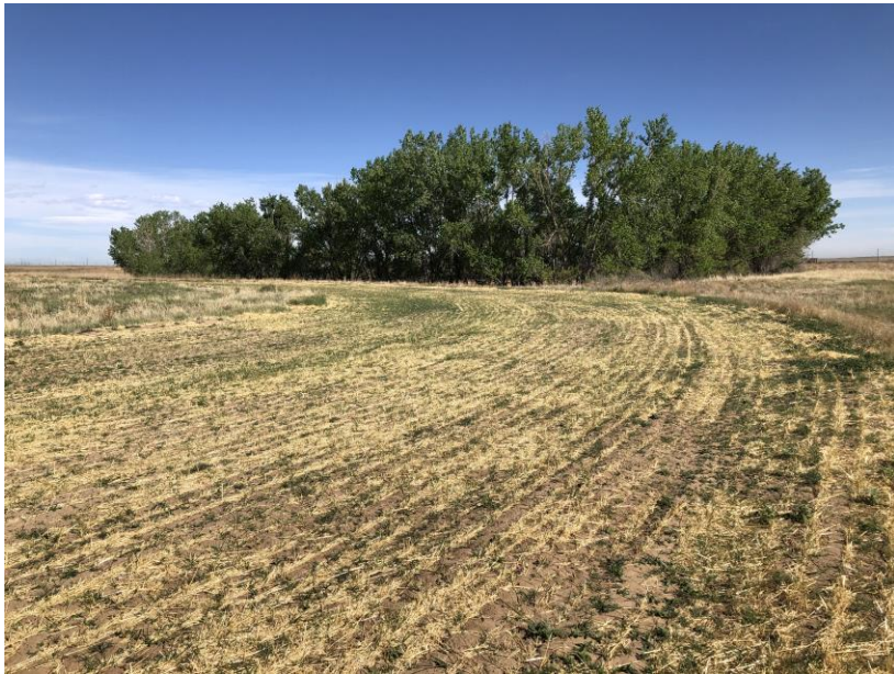
Reclaimed road by Sediment Pond 2

Number of Partial Inspection this Fiscal Year: 7