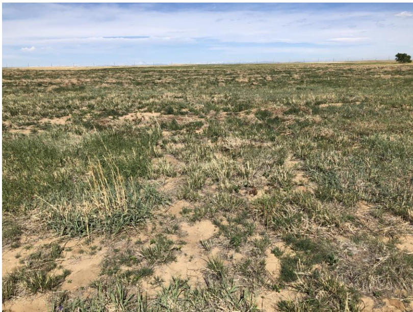
Center of Area 25

Number of Partial Inspection this Fiscal Year: 7