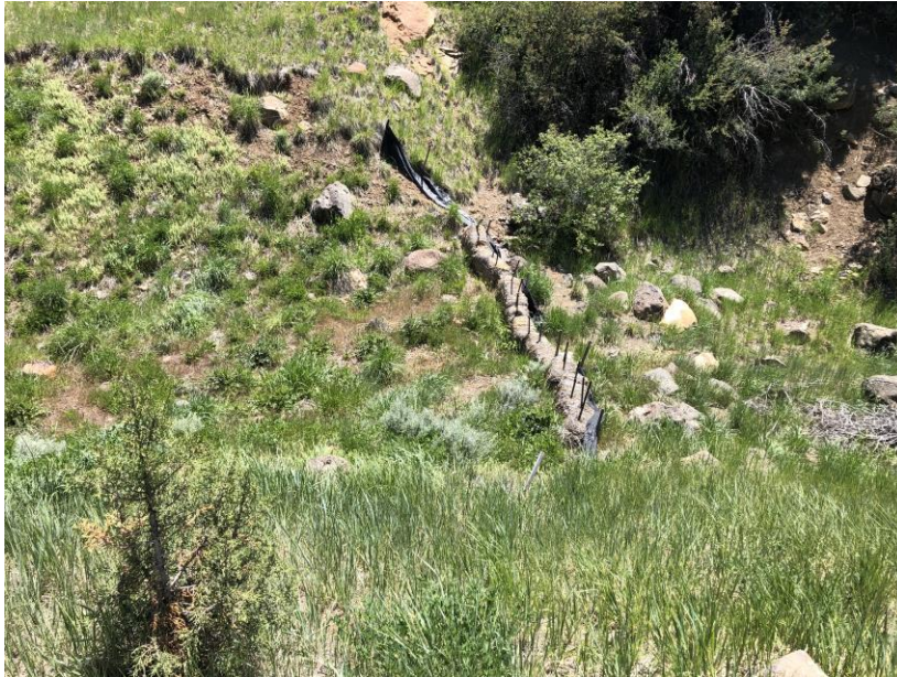
BMPs at the reclaimed Pond 4 (East Mine)