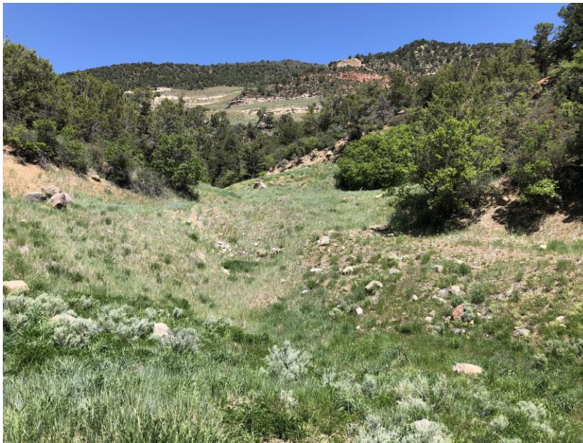
Looking up the drainage above reclaimed Pond 4 towards the Old Waste Storage Area

Number of Partial Inspection this Fiscal Year: 6