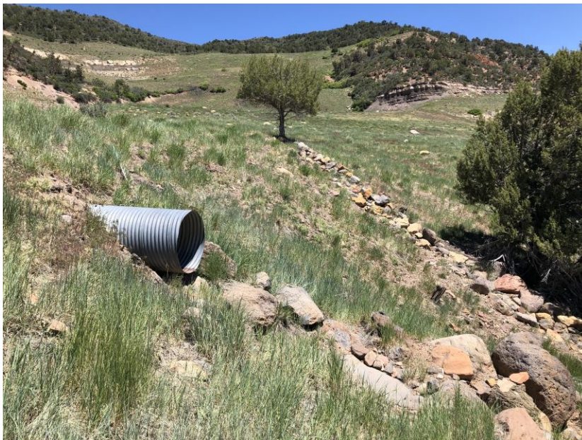
Culvert west of RDA

Number of Partial Inspection this Fiscal Year: 6