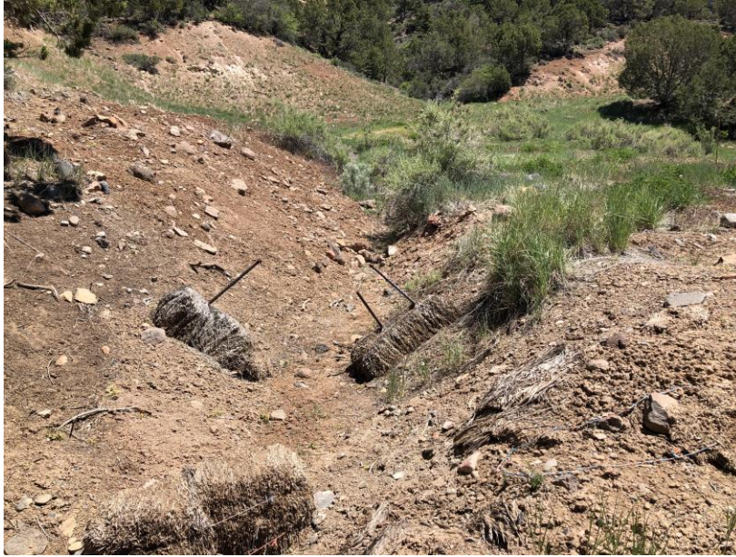
Maintenance need along the haul road at East Mine (next to western switchback west of RDA)