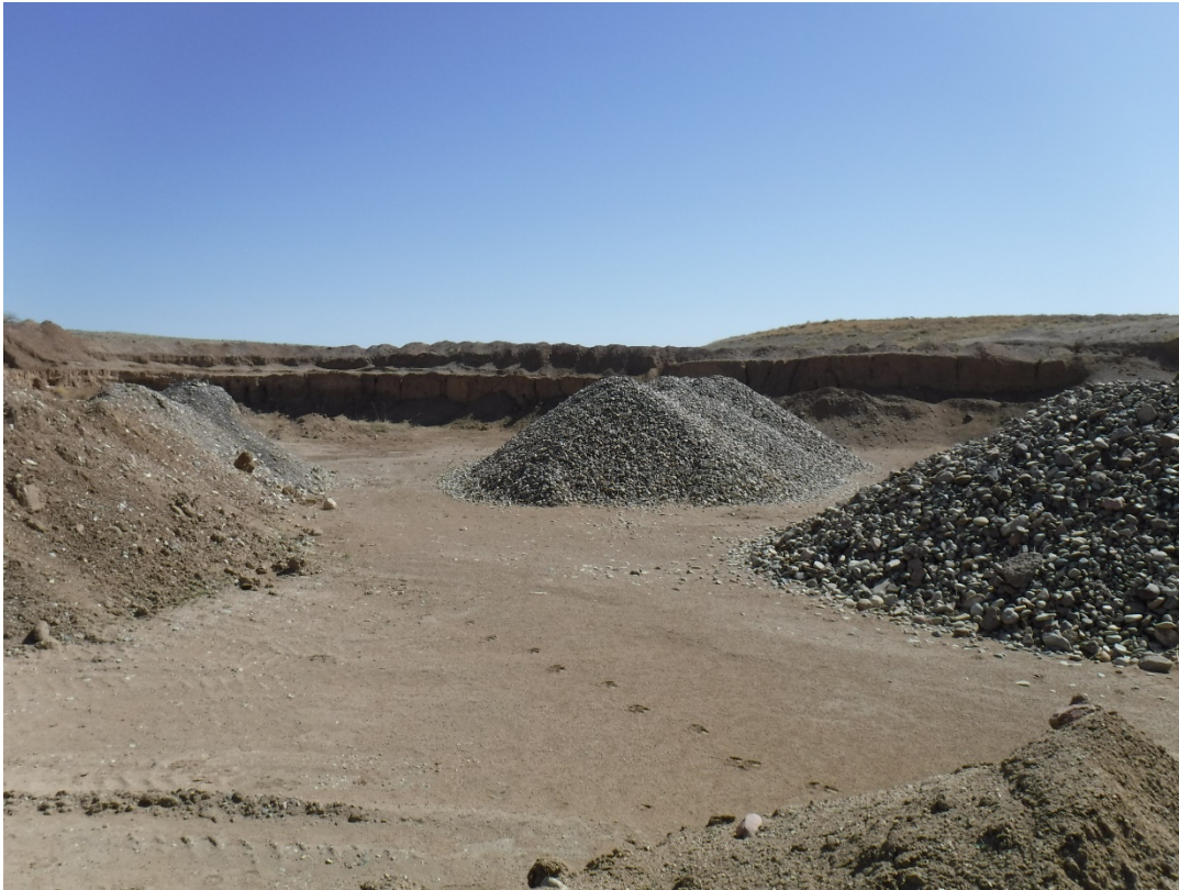
Photo 3: Looking northeast from main pit area, note near vertical highwalls