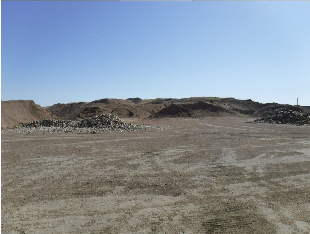
Photo 1: Looking north from near the mid-point of the southern permit boundary