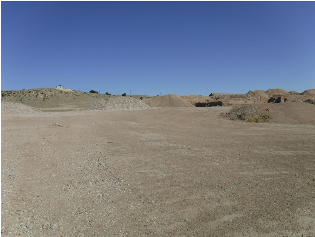
Photo 2: Looking west from near the mid-point of the southern permit boundary