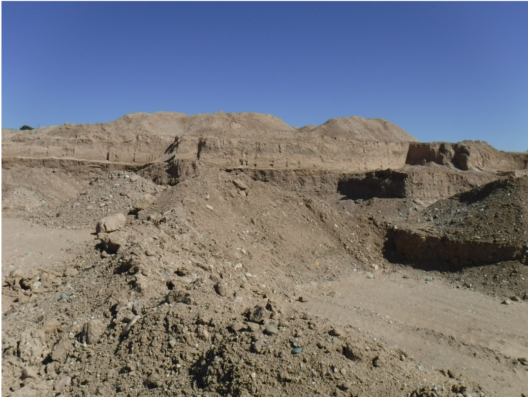
Photo 4: Looking northwest from main pit area, note near vertical highwalls and stockpile overburden