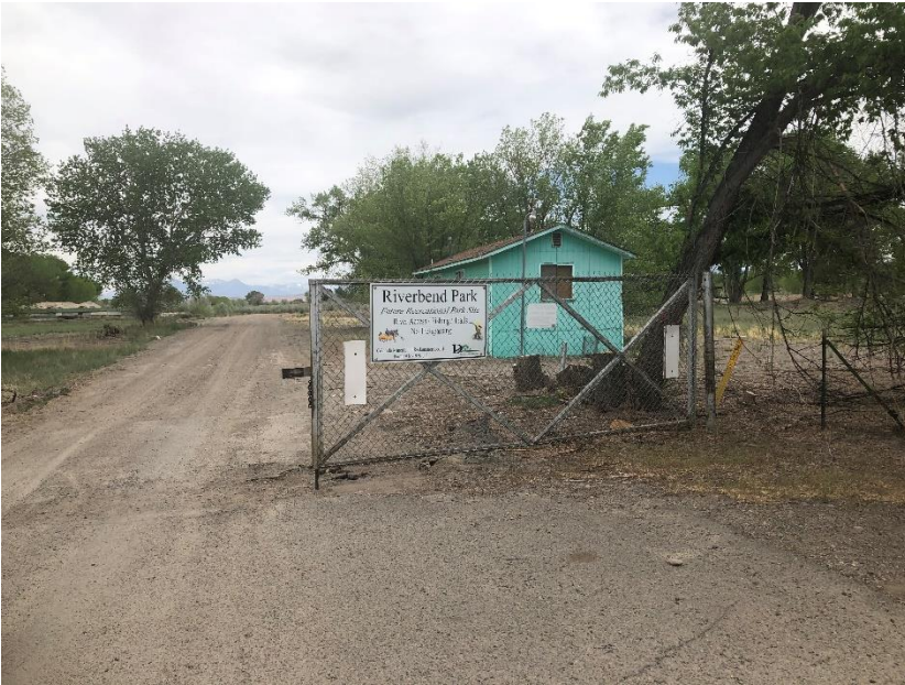
Entrance gate with sign and scale house