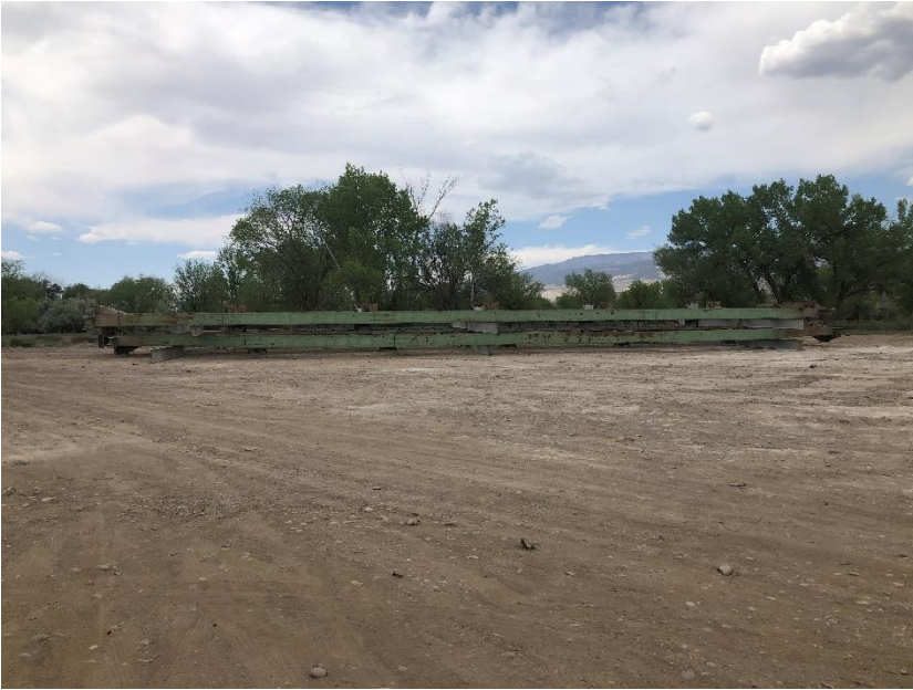
Beams stored on site