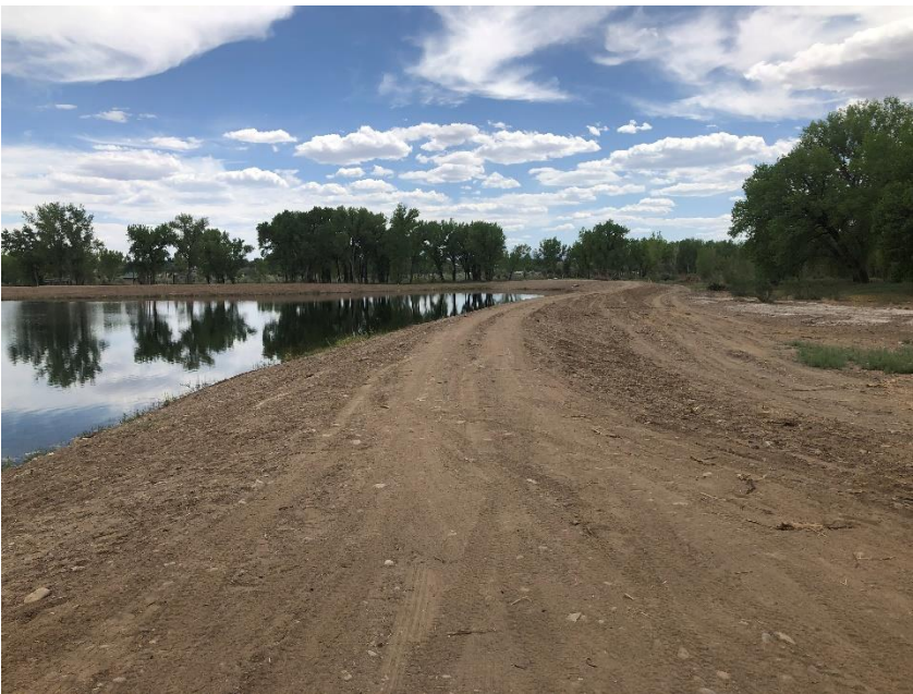
West side of pond