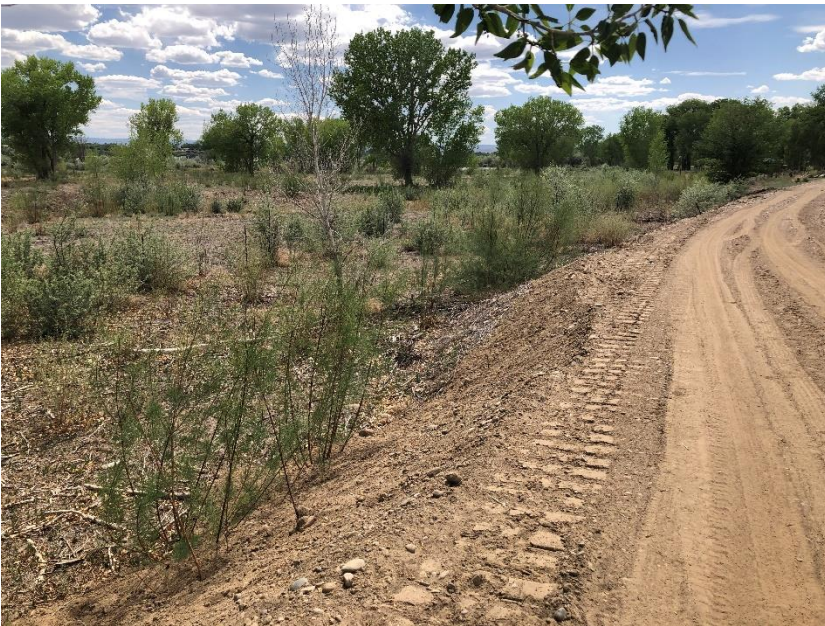
Tamarisk near southeast corner of pond