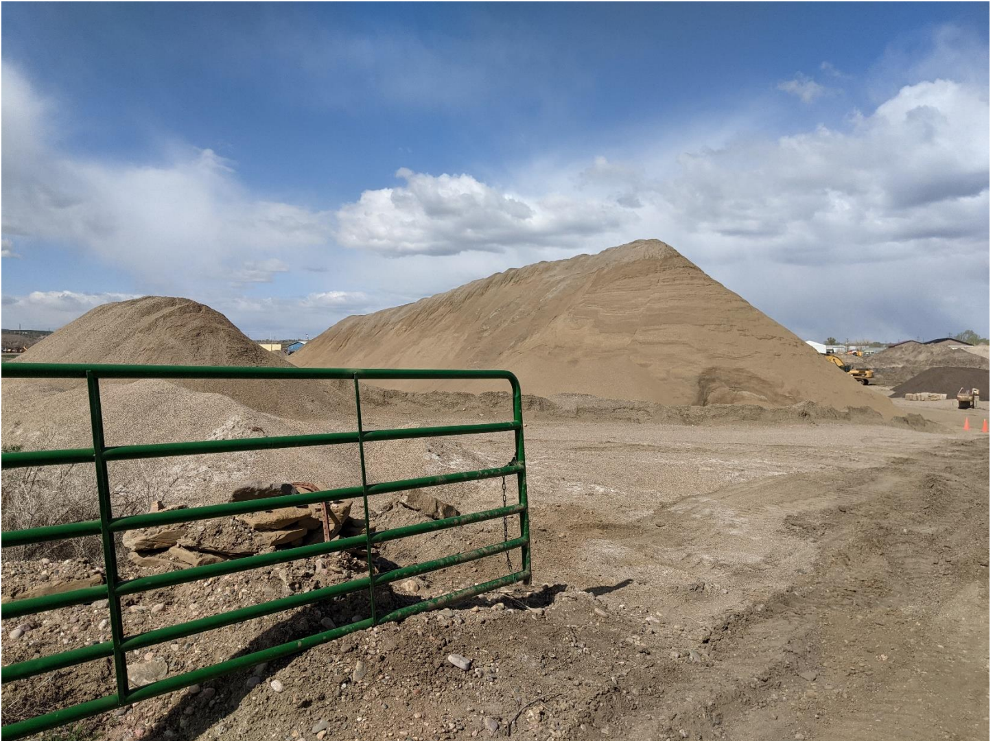
Stockpiles in west pit.

The permit is divided into two pits, the east and west pit. The two pits are divided by 1st Street. The site was operating at the time of the inspection in both the east and west pits. Active mining is occurring within the east pit. Loader operations were taking sand and gravel from the east of the pit to a processing area. The west pit had no active mining going on but multiple stockpiles are located within the pit.