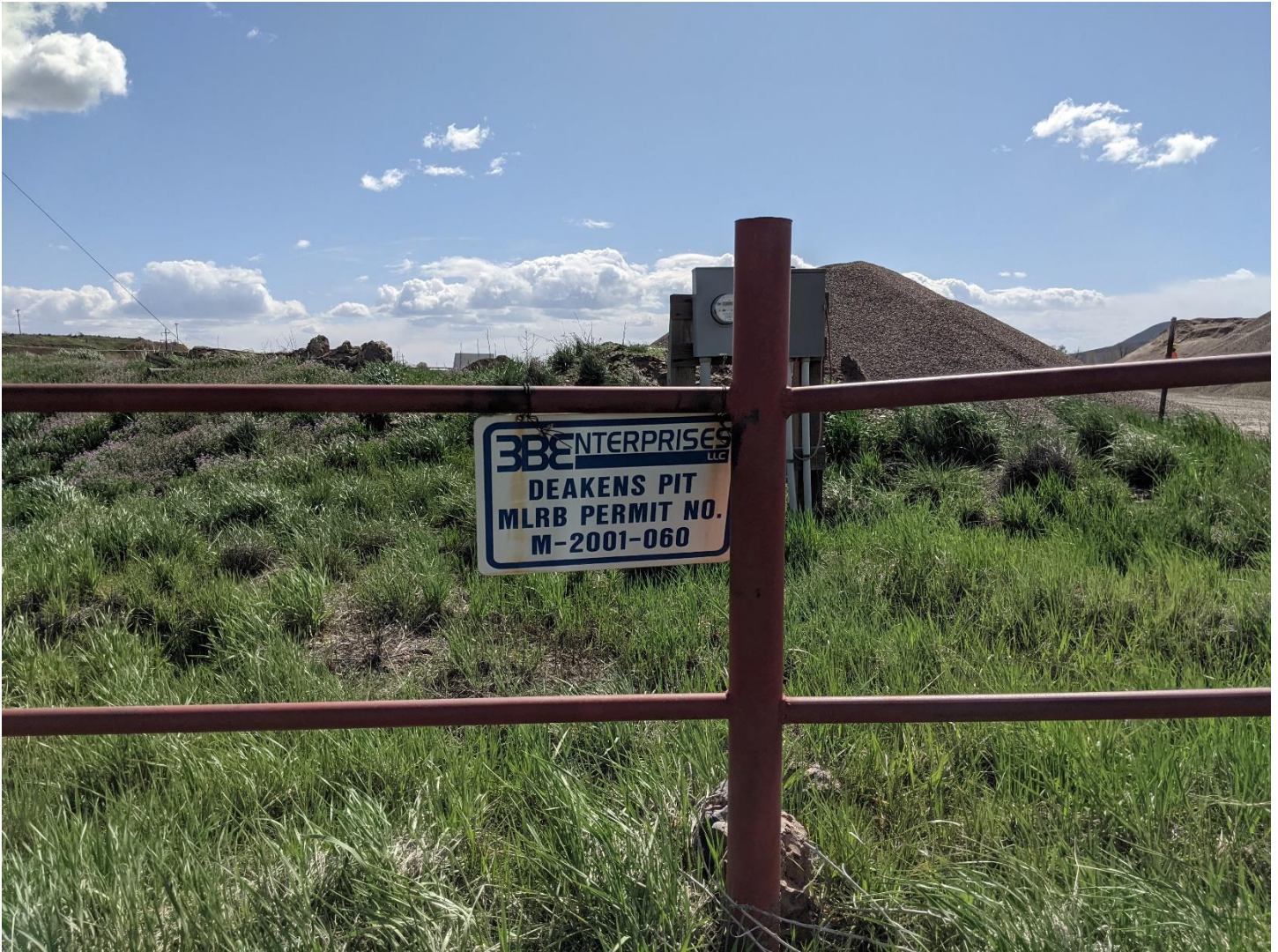
Mine identification sign.

The mine identification sign and affected area boundary markers are in place and in compliance with Rule 3.1.12. The sign is located at the entrance of the permit boundary on the east side including all information for compliance.