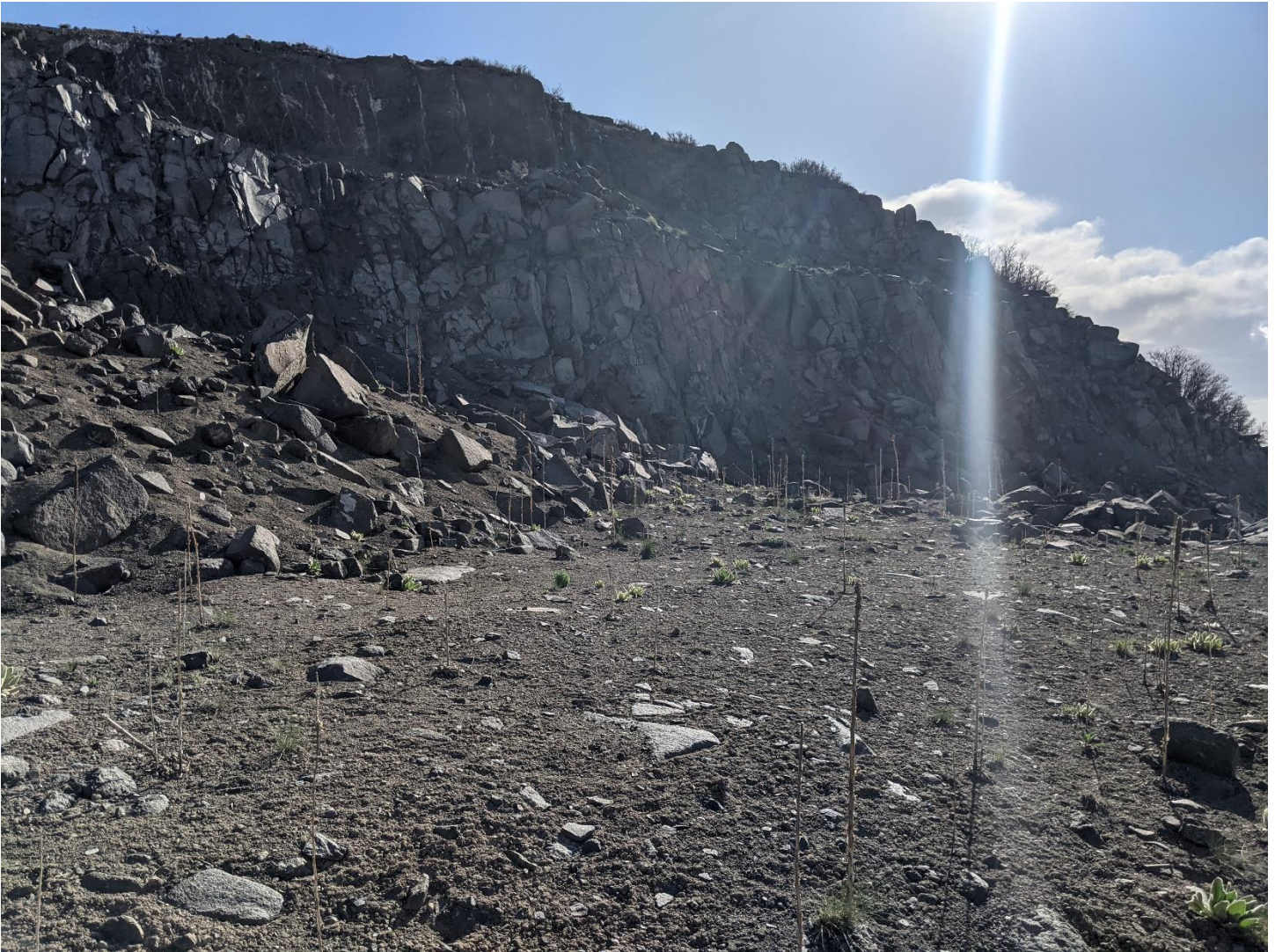
Hounds tongue along upper mining bench.

The site was inspected for erosion. No signs of rills, gullies or any erosional features were observed.