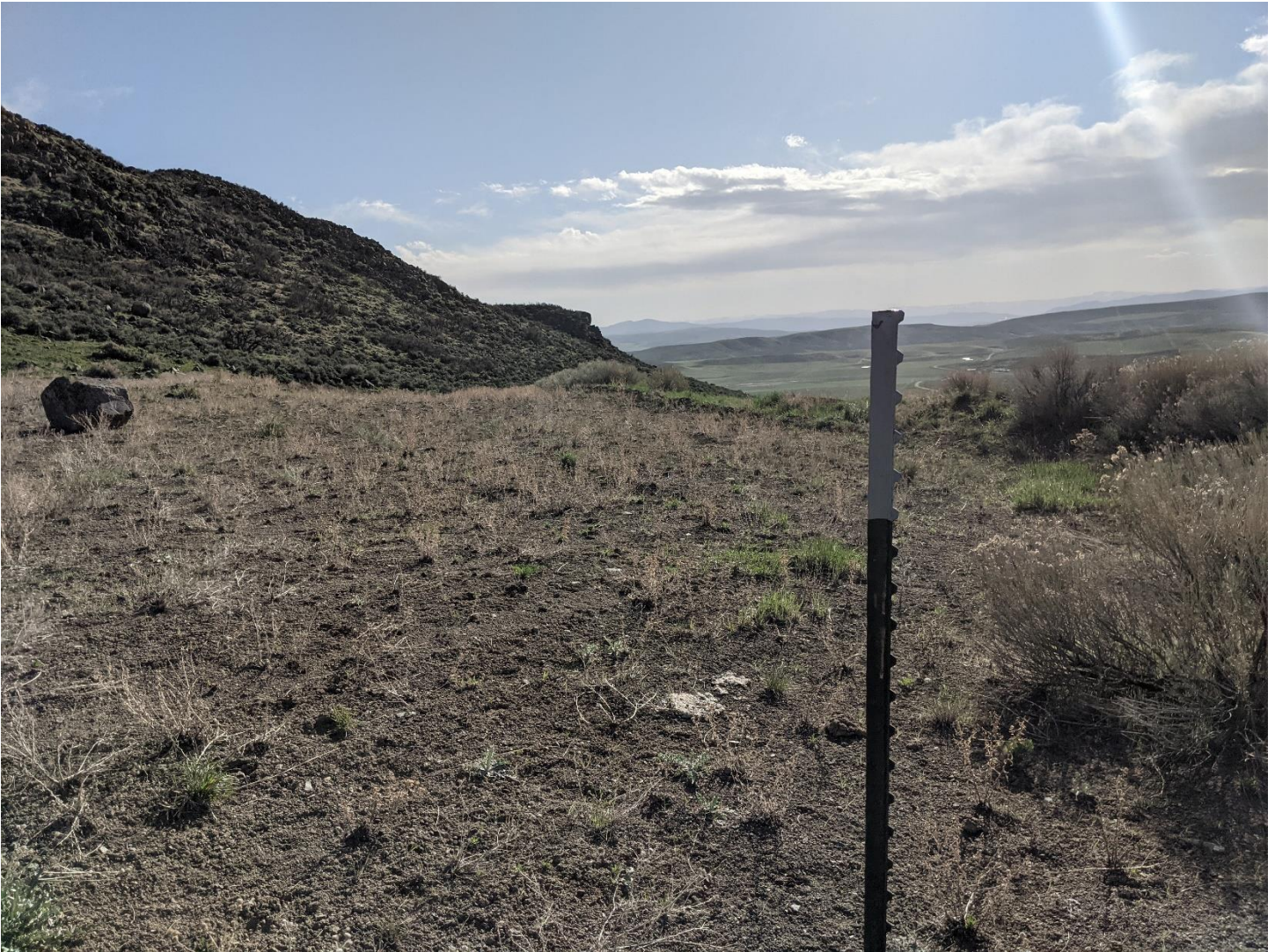
Affected boundary marker.

None Pioneer Sand Company, Inc. 630 Plaza Drive, Suite 150 Highlands Ranch, CO 80129