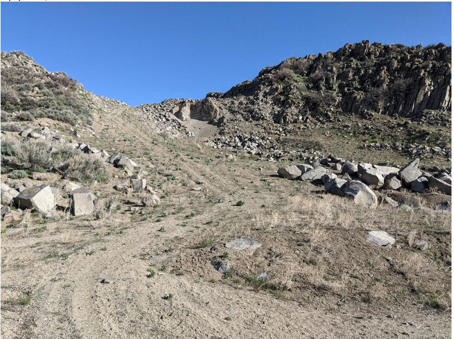
Excavated area and access road from below.

The site was inactive at the time of the inspection. According the 2021 annual reports the site was last active in 2015. This site is approved for intermittent status which requires that a site be active annually. If the mine ceases production for more than a year it shall go into temporary cessation or begin final reclamation. No equipment, fuel or structures were observed.