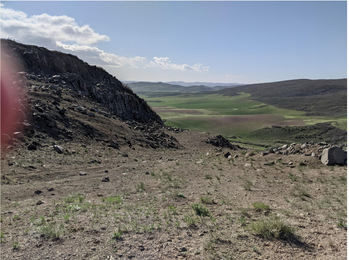
Excavated area from above.

A lynx was observed on site during the inspection.