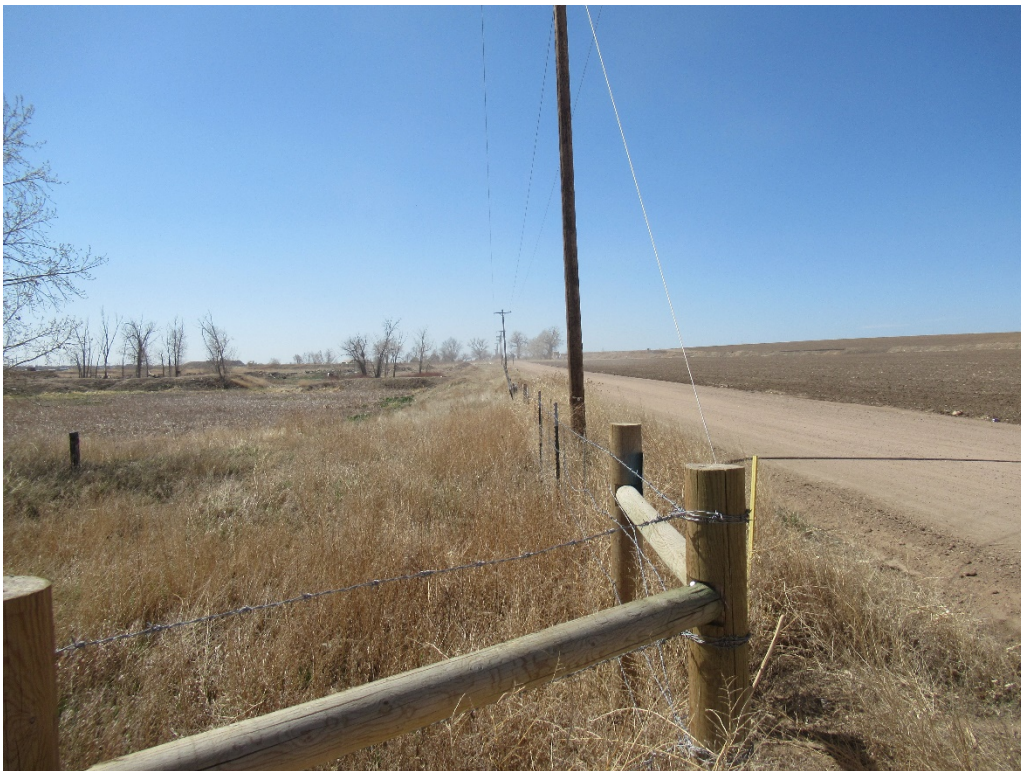
View of the site from the northwest corner of Phase 1 / Pond 2 Mining Area looking south. The area pictured has not been disturbed by the Operator and is the native ground.