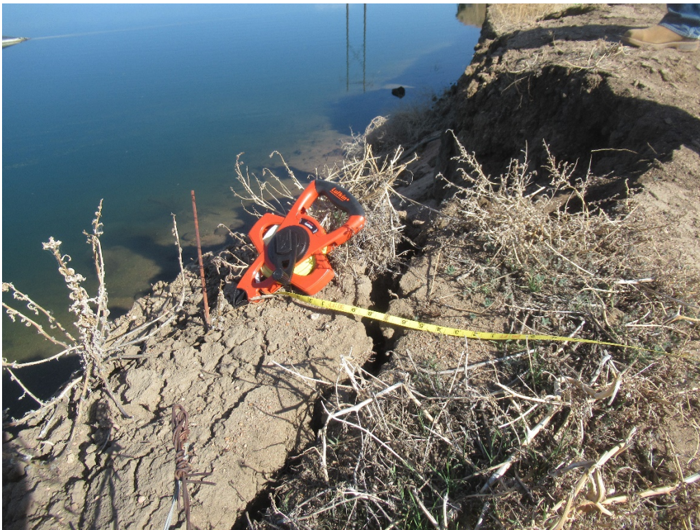
View of the 30 foot offset measurement along the east shoreline of Phase 2 / Pond 1 Mining Area