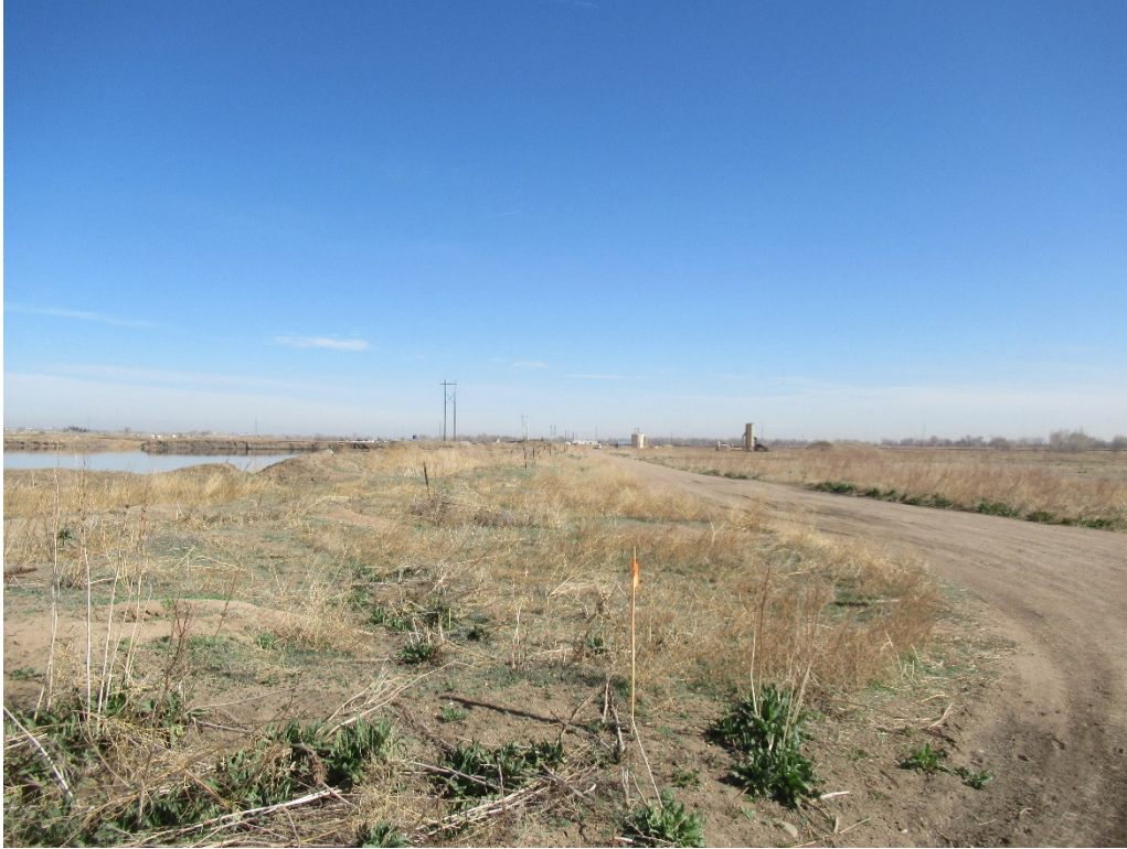
View of the site from the southeast corner of Phase 2 / Pond 1 Mining Area looking north