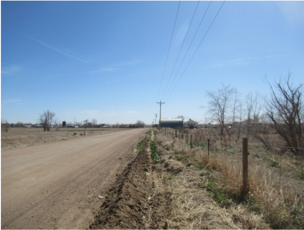
View of the site from the northwest corner of Phase 1 / Pond 2 Mining Area looking east