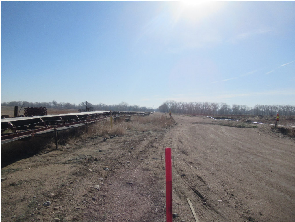
View of the permit boundary between the Wattenberg Lakes and Baurer Pit from the northeast corner of the Baurer Pit looking east. The conveyor is located on the Wattenberg permit area in the location of one of the two roads reference in the complaint.