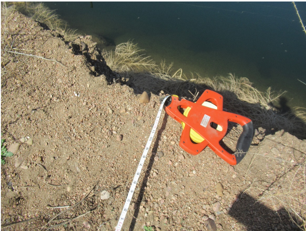
View of the 36 foot offset measurement along the east shoreline of Phase 2 / Pond 1 Mining Area