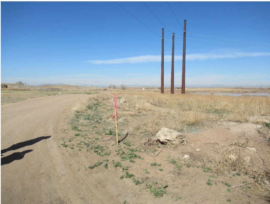
View of the site from the southeast corner of Phase 2 / Pond 1 Mining Area looking west