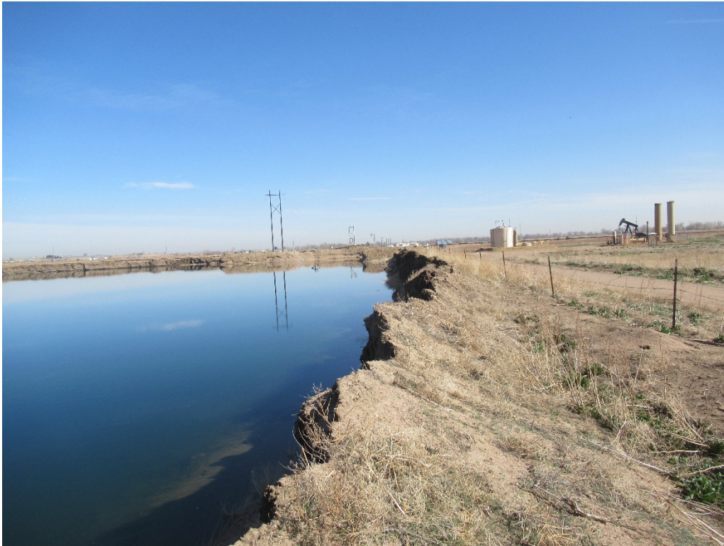
View of the east shoreline in the Phase 2 / Pond 1 Mining Area looking north