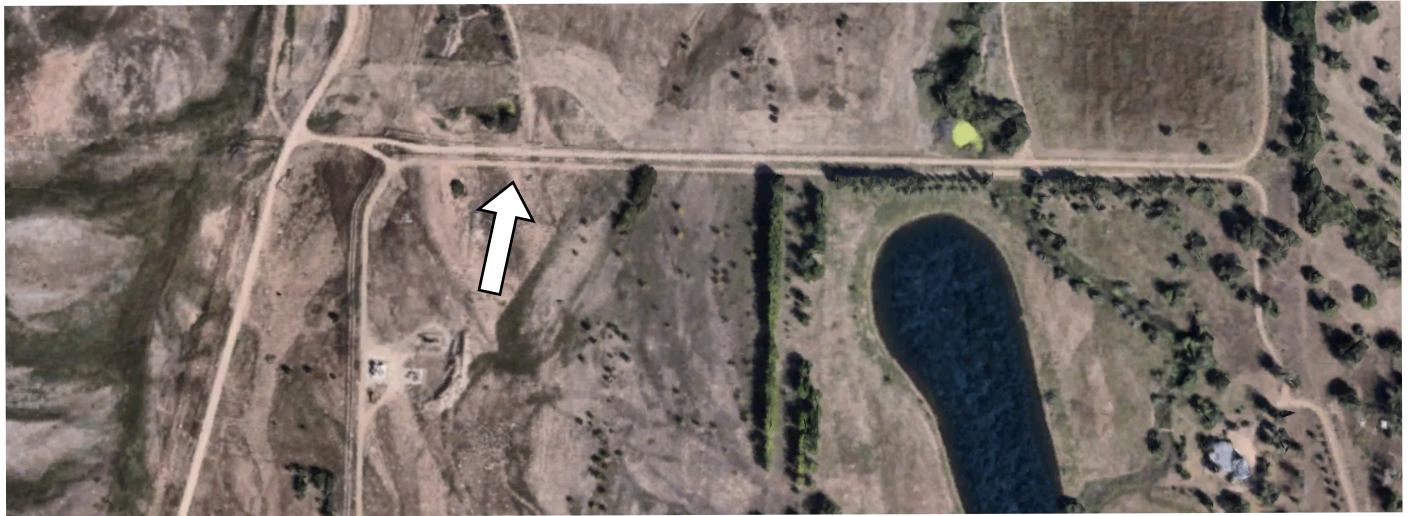
More current aerial 2 nd road is gone