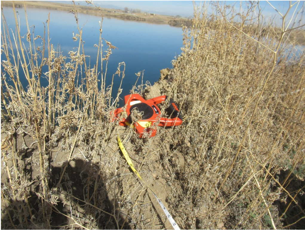
View of the 25 foot offset measurement along the east shoreline of Phase 2 / Pond 1 Mining Area