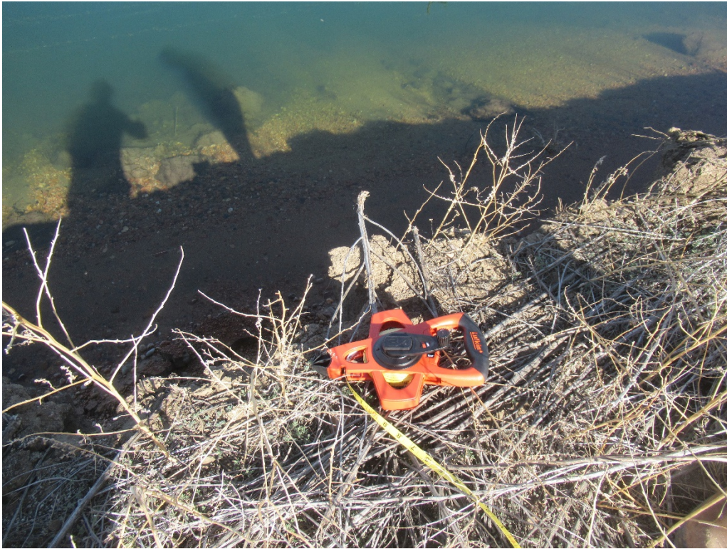
View of the 55 foot offset measurement along the east shoreline of Phase 2 / Pond 1 Mining Area