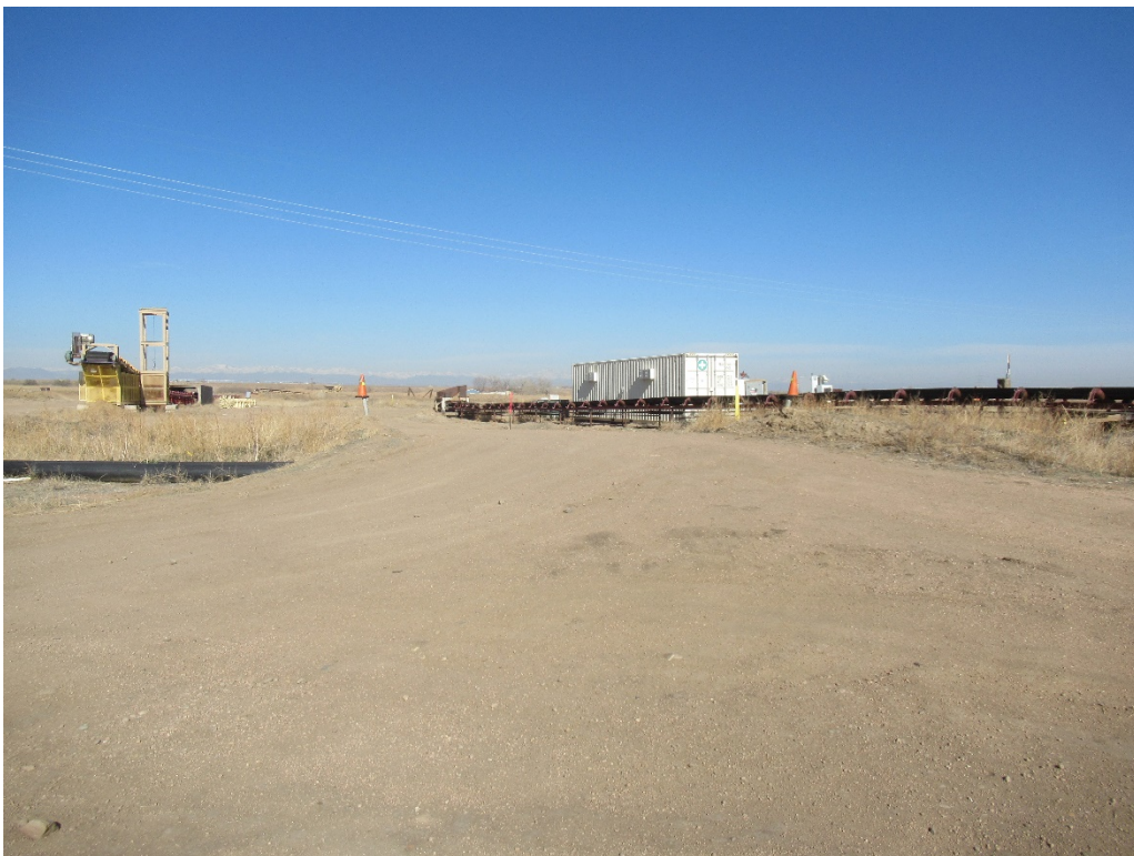
View of the disturbed area in the northwest corner of the Baurer Pit