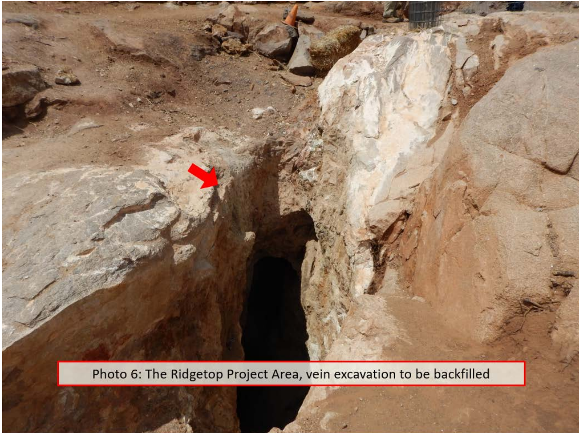
Photo 6: The Ridgetop Project Area, vein excavation to be backfilled