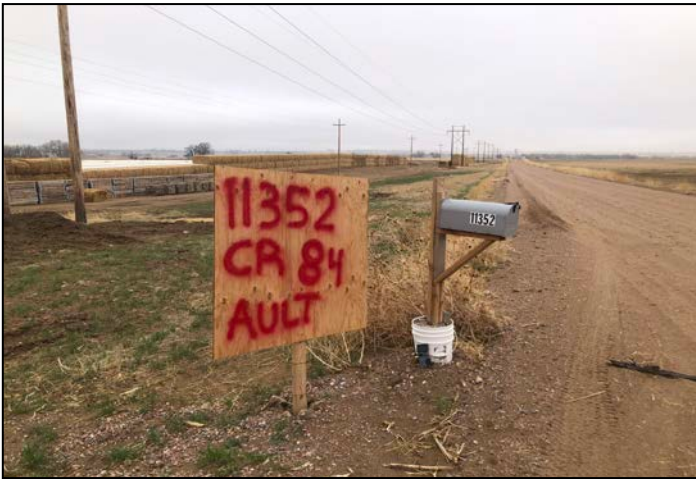
Photo 1 – looking west along WCR 84 at entrance to DeHaan Calf site.

David DeHaan 9571 CR 20 Ft Lupton, CO 80621