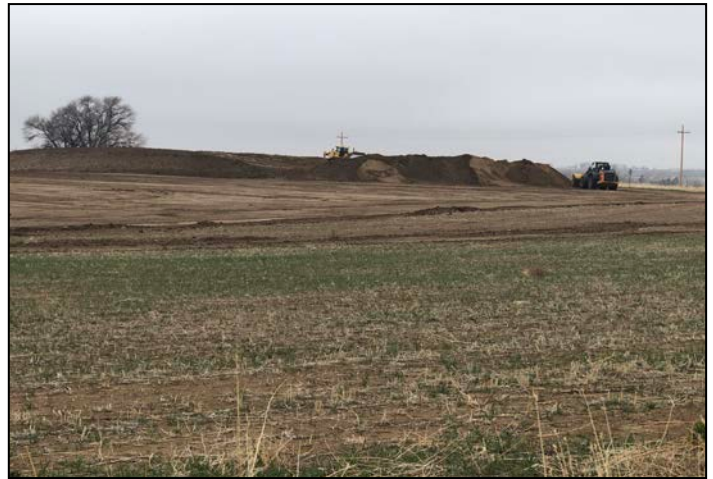
Photo 2 – looking southwest at excess topsoil stockpile located at SE corner of WRC 23 and WCR 84.