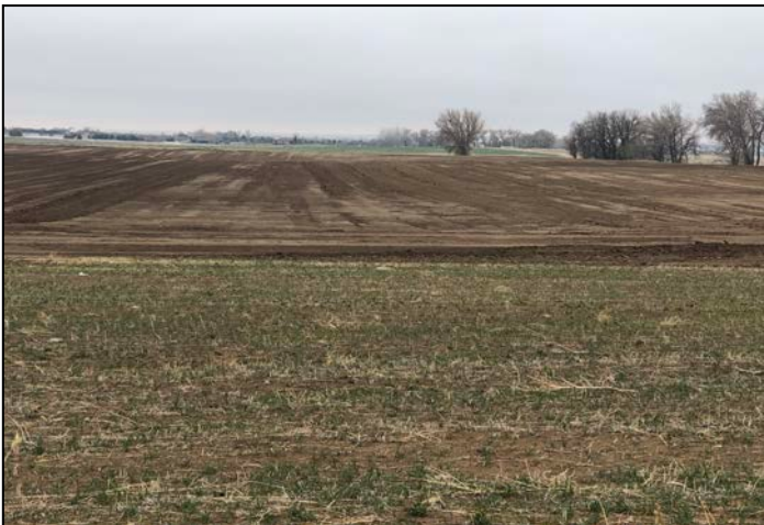
Photo 3 – looking south across the graded composting area located at the SE corner of WRC 23 and WCR 84.