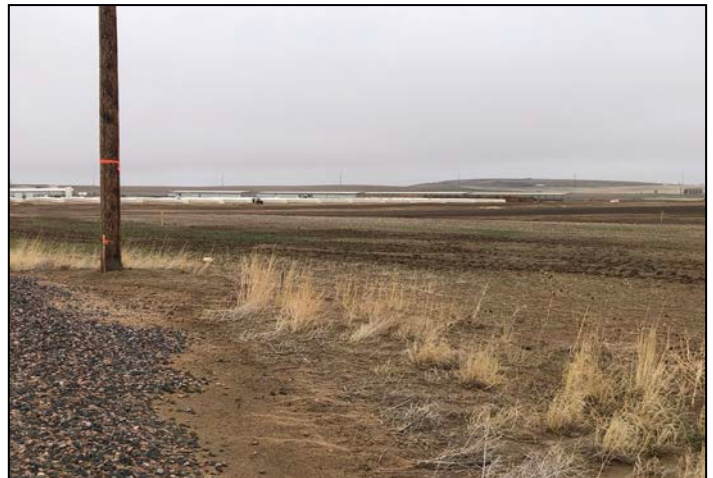
Photo 4 – looking southeast from the SE corner of WRC 23 and WCR 84 across the graded composting area and toward the DeHaan Calf site.