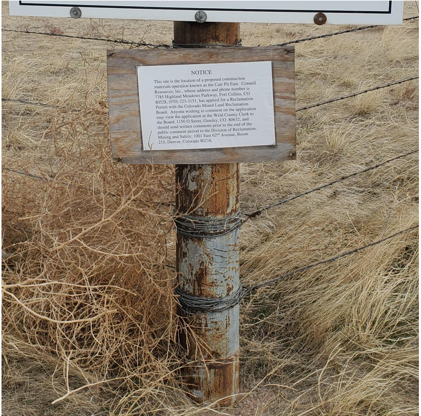
Figure 1. Carr Pit East notice sign posted underneath the sign of the adjacent Connell Carr Pit. Looking northeast from Weld County Road 126.