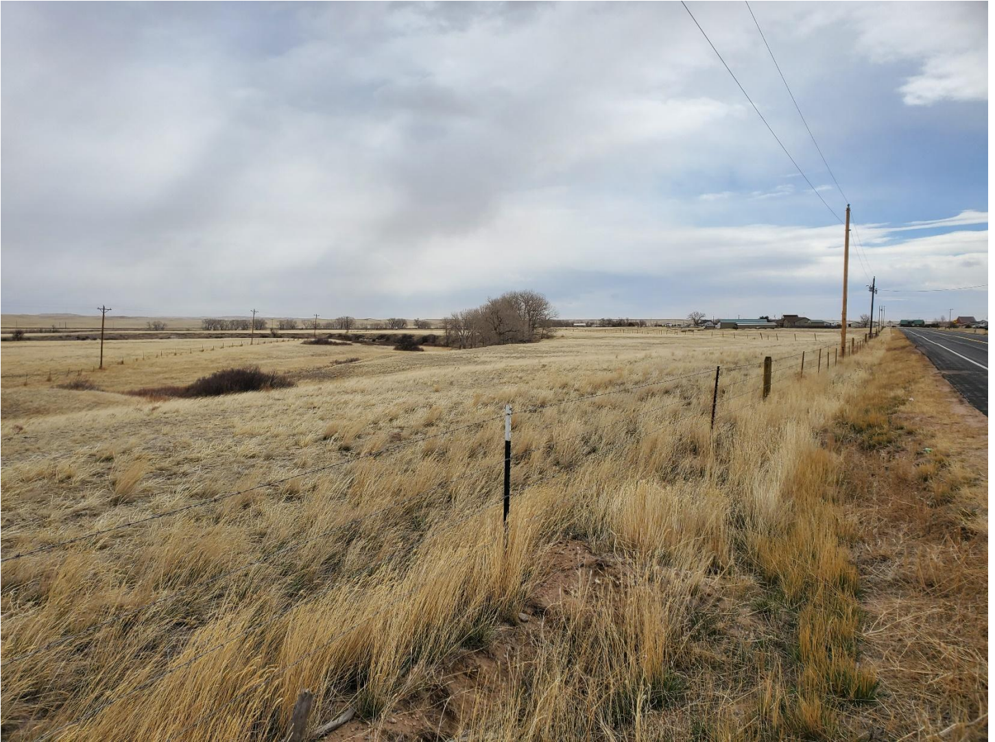
Figure 4. Photo take from same position as Figures 2 and 3 but looking east and showing more of the proposed permit area southern boundary.