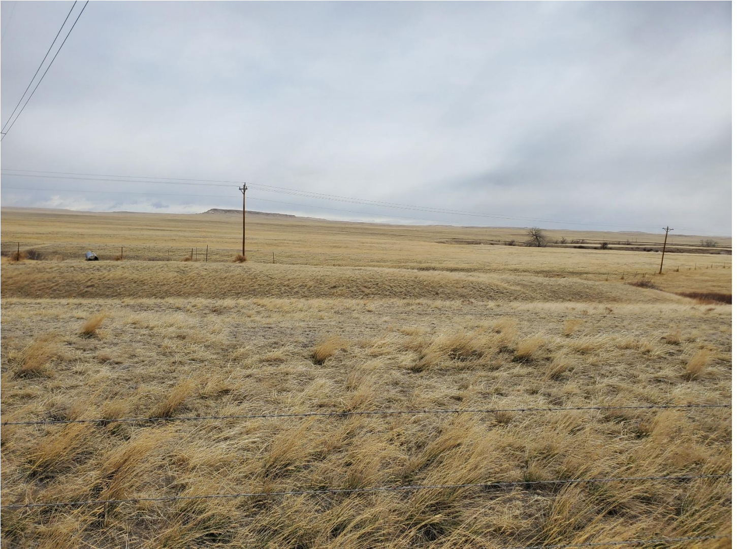
Figure 3. Photo taken from same position as Figure 2 but looking northeast at the proposed permit area.