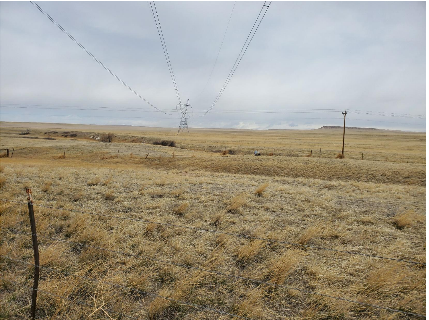
Figure 2. Looking north from Weld County Road 126. The proposed permit boundary southwestern corner is a few hundred feet to the northwest from the position this photo was taken from.