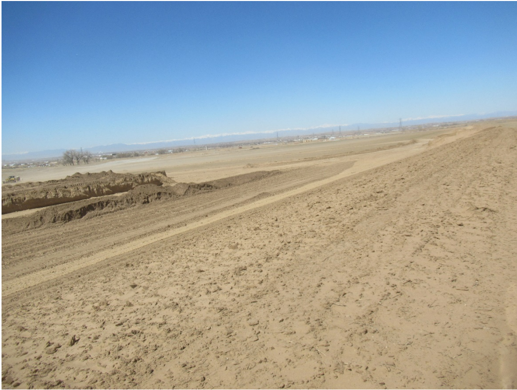
View of Mining Area "B" from the northeast side looking southwest