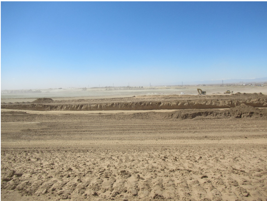
View of the excavation activity in the southeast corner of Mining Area "B" from the north side looking southwest