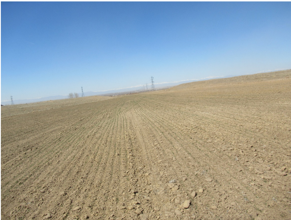
View of Mining Area "A" from the east side looking west