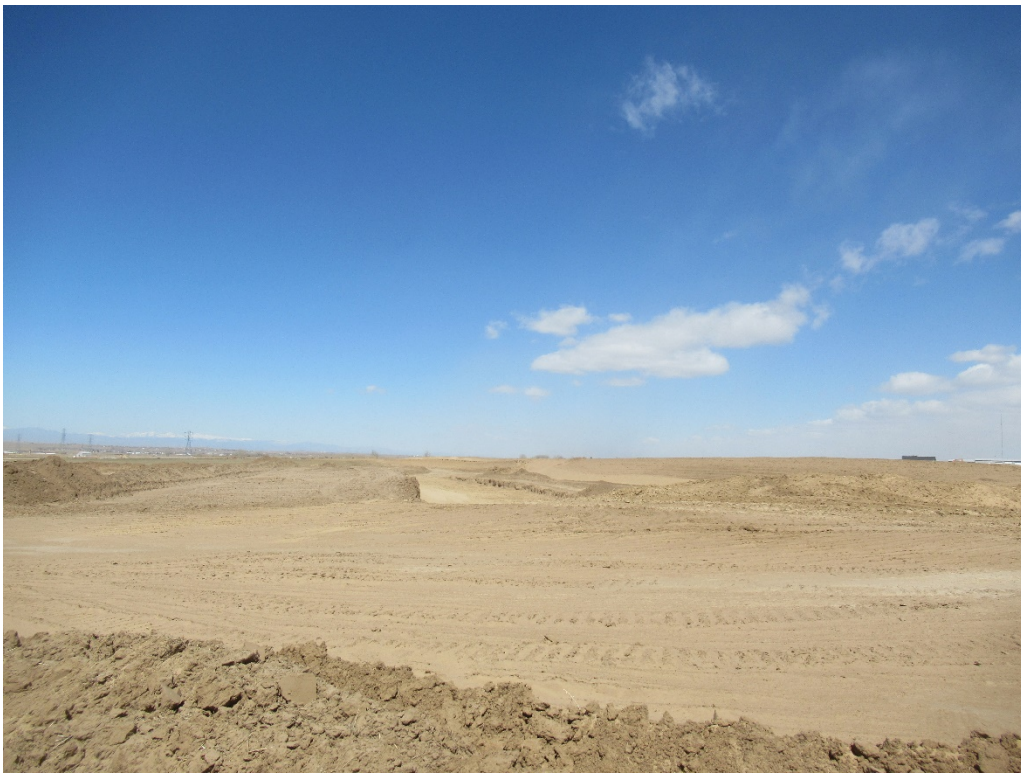
View of the excavation activity in the southeast corner of Mining Area "B" from the south side looking north