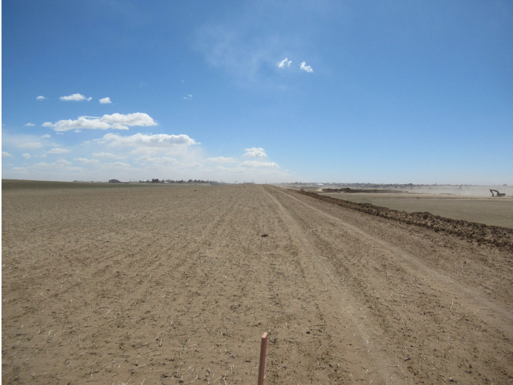
View of Mining Area "B" from the west side looking southeast