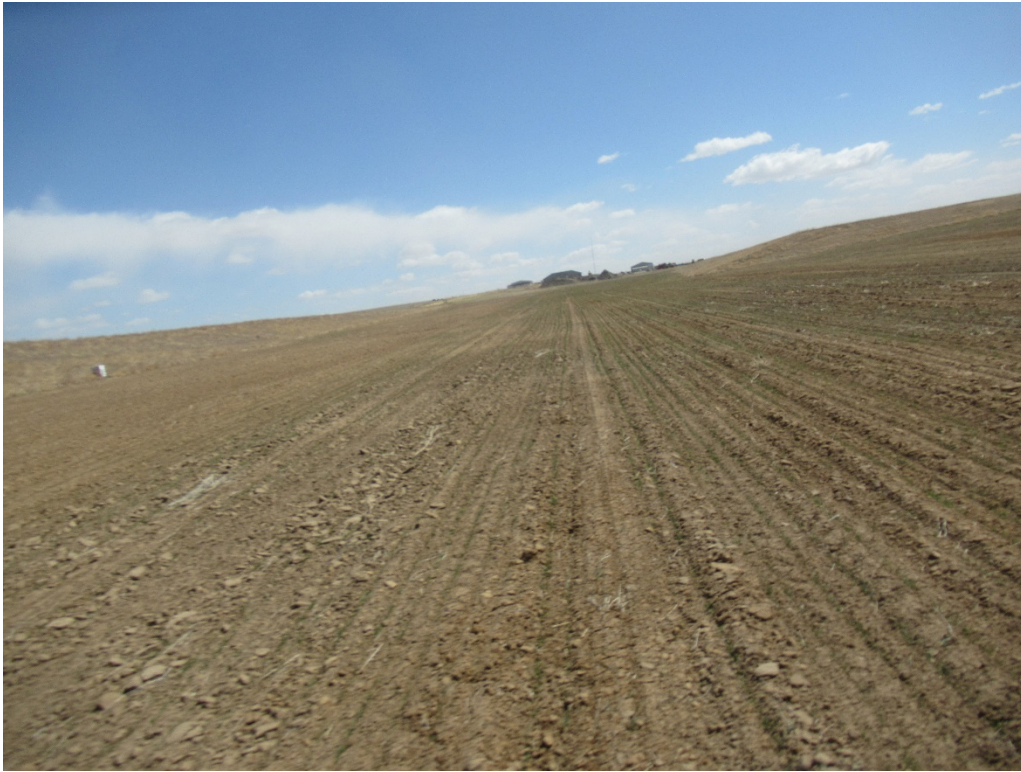
View of Mining Area "A" from the west side looking east