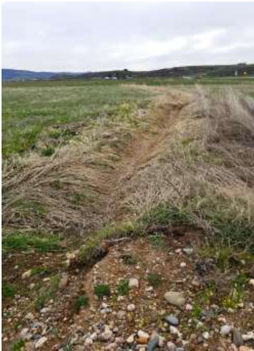
Irrigation ditch in permit area north of Hwy 40