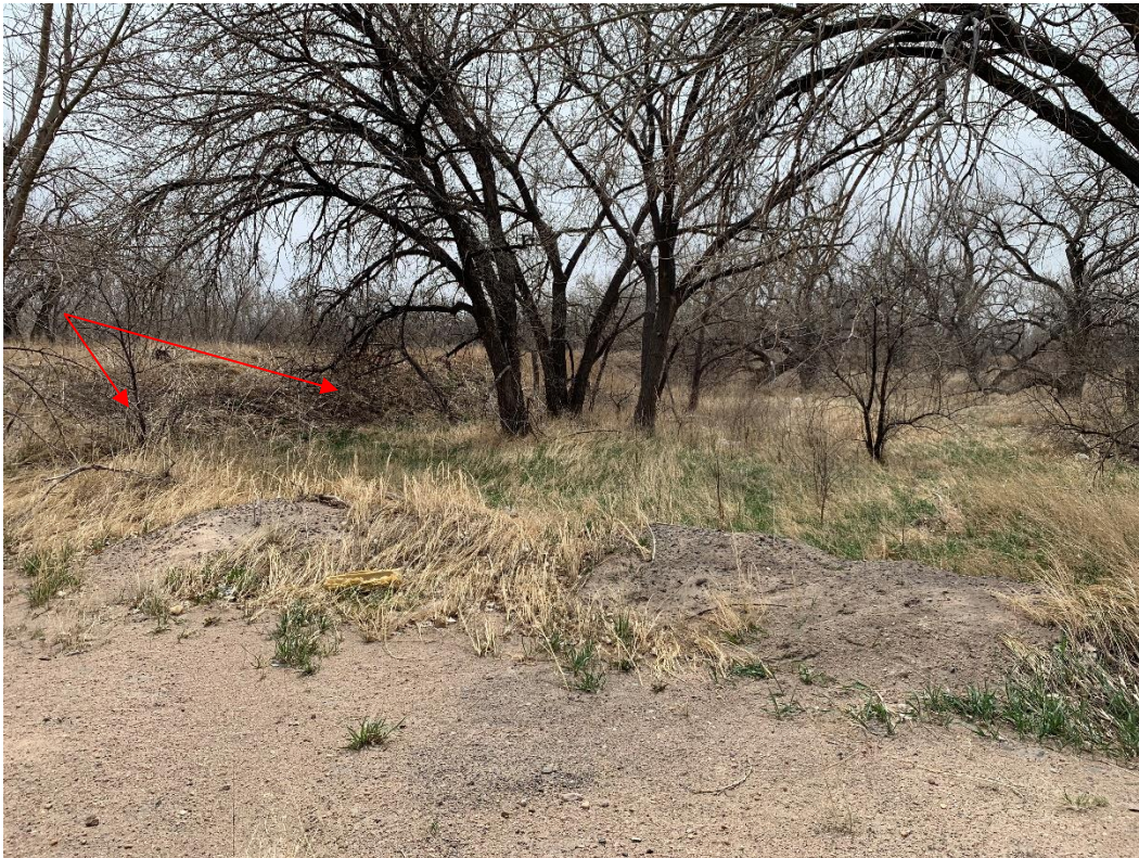
Photo 1 – Amendment area facing southeast. Lowline Ditch Berm in background