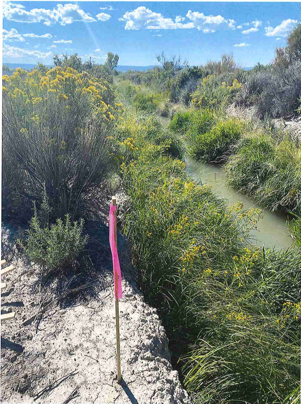
West end marker.