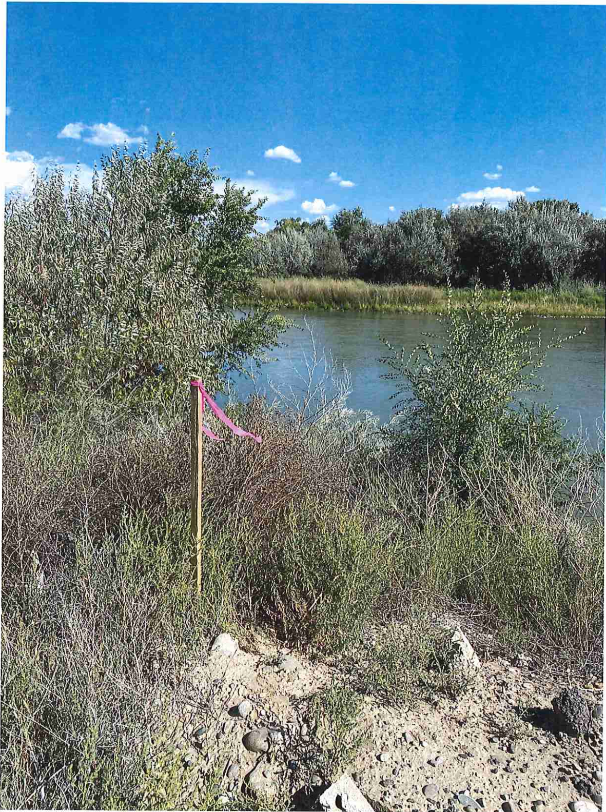
Marker along the Gunnison River.