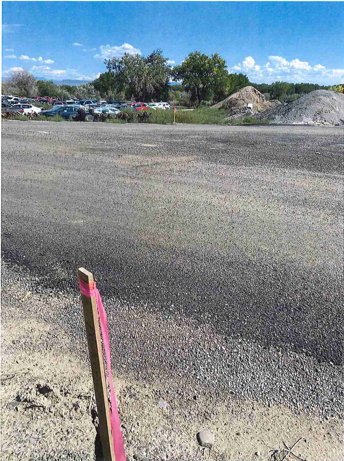
Salvage yard view. Several markers to fenceline.