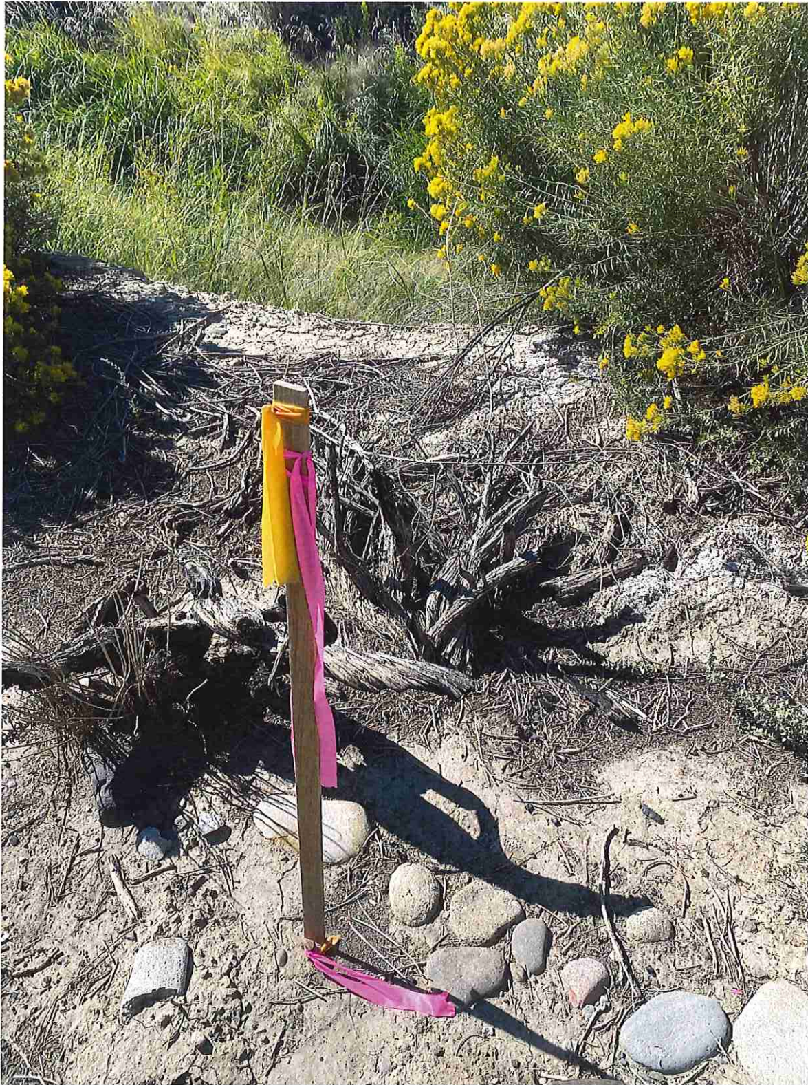
Middle marker by Heartland Canal.