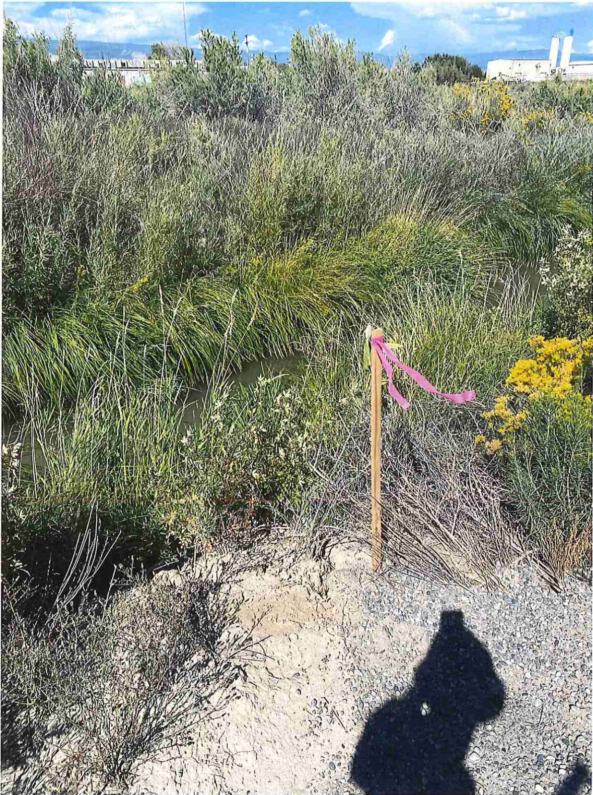
Heartland canal looking Southeast.