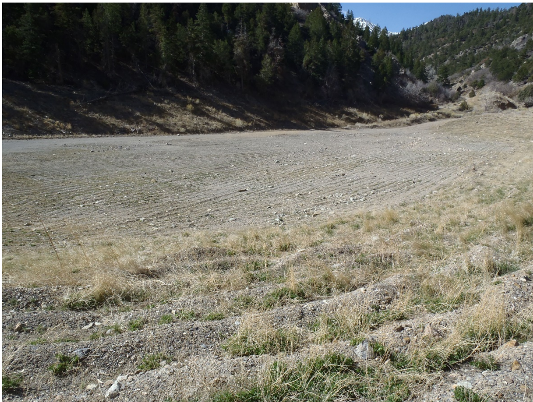
Photo 5. Ripped and seeded east pit floor to be used for cattle loading (looking south).