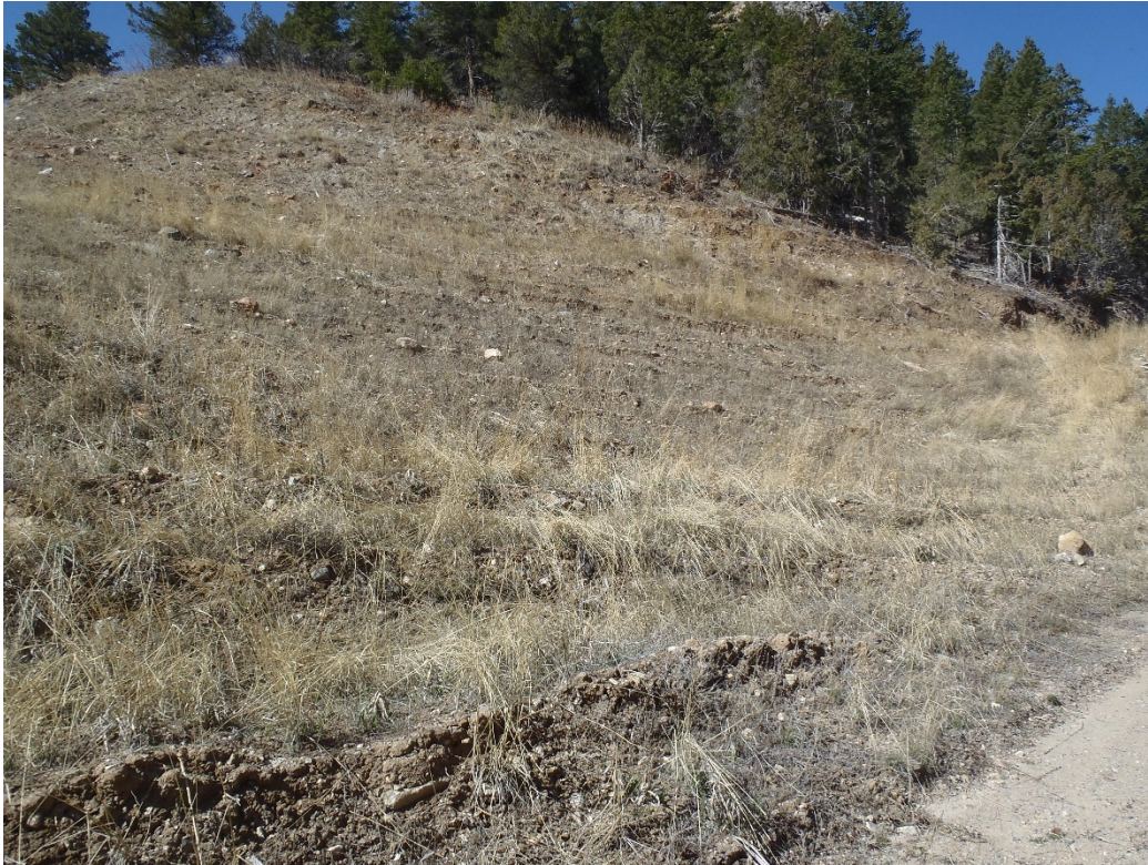
Photo 4. Reclaimed west side of mined area added through AM-1 (looking SW).