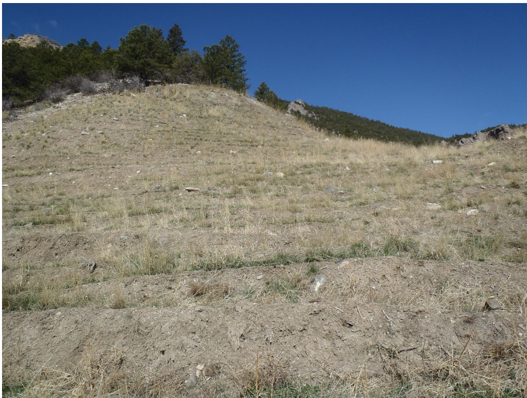
Photo 3. Reclaimed east side of mined area added through AM-1 (looking NW).