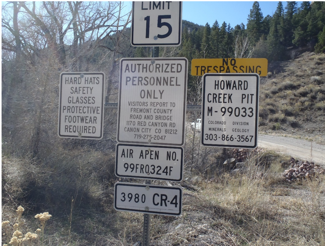
Photo 6. Permit sign.