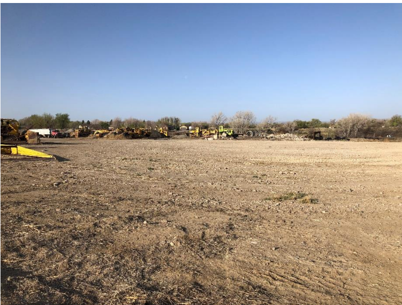
Center of site, looking southwest from northeast corner