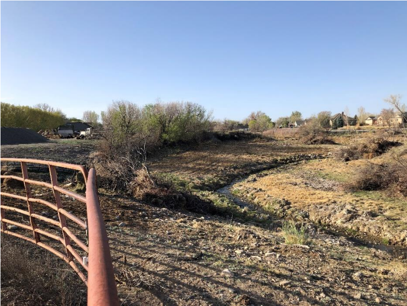
West side of site and adjacent creek