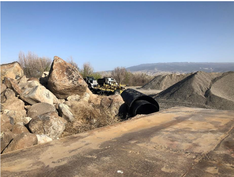
Stockpile of materials to be sold