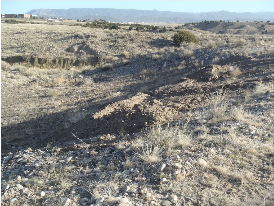
Photo 4. Ungraded topsoil placed on graded slope (SW corner, looking NE).