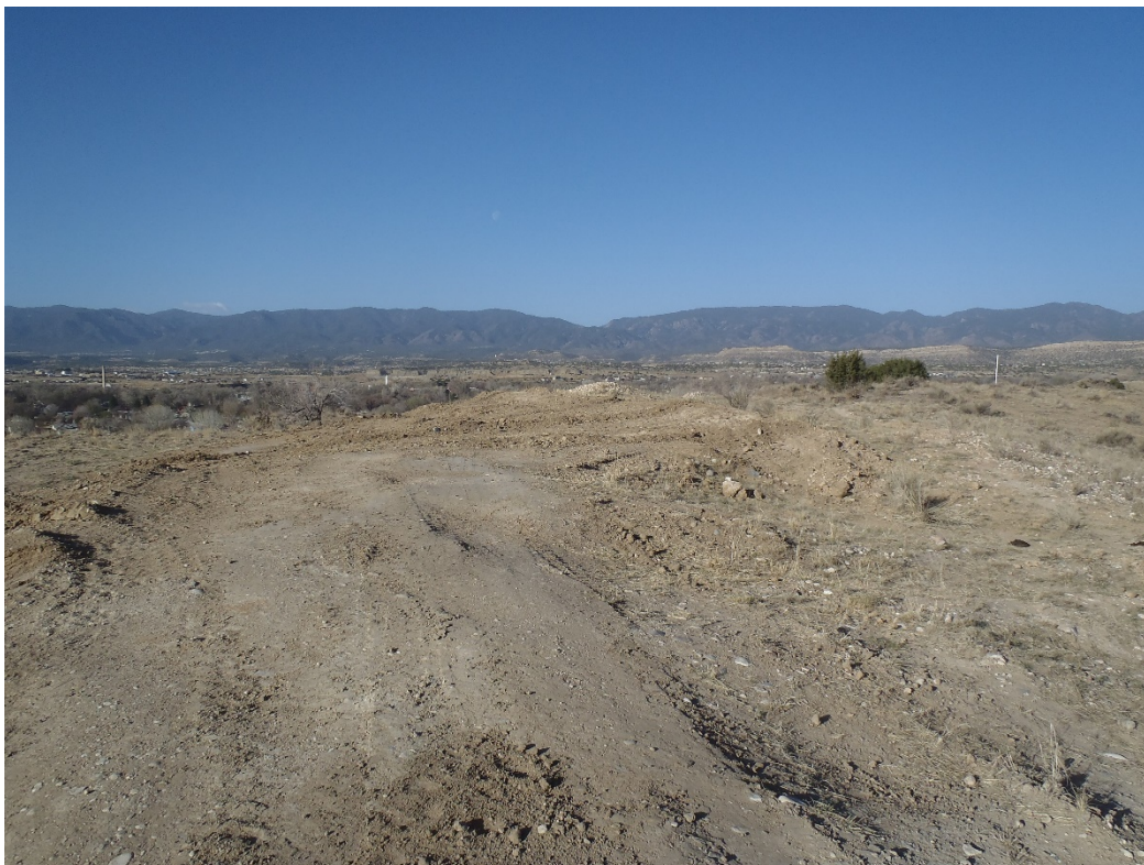
Photo 3. Topsoil stockpile removal area on ridge in SW corner (looking SW).