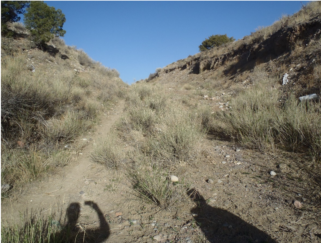
Photo 2. Revegetated road cut (cattle trail on left, looking west).