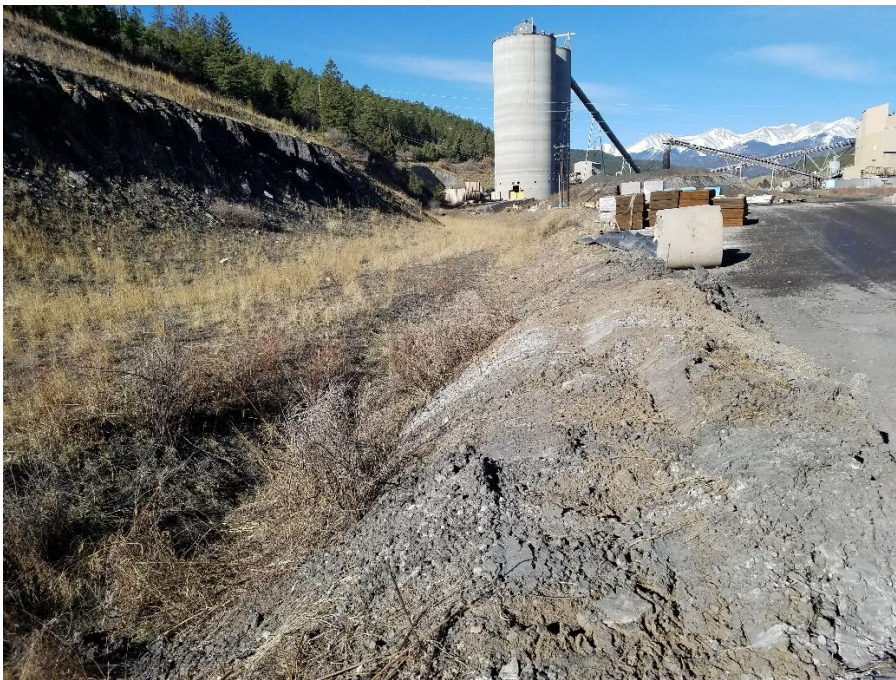
Figure 2. SAE south of Pond 007A looking west.

The Small Area Exemption (SAE) south of Pond 007A has maintained a stable berm to direct water towards Pond 007A.