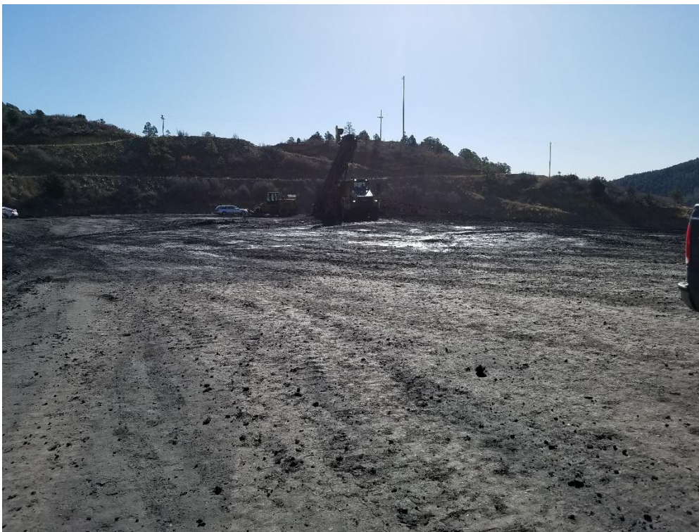
Figure 7. RDA looking east.

Number of Partial Inspection this Fiscal Year: 7