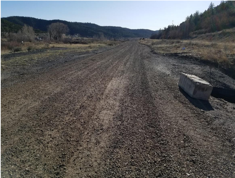
Figure 8. TR76 road.

The road that runs east from New Elk Mine along the southern side of the Middle Fork of the Purgatoire River was observed and appears to remain not in use to comply until TR76 is approved.