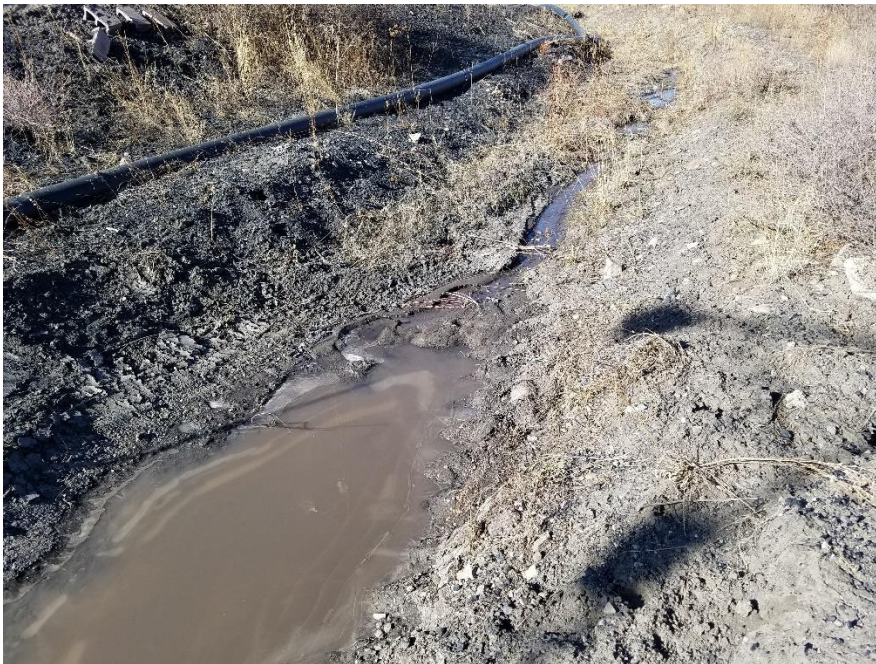
Figure 4. Ditch D15 west of culvert C13 looking west.

Number of Partial Inspection this Fiscal Year: 7