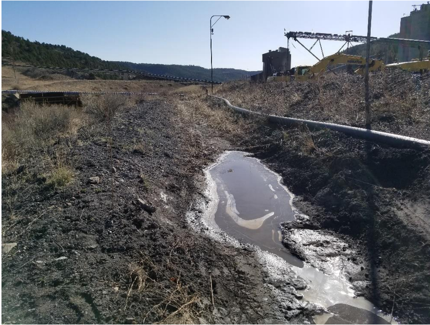
Figure 3. Ditch D15 west of culvert C13 looking east.

The maintenance item from the March 15, 2022 previous inspection regarding ditch D15 just west of culvert C13 where sediment build up and some of the embankment of the ditch appears to be slightly eroding on the north side remains to be addressed. Mr. Massarotti indicated it will be addressed before the next inspection. NECC should repair this area to ensure mine water does not over-top the ditch and discharge into the river without treatment.