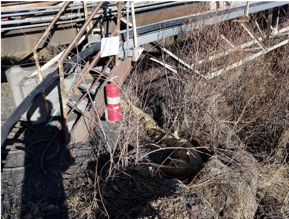
Figure 1. Area under and adjacent to where the conveyor exists the plant. Straw waddles for sediment control were observed.

The Small Area Exemption (SAE) south of Pond 007A has maintained a stable berm to direct water towards Pond 007A.