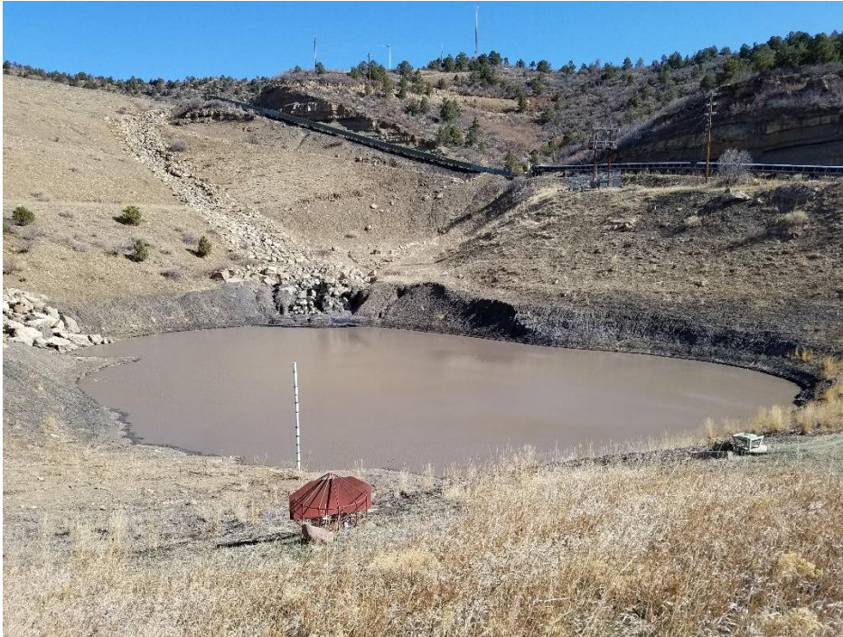
Figure 5. Pond 08.

Outfall 010 was not discharging and appeared clear and functional.