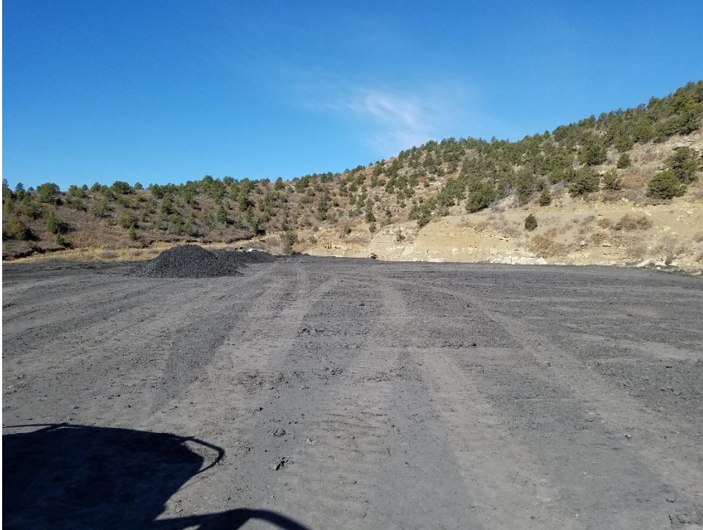
Figure 6. RDA looking west.