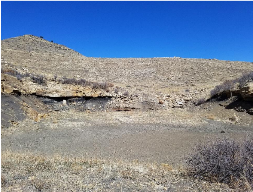
Figure 6. Pond 009a looking north.

Pond 009a was holding a small amount of water but did not appear to be discharging. The embankment appeared stable.