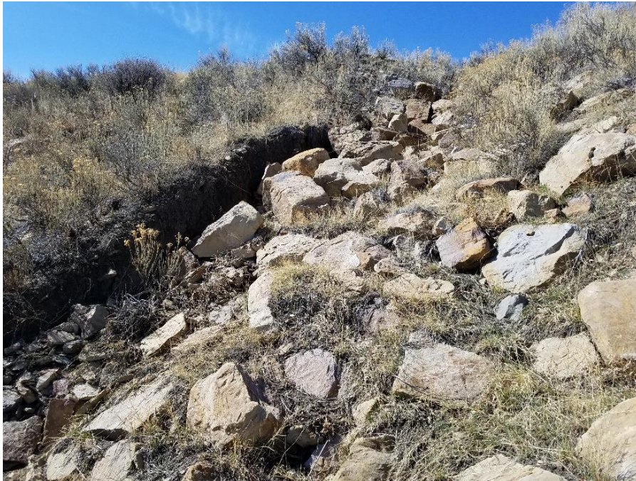
Figure 4. Drainage ditch D14, side cutting erosion observed. Photo of where D14 discharges to D96.

Culvert 2 appeared clear and functional. Pond 009 was holding water but not discharging. The embankment appeared stable.