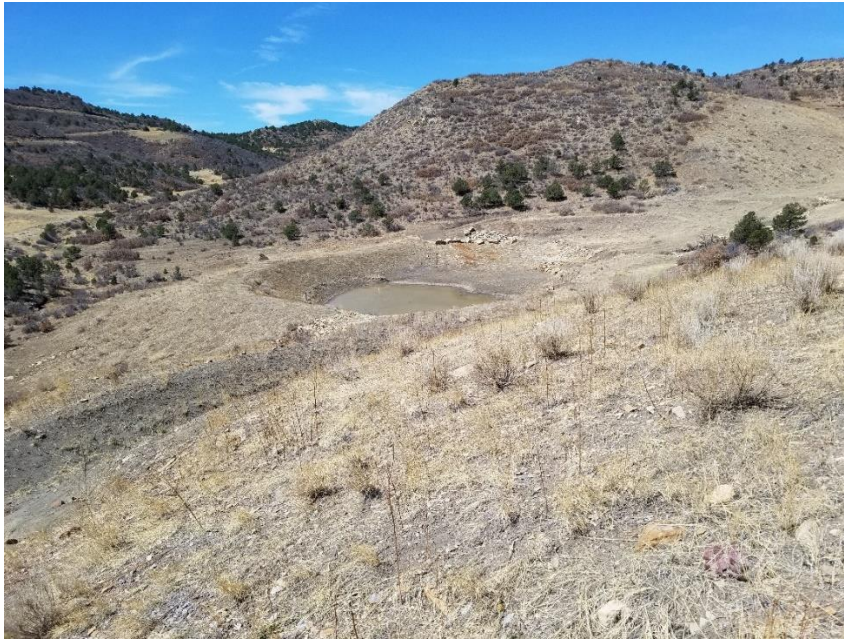
Figure 8. Pond 006a.

Ponds 006a and 007a were holding water but not discharging. The embankments appeared stable.