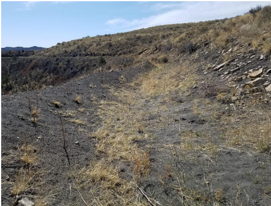
Figure 7. Ditch D4 looking west.

Ditch D4 was inspected and found to be stable.