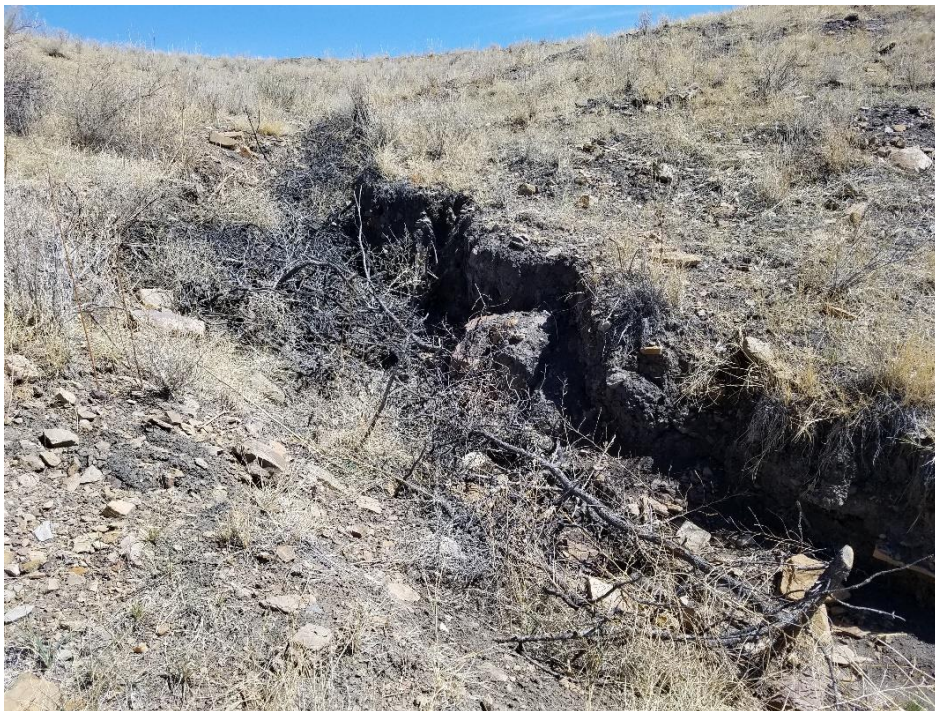
Figure 9. Ditch D7 looking north.

Erosion was observed outside of branches placed in Ditch D7 north east of Pond 006a. Please monitor and address appropriately as needed.