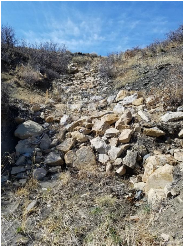
Figure 3. Drainage ditch D14 where it discharges into D96.

Erosion was observed on Ditch D14 where it discharges into Ditch D96. NECC will need to stabilize this area that has steep and eroding sides.