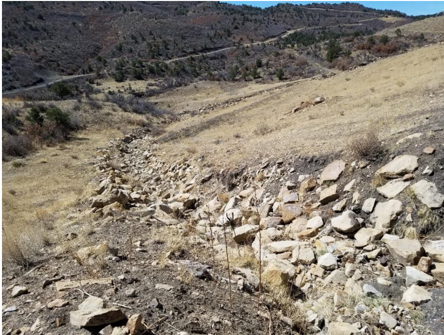
Figure 1. Fill 7 western drainage looking southwest.

Fill 009 was overall stable and vegetated but several erosion features were observed that should be monitored and addressed. These include an animal hole on the face of Fill 009 northeast of where Ditch D75 enters the fill area on the inter-bench embankment. Vegetation was sparse in this area, and NECC should either stabilize the area or monitor it to ensure future rills and gullies will not form at this location.