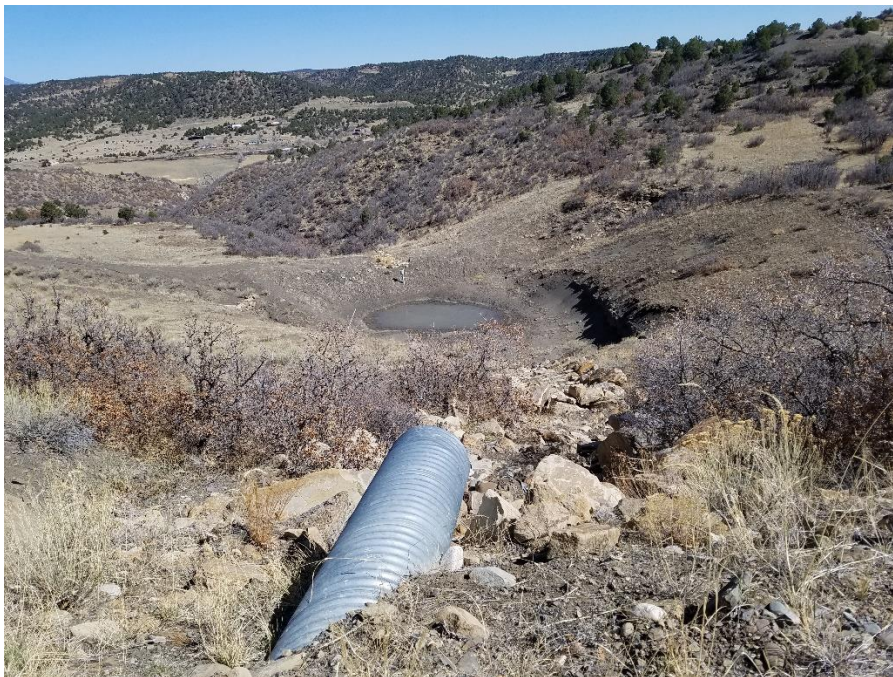
Figure 5. Culvert 2 and Pond 009 looking northeast.

Culvert 2 appeared clear and functional. Pond 009 was holding water but not discharging. The embankment appeared stable.