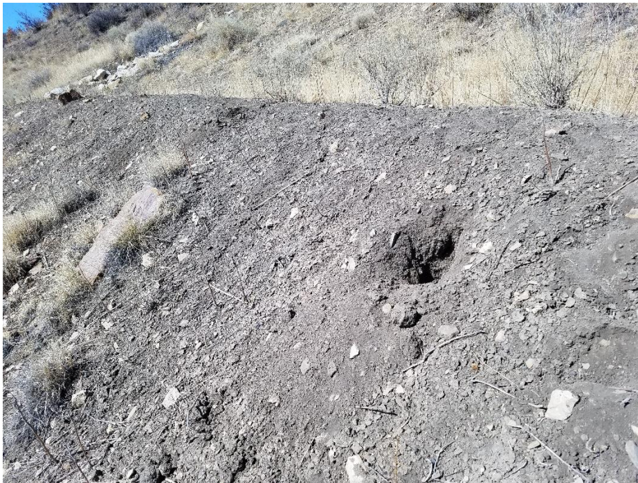
Figure 2. Animal hole in embankment of bench on Fill 009 near where Ditch D75 enters the fill.

Fill 009 was overall stable and vegetated but several erosion features were observed that should be monitored and addressed. These include an animal hole on the face of Fill 009 northeast of where Ditch D75 enters the fill area on the inter-bench embankment. Vegetation was sparse in this area, and NECC should either stabilize the area or monitor it to ensure future rills and gullies will not form at this location.