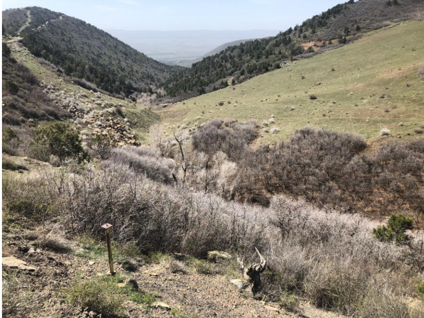
West Mine, lower portion with ponds