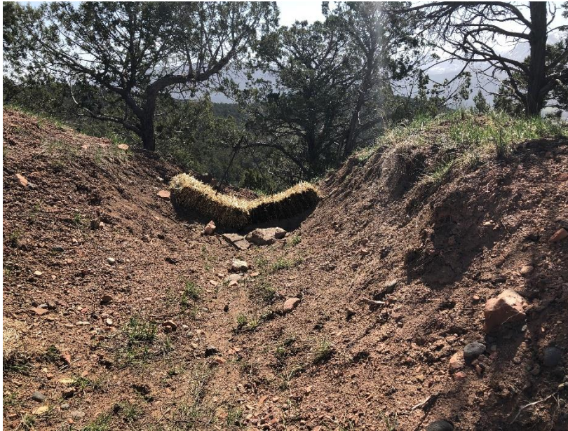
Straw bales near RDA