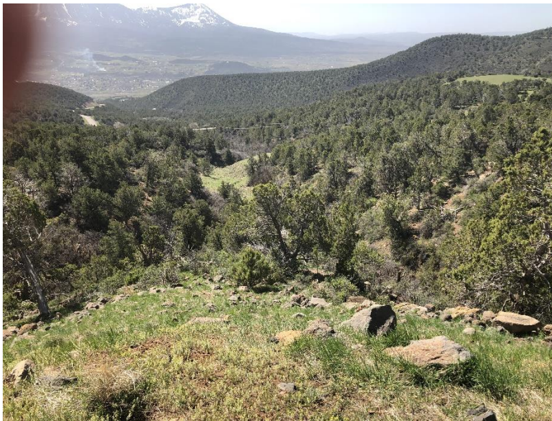
Drainage below Old Waste Disposal Area

Number of Partial Inspection this Fiscal Year: 5