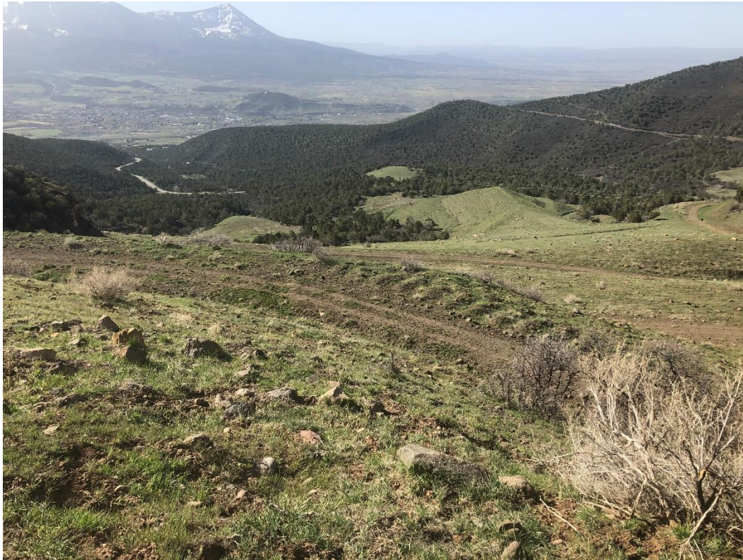
East Mine, lower portion

Number of Partial Inspection this Fiscal Year: 5