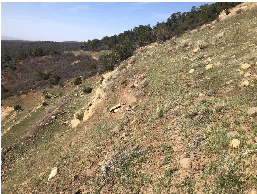
East Mine, area of concern due to remaining fencing material

Number of Partial Inspection this Fiscal Year: 5