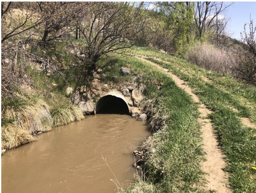
Farmers Ditch below the loadout

Number of Partial Inspection this Fiscal Year: 5