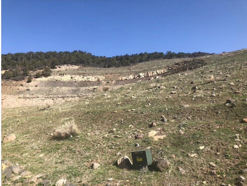
East Mine, upper portion