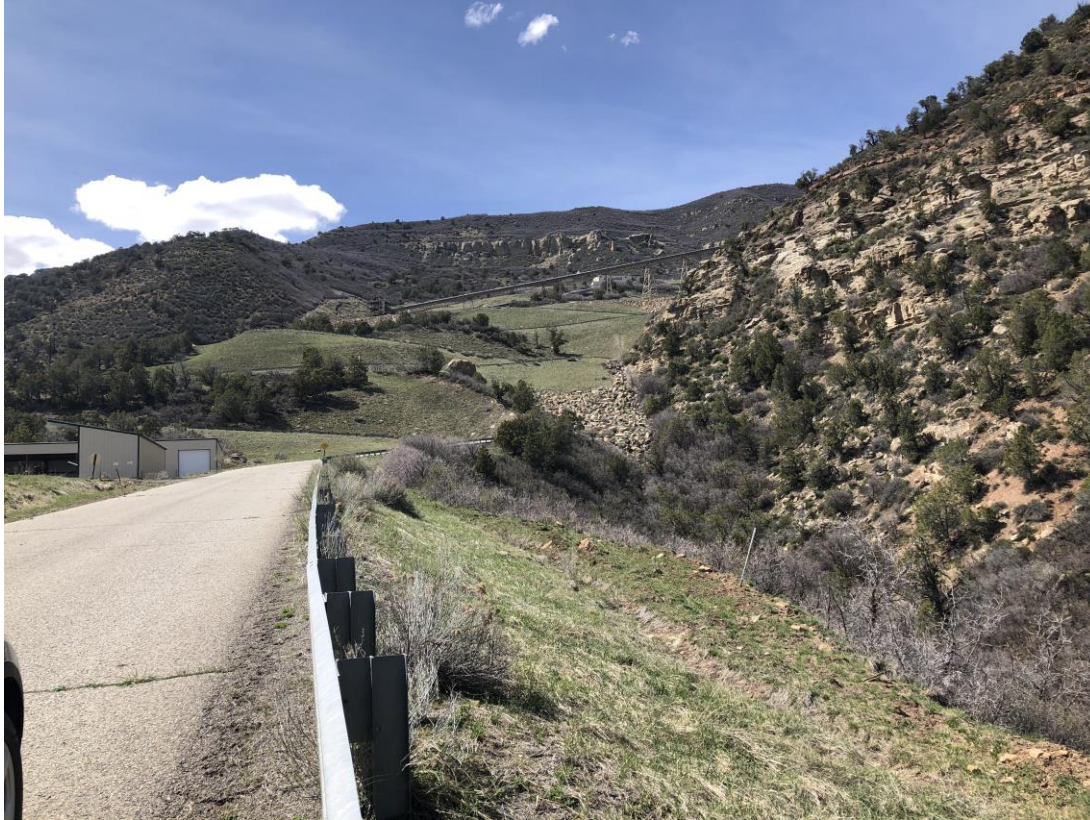
Road to portals

Number of Partial Inspection this Fiscal Year: 5