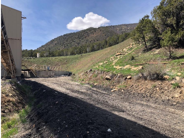
Hill above Prep Plant and Ditch B18