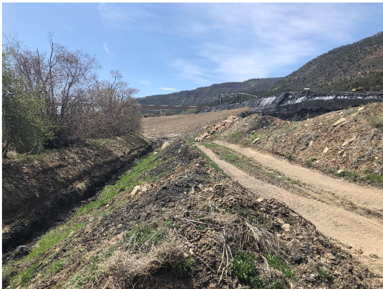
Ditch below Gob Pile #3

Number of Partial Inspection this Fiscal Year: 5