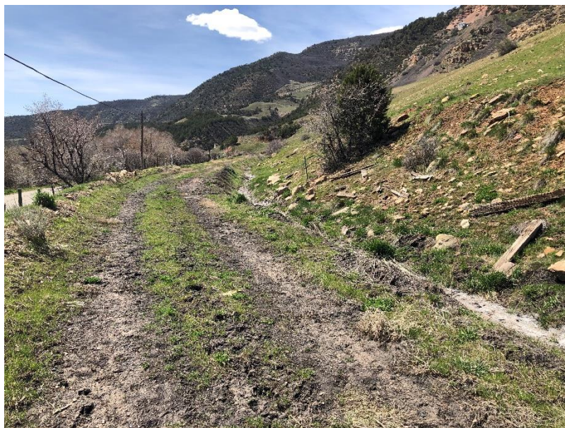
Ditch into Pond F (D-F7a)

Number of Partial Inspection this Fiscal Year: 5