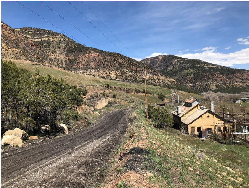
Road to Gob Pile #2, with old Power Plant on right

Number of Partial Inspection this Fiscal Year: 5