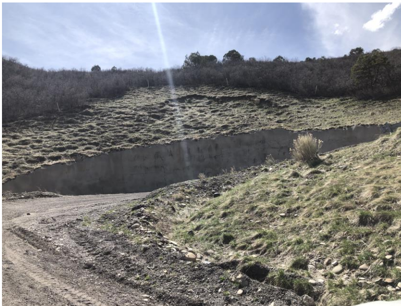
Slump at Curve 11

Number of Partial Inspection this Fiscal Year: 5