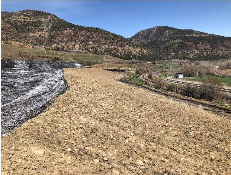
Coverfill spread below Gob Pile #3