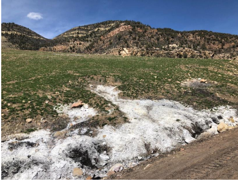
Seep on lower portion of Gob Pile #2