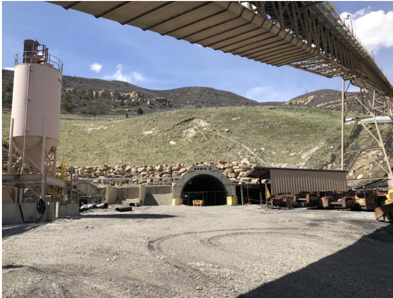
Slump above B Portal