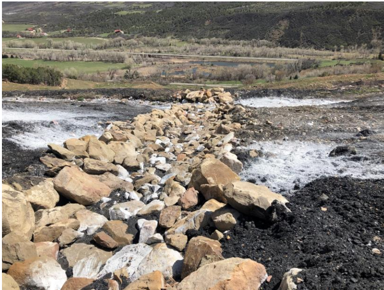
Ditch from un-reclaimed portion of Gob Pile #2

Number of Partial Inspection this Fiscal Year: 5