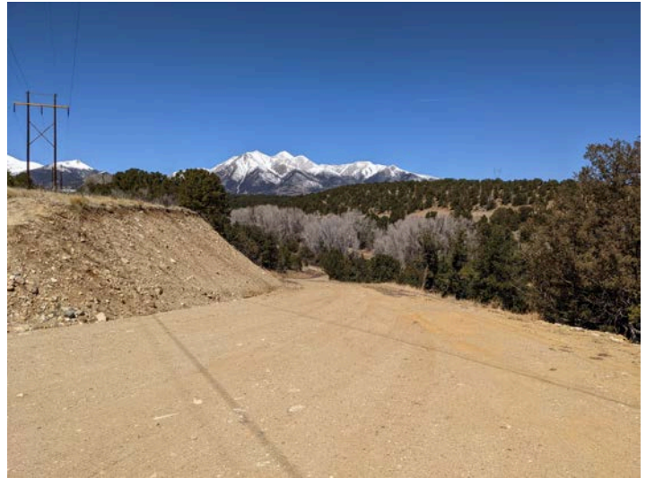
Existing access road from Hwy 50