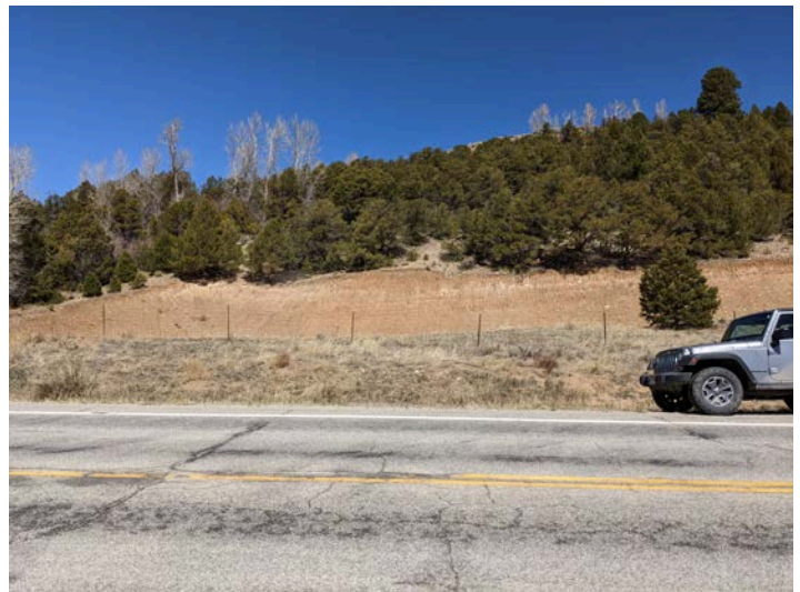
Entrance to access road from Hwy 50

Blake Bennetts ACA Products, Inc. 702 Gregg Drive Buena Vista, CO 81211