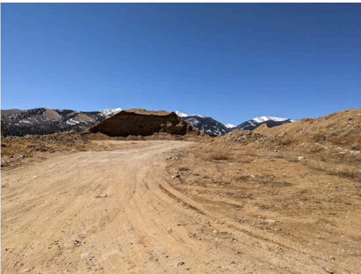
Material from road construction stockpiled in east part of proposed permit area