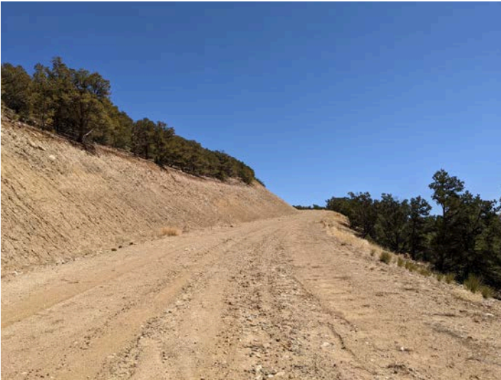
Existing access road from Hwy 50