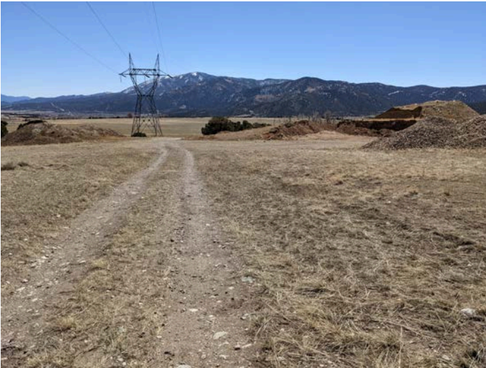
Present conditions proposed permit area