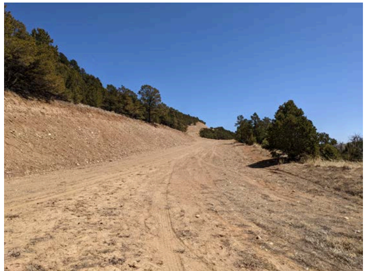
Existing access road from Hwy 50