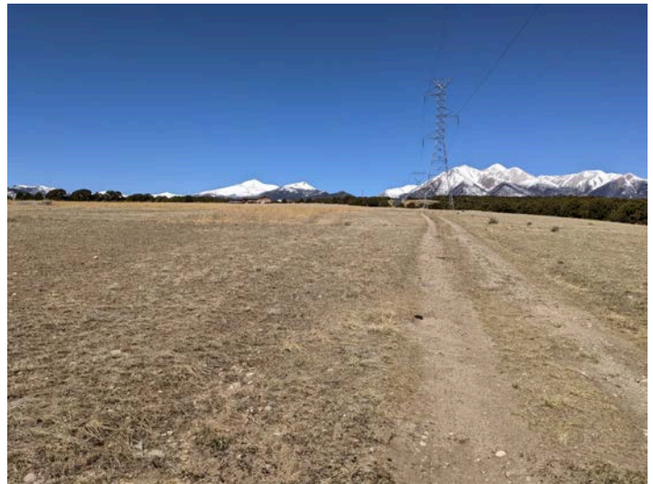
Present conditions proposed permit area