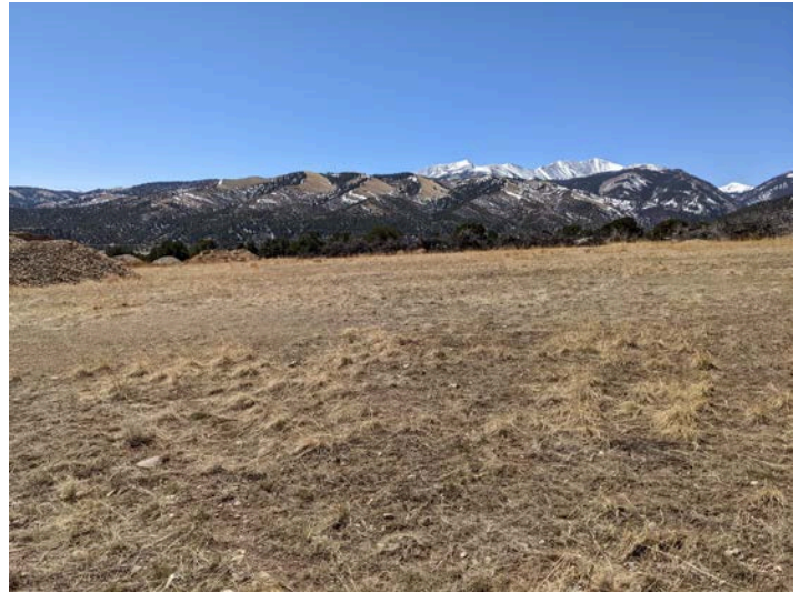
Present conditions proposed permit area