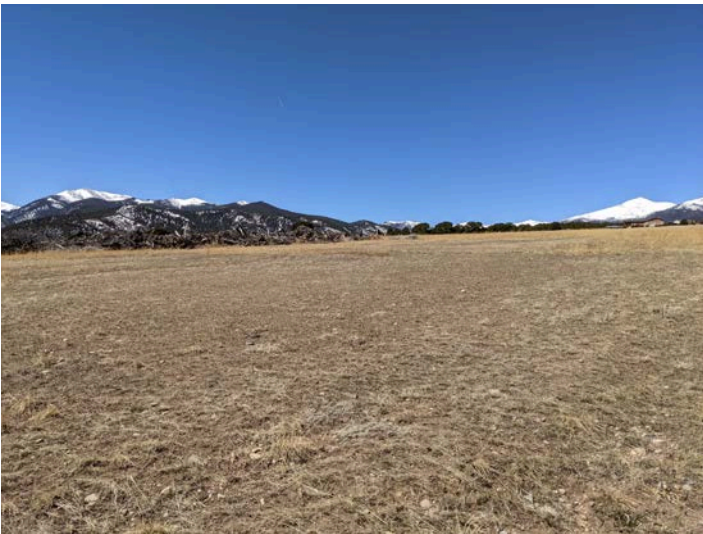
Present conditions proposed permit area