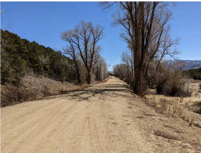
Existing access road from Hwy 50