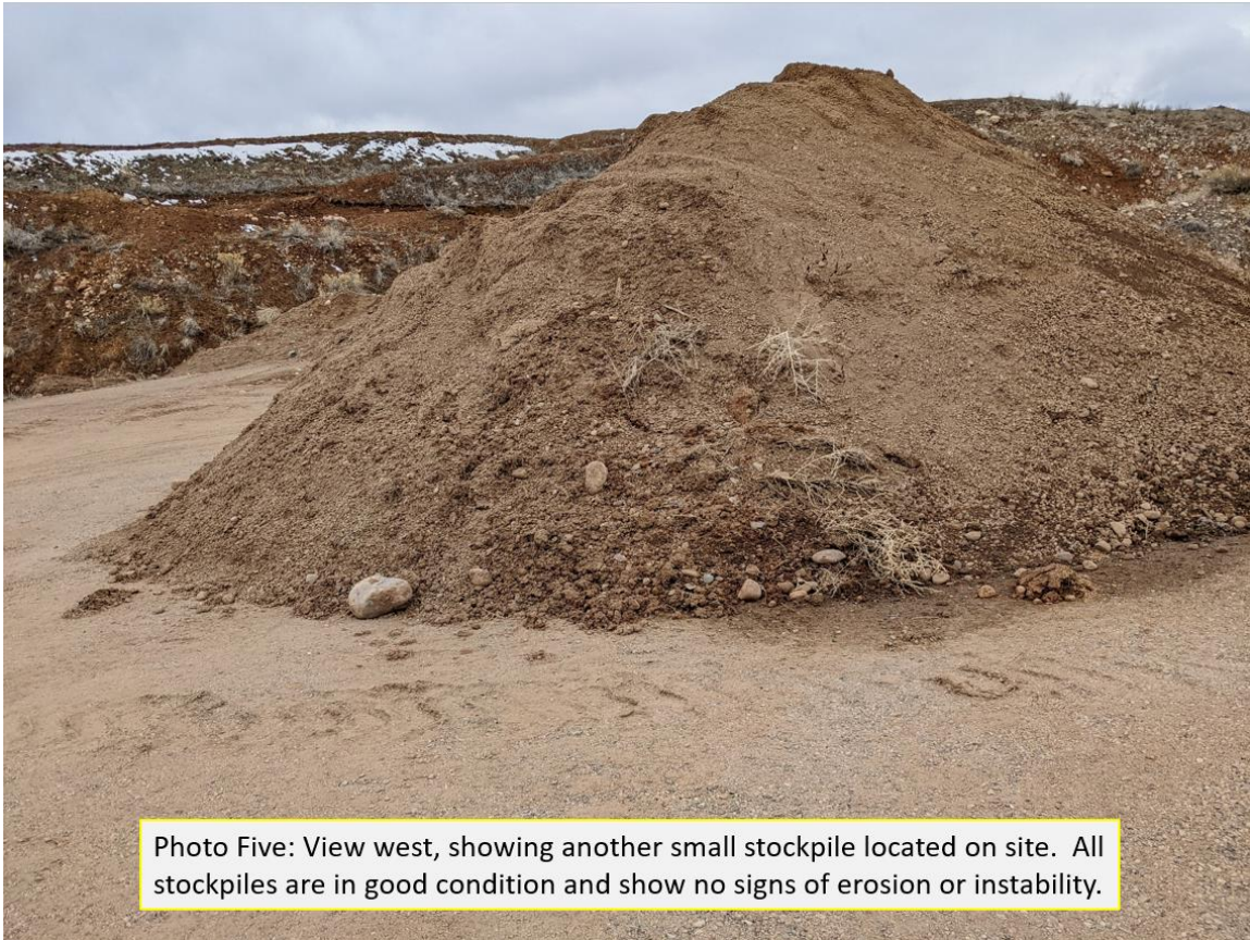
Photo Five: View west, showing another small stockpile located on site. All stockpiles are in good condition and show no signs of erosion or instability.