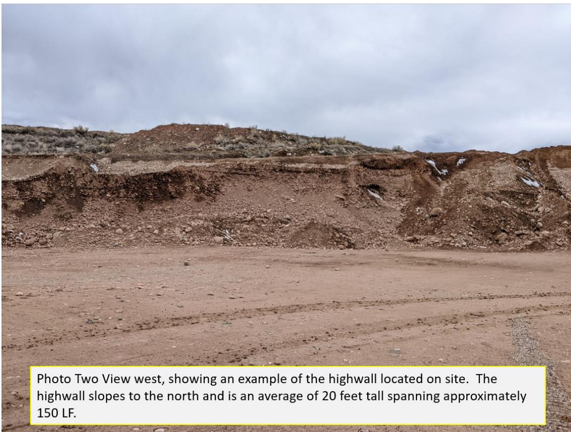
Photo Two View west, showing an example of the highwall located on site. The highwall slopes to the north and is an average of 20 feet tall spanning approximately 150 LF.