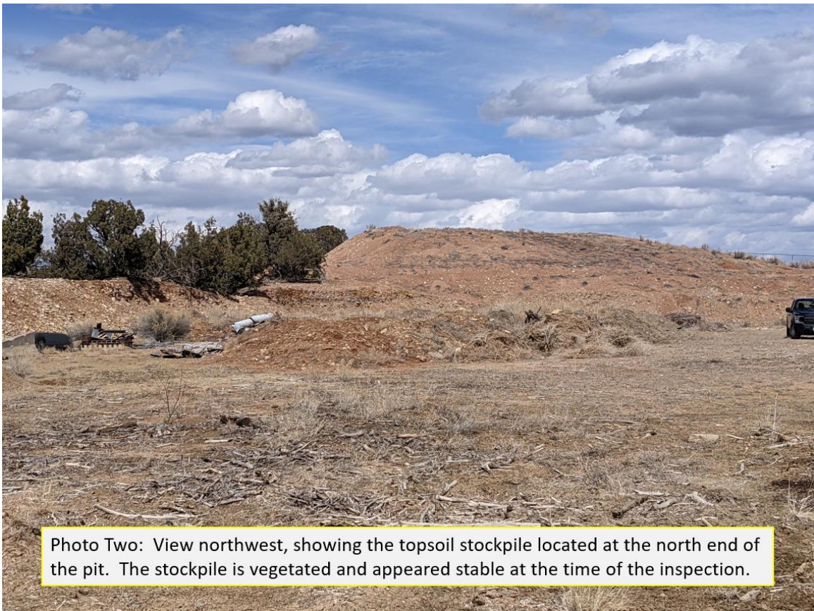
Photo Two: View northwest, showing the topsoil stockpile located at the north end of the pit. The stockpile is vegetated and appeared stable at the time of the inspection.