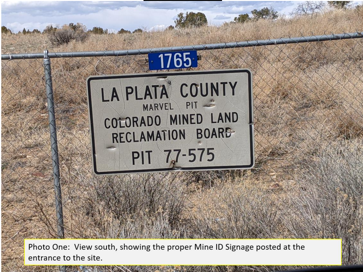
Photo One: View south, showing the proper Mine ID Signage posted at the entrance to the site.