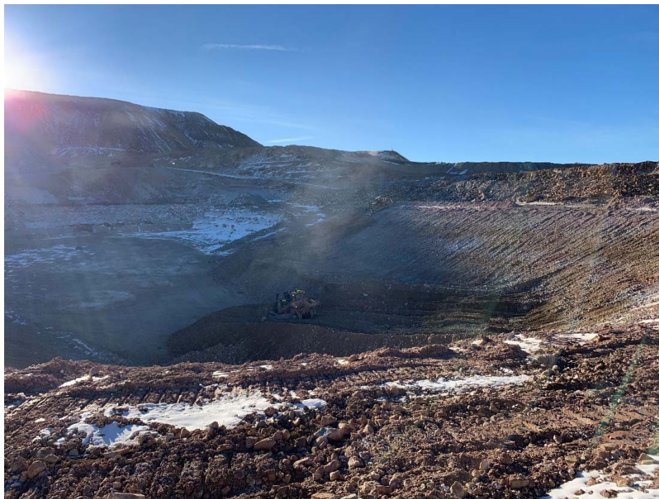
March 23, 2022 – PSSA Overburden cut progress (TW)