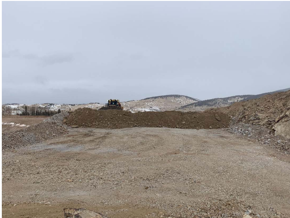
March 21, 2022 – High Compaction Backfill placement progress (TW)