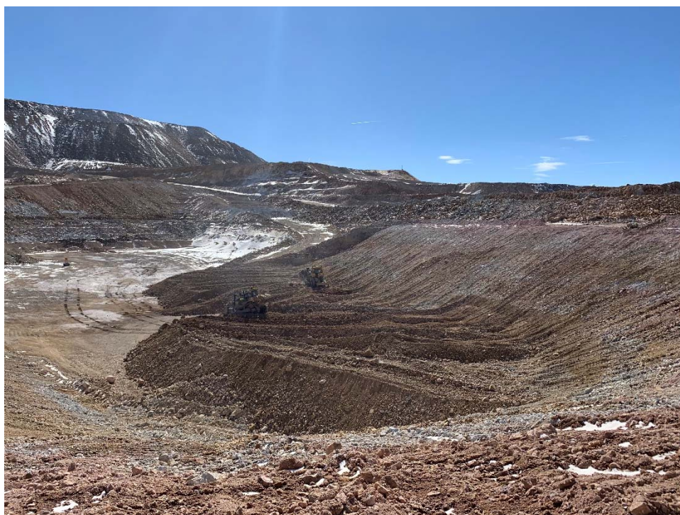
March 24, 2022 – PSSA Overburden cut progress (TW)