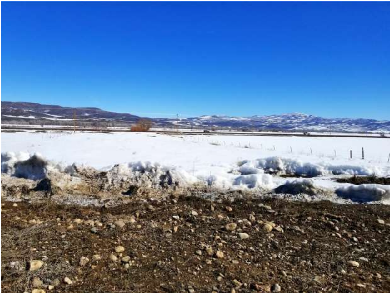
Photo from trail parking area, looking north toward Hwy 40.