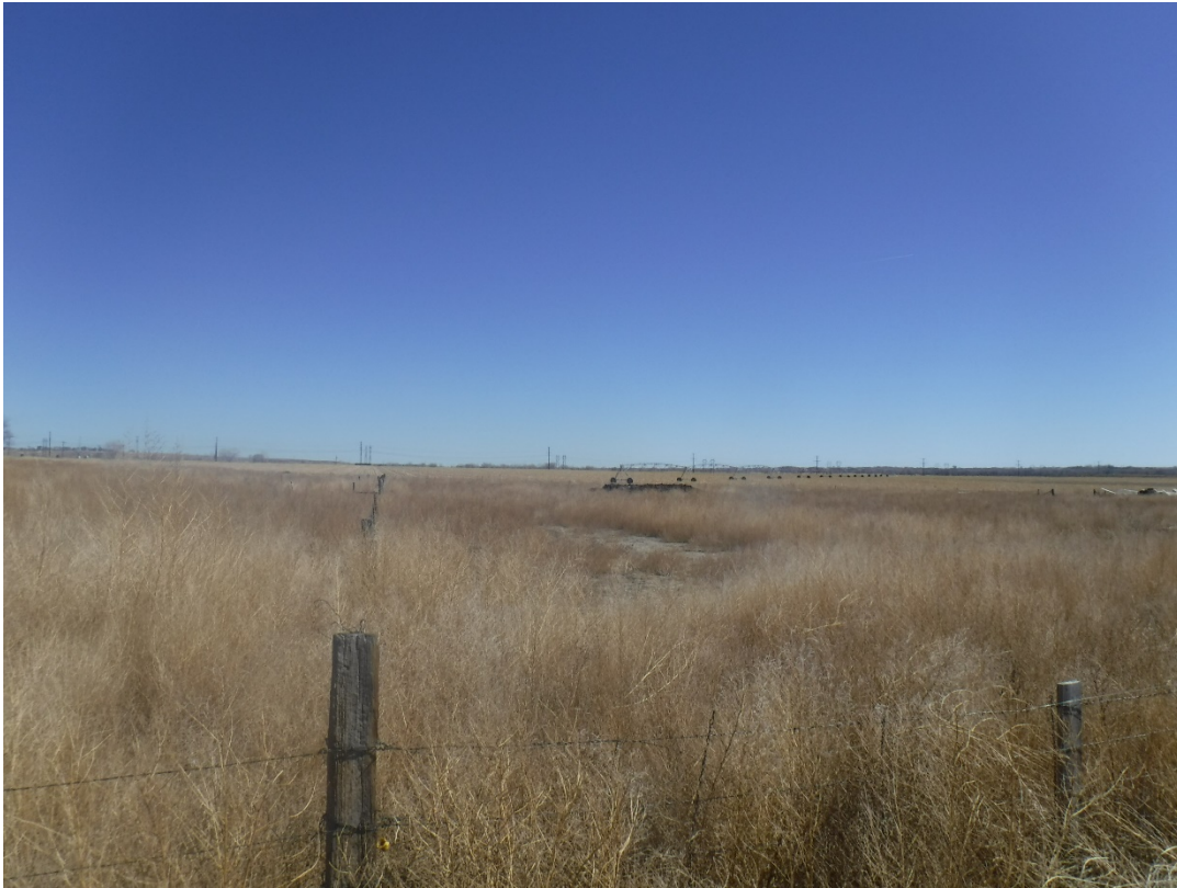
Photo 3: Looking east at the pivot north of the St. Barbara permit