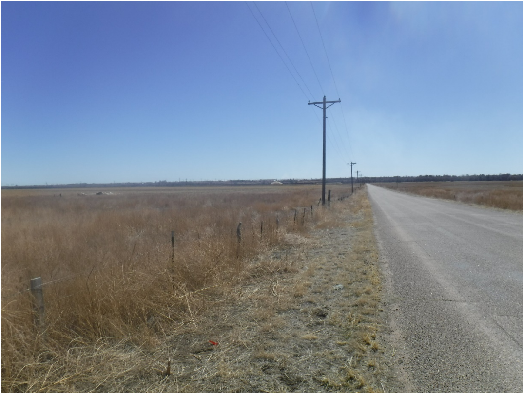
Photo 4: Looking south along Nyberg Rd towards the St. Barbara permit