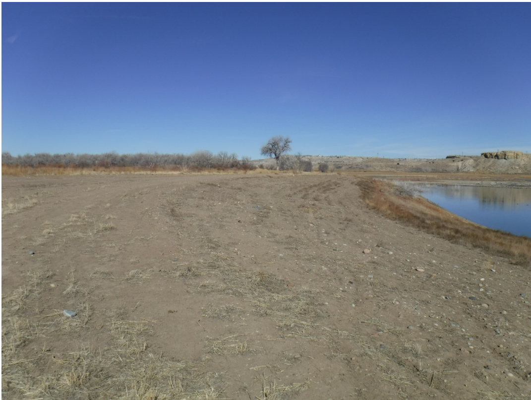
Photo 2: Mowing and seeding area that occurred towards the end of 2021