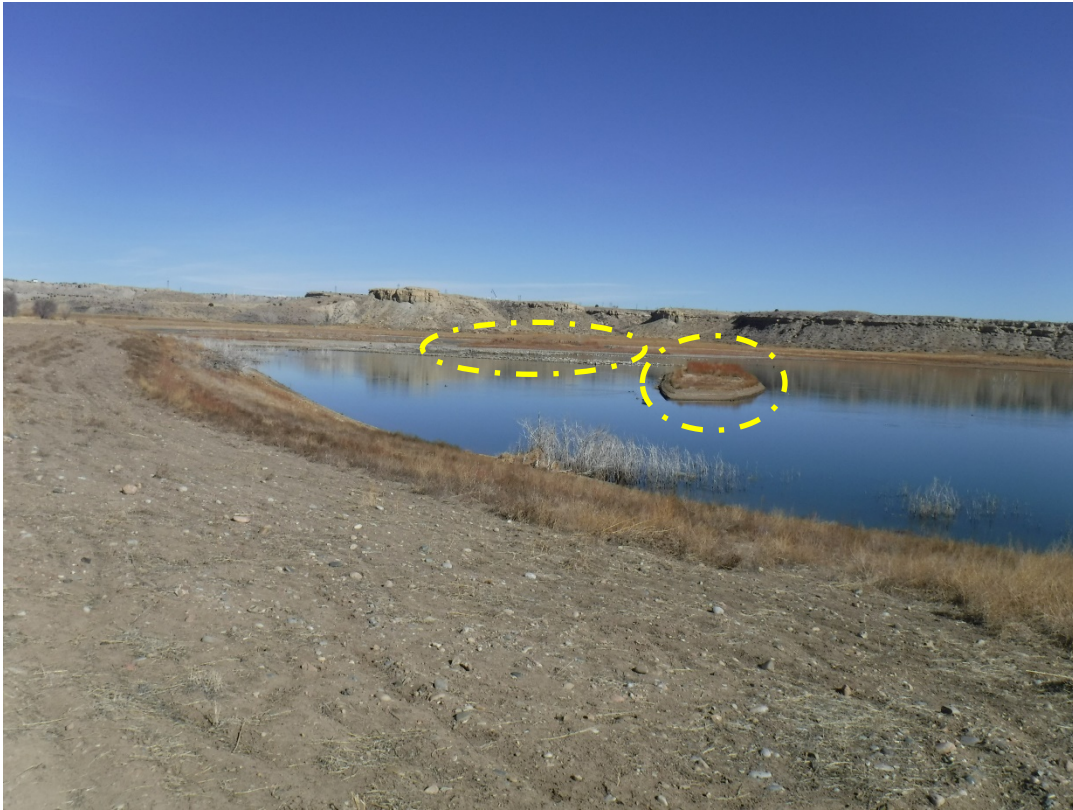
Photo 3: Remaining topsoil islands, circled yellow, that may be removed from reservoir