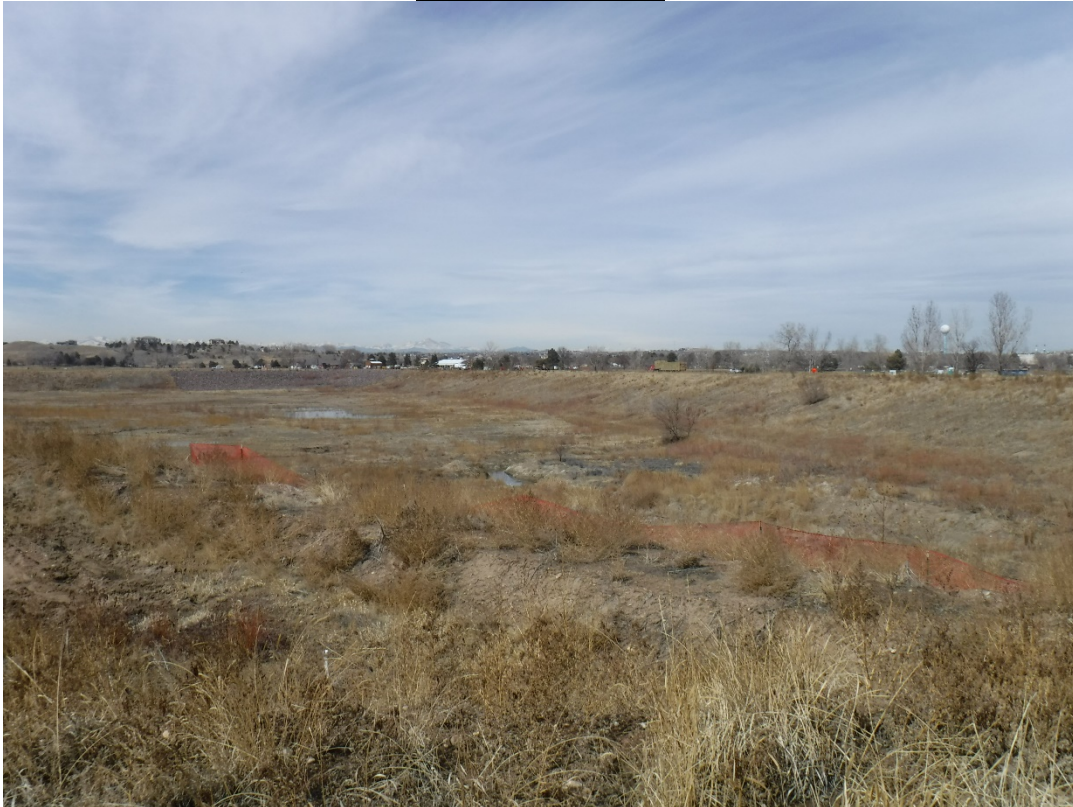
Photo 1: Looking west across the north end of Lake 1, slope failure center foreground of photo