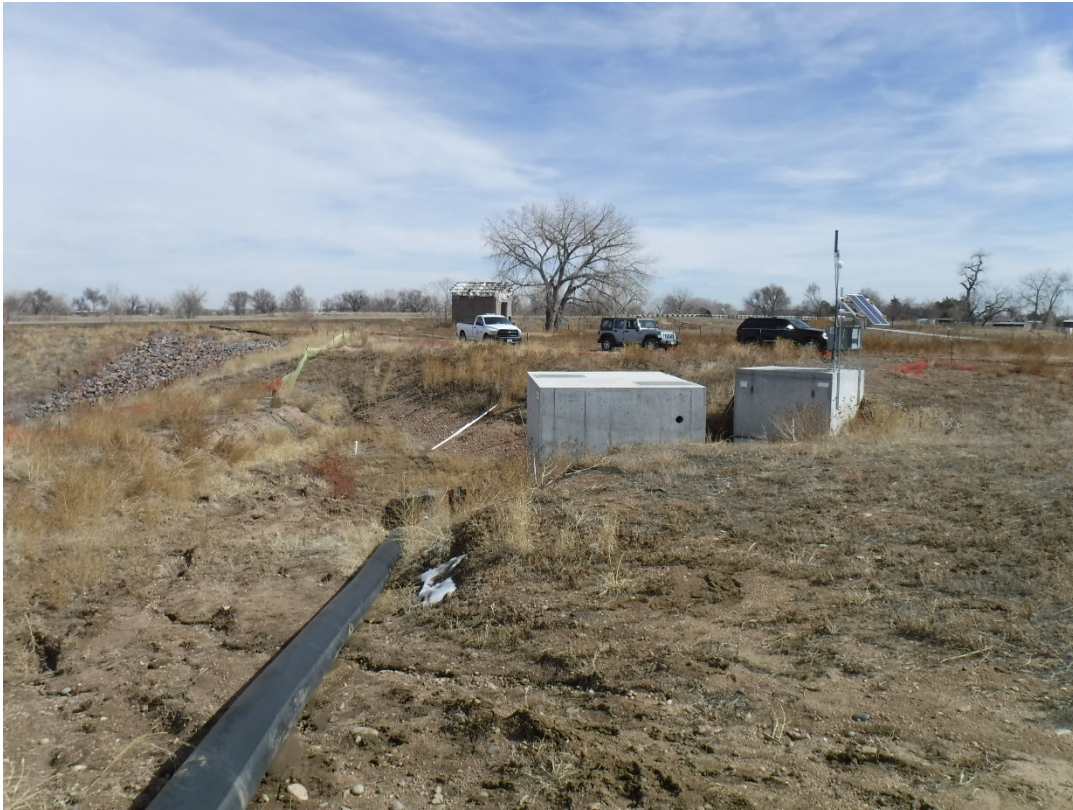
Photo 3: Looking north across the slope failure, repairs due to begin later this year