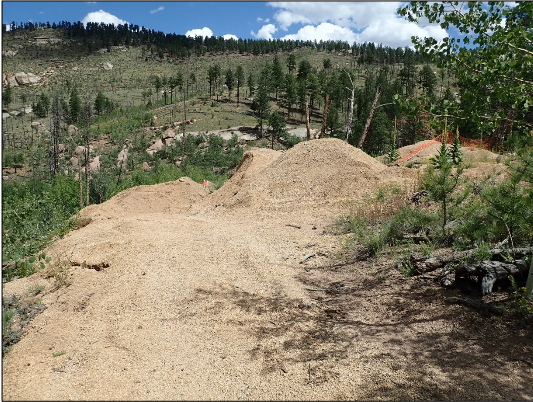
Photo 2. Northwest portion of dig site with access trail (left) leading down into the dig; looking east.