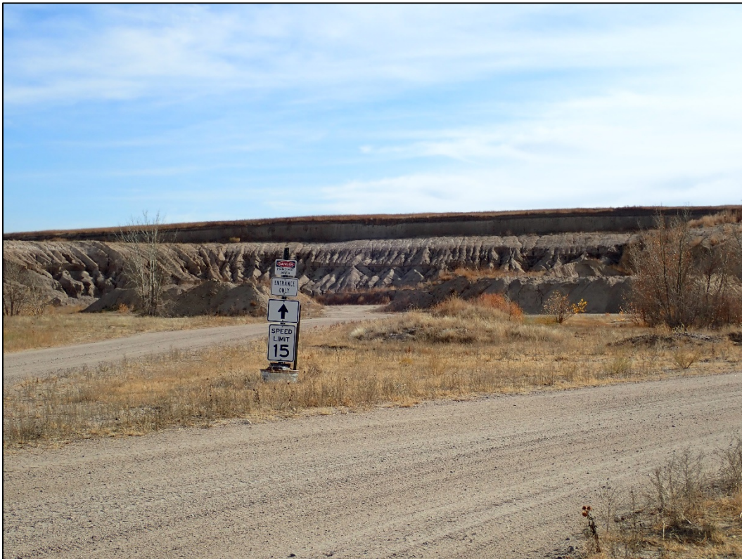
Photo 6. North facing mining slope and topsoil stockpile along the southern boundary; looking south.