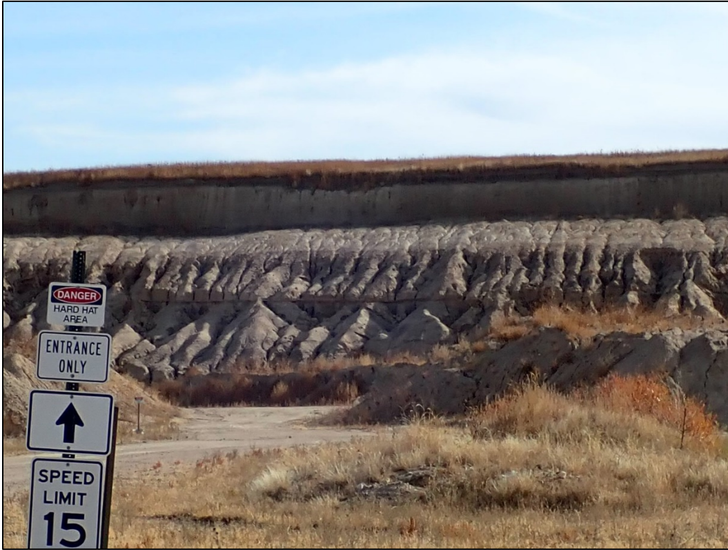
Photo 7. Zoomed in area of Photo 6 to highlight the topsoil stockpile and mining slope concern; looking south.

Dave Hornung Kit Carson County P O Box 160 Burlington, CO 80807