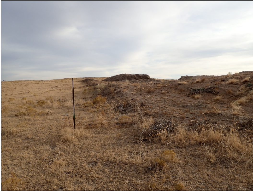
Photo 3. Northeast boundary marker, topsoil stockpiled along permit boundary; looking southeast.