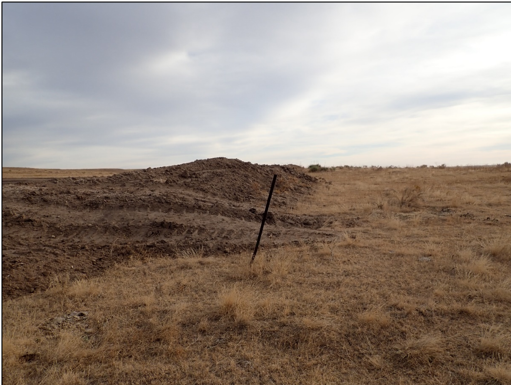
Photo 4. Northwest boundary marker, topsoil stockpiled along permit boundary; looking south.