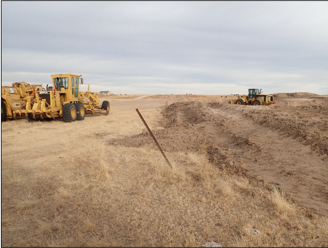
Photo 5. Northwest boundary marker, topsoil stockpiled along permit boundary; looking east.

James McCormick McCormick Excavation & Paving, LLC 30887 US Highway 24 Stratton, CO 80836