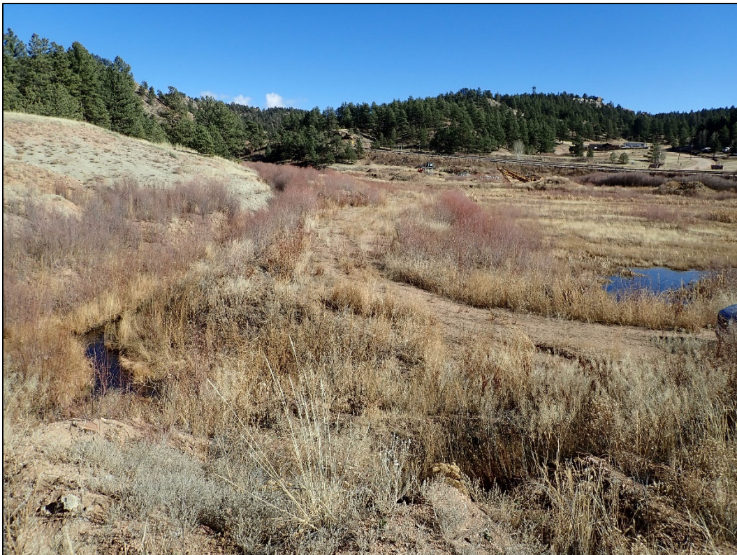
Photo 2. Northwest corner of permit, twin creek is on the left side of image; looking east.