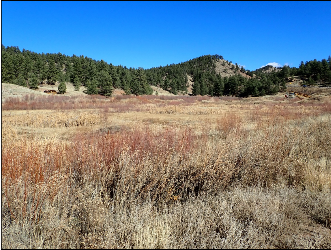
Photo 3. Central are of the permit where the meandering channel has been established; looking northeast.

Harold Clare The Clare Corporation P.O. Box 1 Florissant, CO 80816