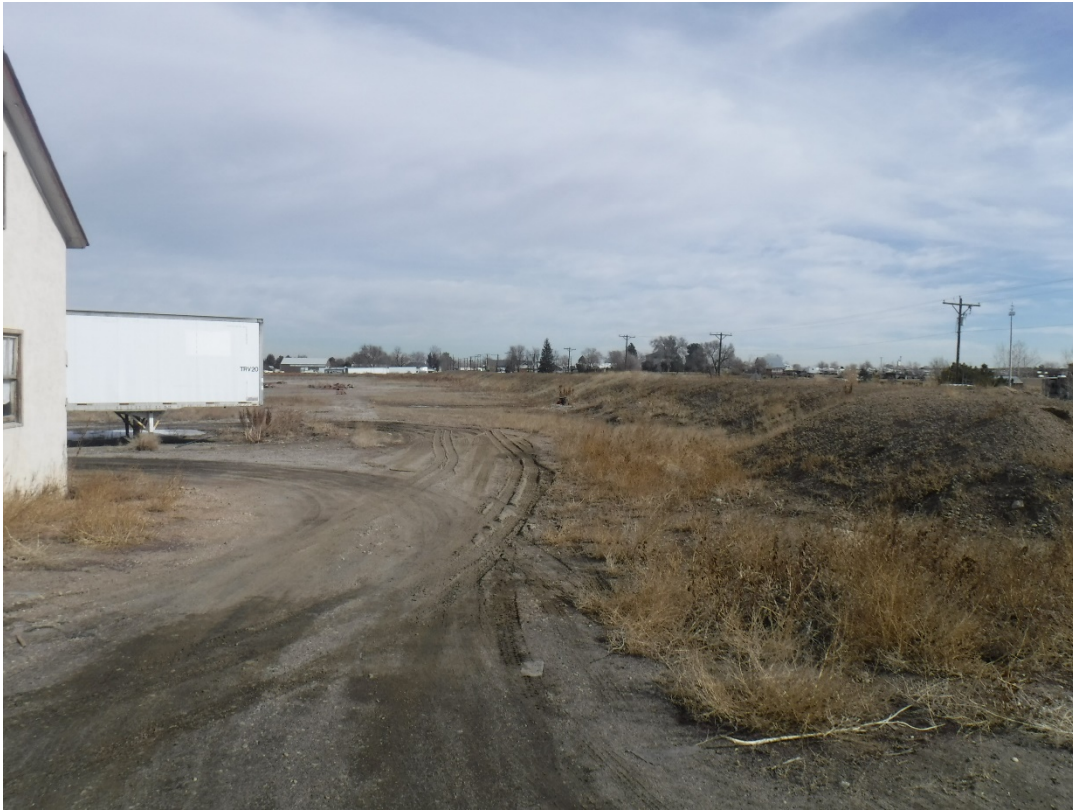
Photo 3: Topsoil stockpiles along eastern permit boundary adjacent to Brighton Road, looking north