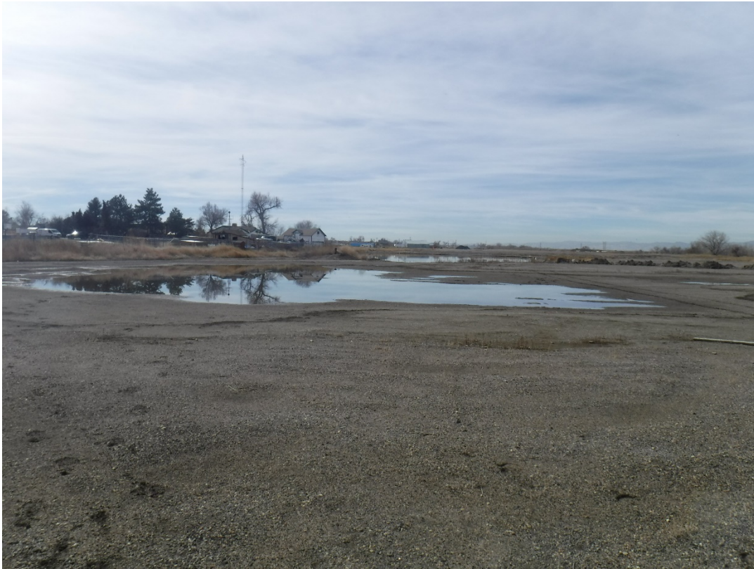
Photo 7: Area detaining storm water located north of the unlined pond