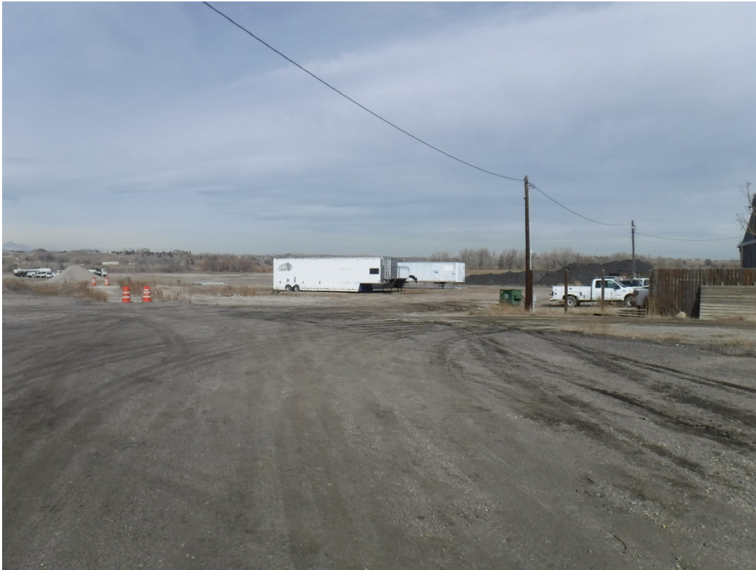
Photo 5: Miscellaneous equipment being stored onsite along with what appears to be a recycled asphalt pile