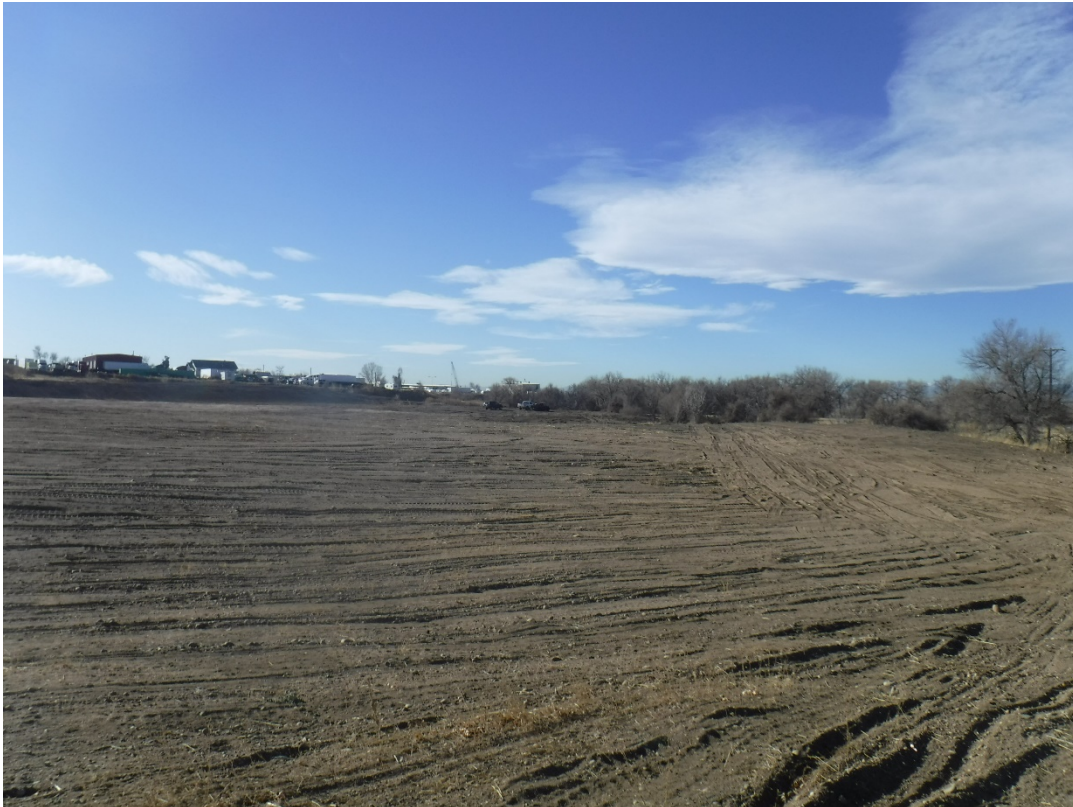
Photo 10: Looking south across the site from the northwest corner.