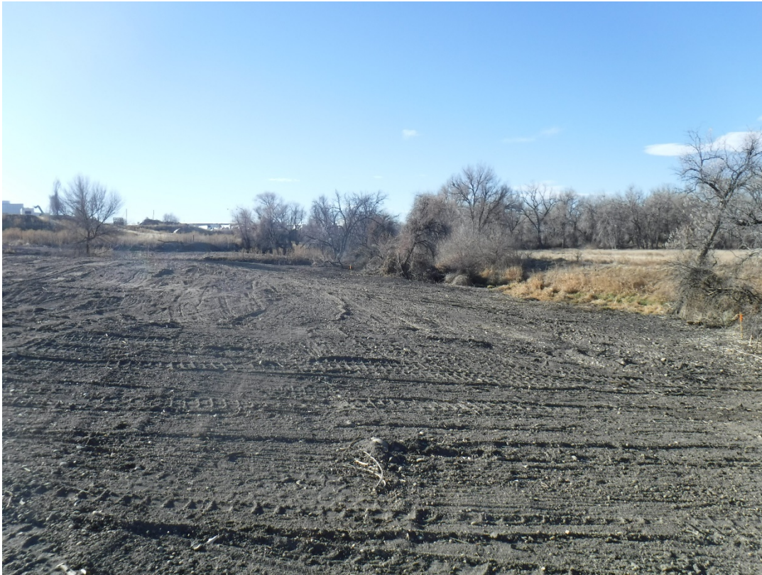
Photo 3: Looking south along Bull Seep towards the southwest corner of site