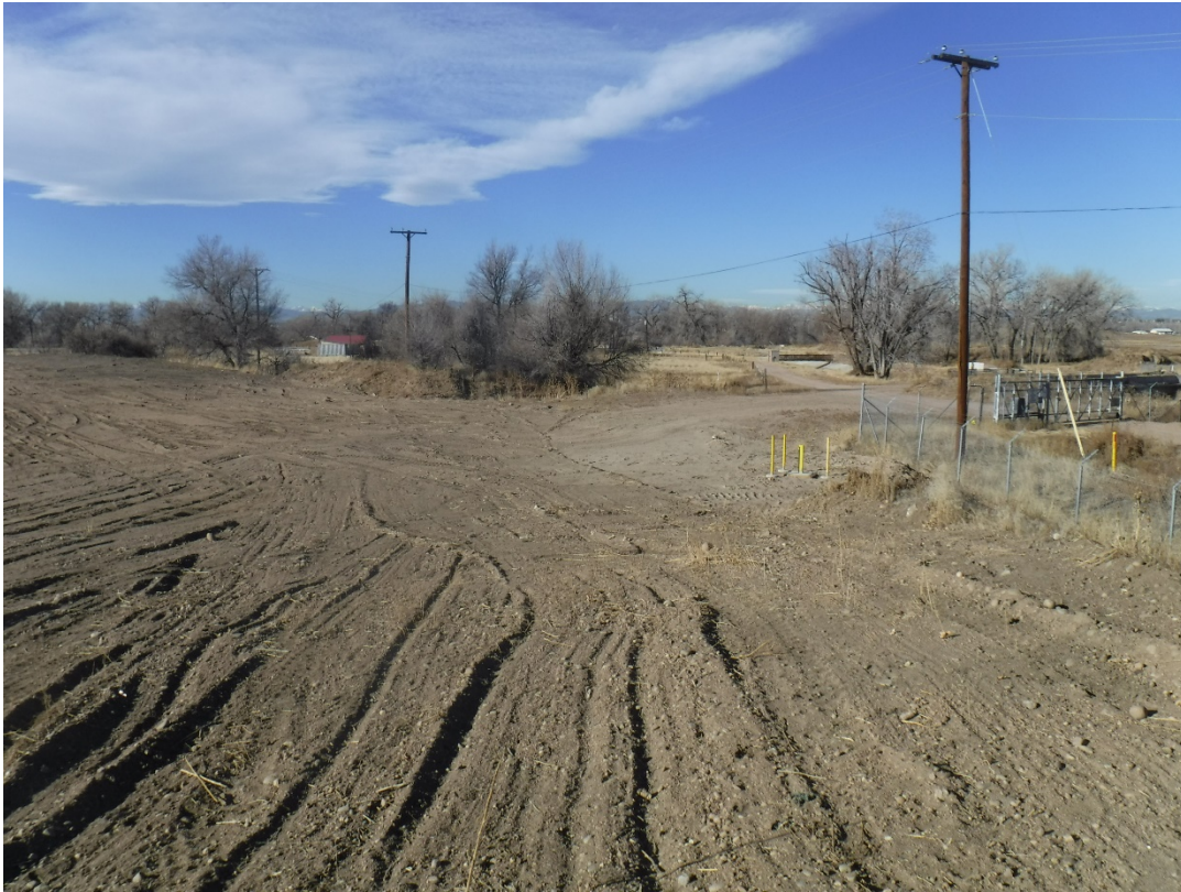
Photo 9: Northwest corner of site with power poles and monitoring well