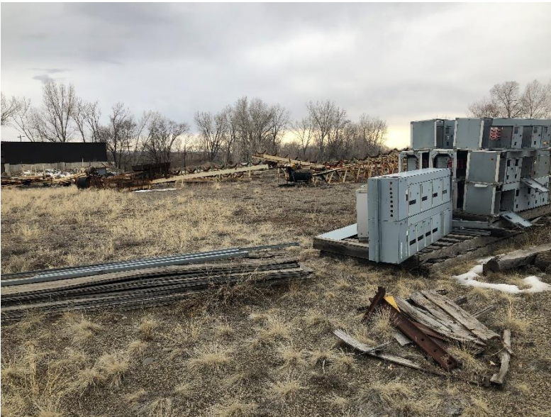
Equipment stored on site