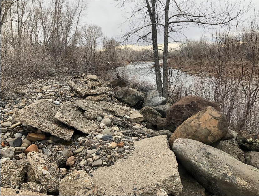
Riprap on river bank (North Fork of the Gunnison)