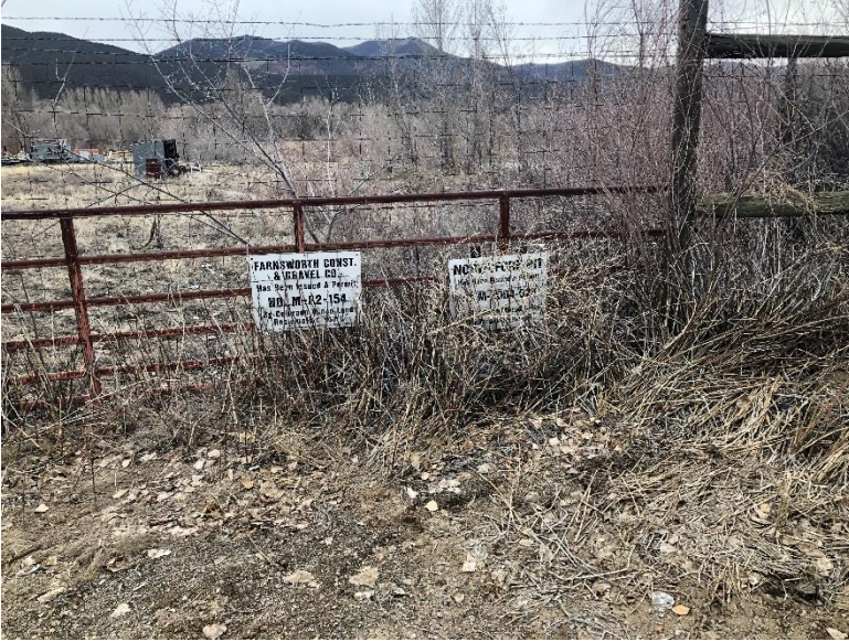
Entrance sign partially covered by vegetation that should be removed