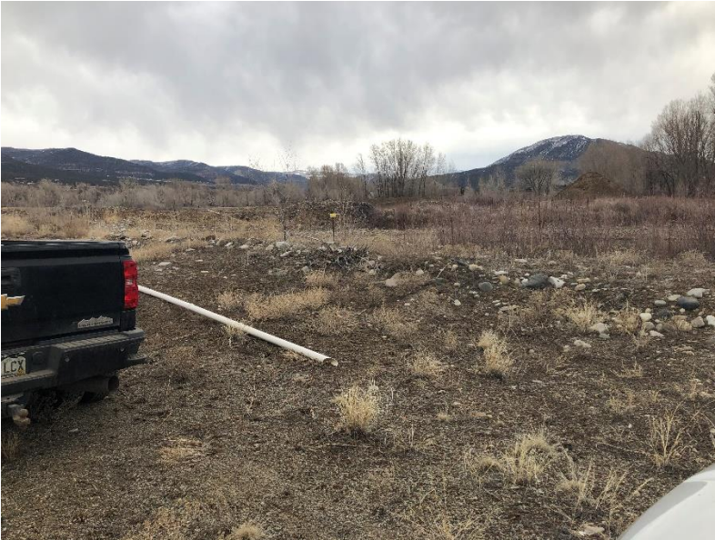
Fence with boundary sign