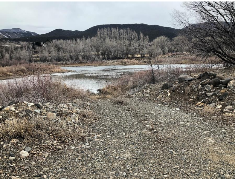
Access to river for sand and gravel extraction