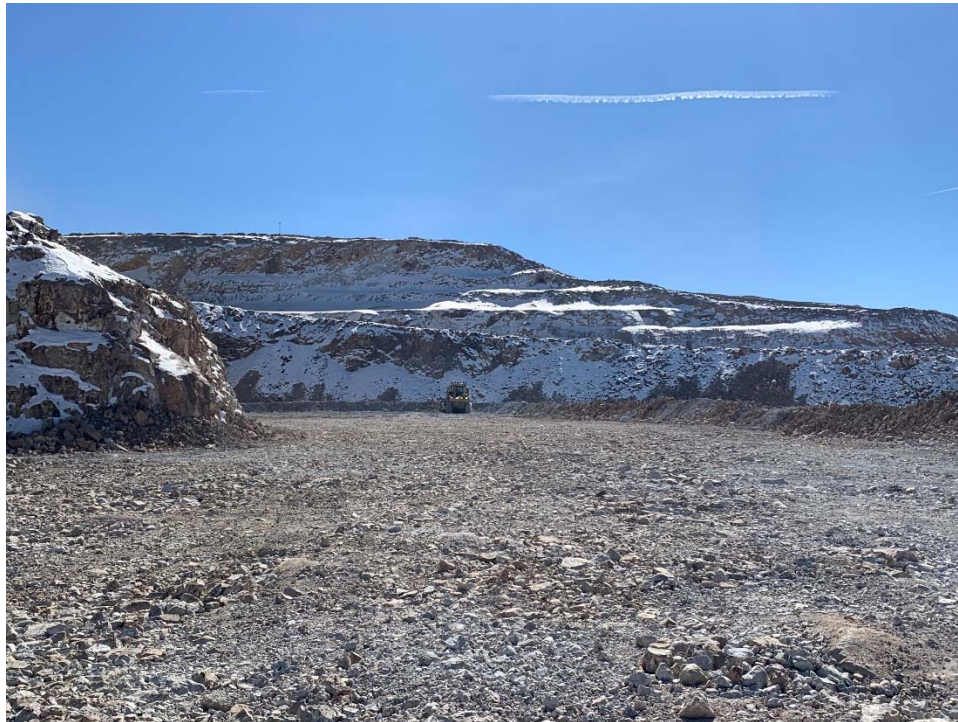
February 14, 2022 – High Compaction Backfill placement (TW)