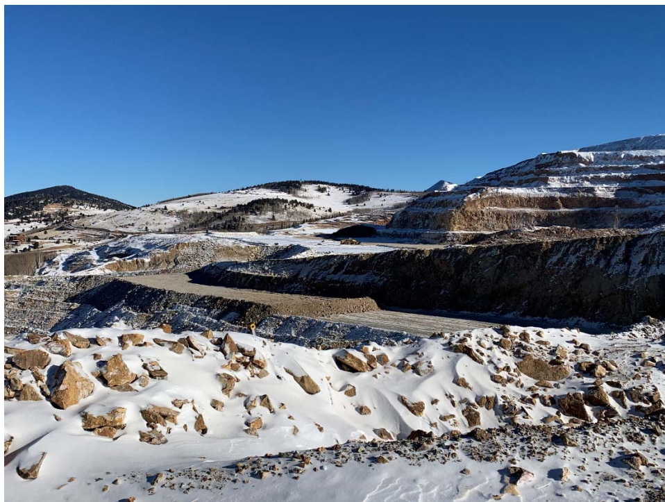
February 18, 2022 – High Compaction Backfill progress (TW)