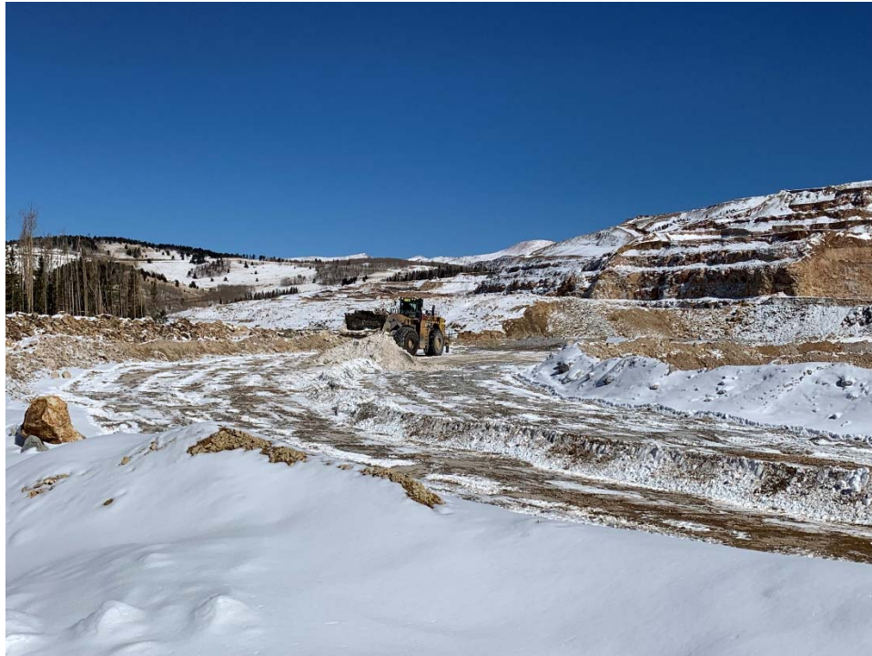
February 18, 2022 – High Compaction Backfill snow removal (TW)